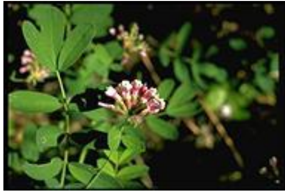
© 1995 Saint Mary's College of California 7

Protocol URL: https://courses.washington.edu/esrm412/protocols/LOAB.pdf