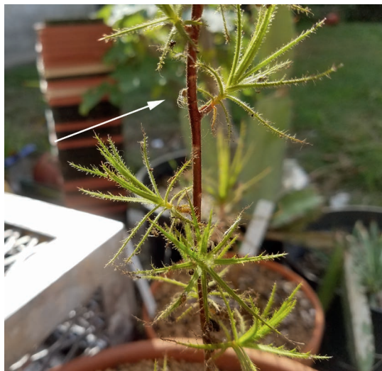
Figure 1: Peuceetia longipalps resting on Roridula dentata in Long Beach, California.