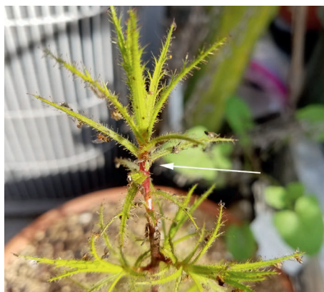
Figure 3: A Cyrtopeltis sp. nymph feeding on a prey item on a cultivated Roridula dentata in Long Beach, California.