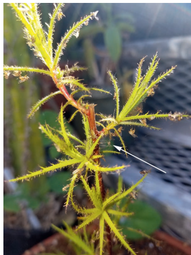
Figure 2: Peuceetia longipalps and a shed skin, illustrating the fact that this spider does in fact live on, in, and amongst this Roridula dentata in Long Beach, California.