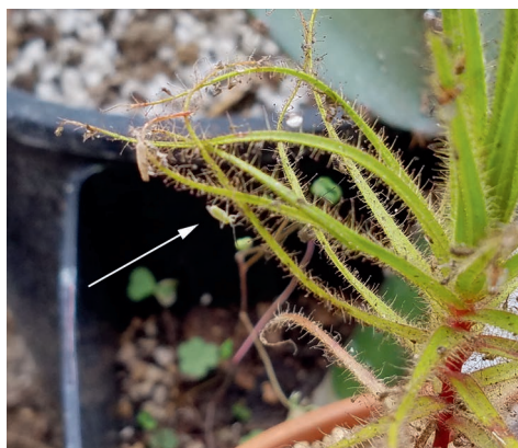
Figure 4: A Cyrtopeltis sp. living on the underside of Roridula gorgonias .

In addition to the Miridae bugs, young Peuceetia longipalps spiders have been reliably observed living among my Roridula specimens. This species of spider appears uninhibited by the sticky glands of the Roridula plants. On my larger R. dentata , up to 2 spiders have been observed living together simultaneously. On my smaller R. gorgonias , only 1 young spider has thus far been observed. These Peuceetia spiders weave minimal web structure, and instead wait for the plants to trap small flying insects. Notably, the spiders have invariably left the confines of the Roridula plants as their maturity develops. I have never observed adult Peuceetia spiders on Roridula .