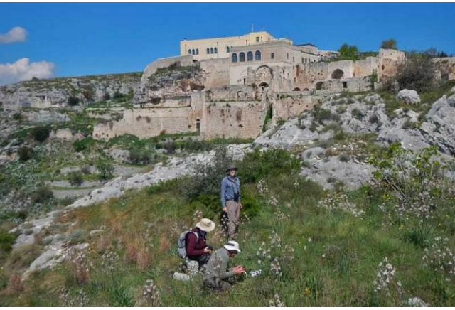
Botanists below the Pulsano Monastery