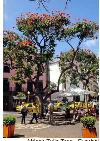
African Tulip Tree - Funchal