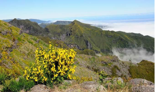
Botanic Garden Broom - Cytisus scoparius - Pico Ruivo