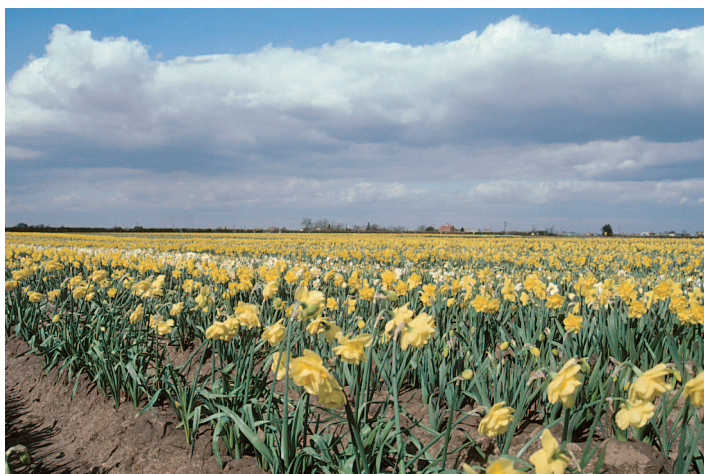
Figure 1. General view of a commercial daffodil crop.

'Neck rot' has symptoms similar to basal rot, but it starts at the top of the bulb rather than the bottom (Price and Linfield, 1981). A number of fungi have been considered as