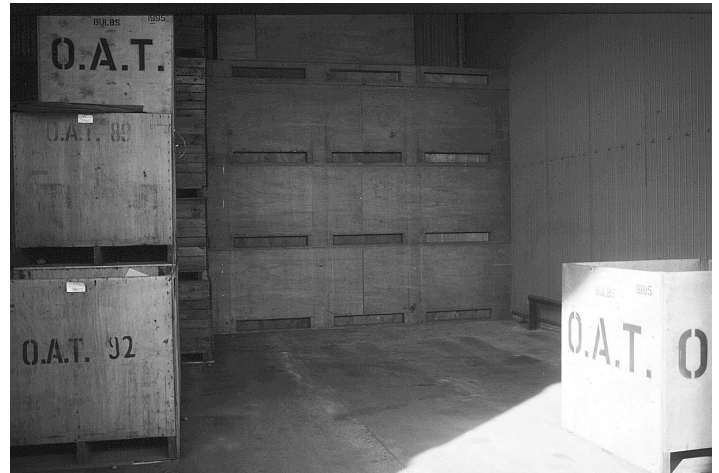
Figure 4. Letter box drying wall. Bulbs in one-tonne bulk bins (left) are placed against the drying wall (right background) which houses powerful fans. Air (at 35°C) is blown through the 'letter-box' openings into the pallet bases of the bins, and up through the bins to dry the bulbs in 2–3 days.

Once lifted, bulbs have to be cleaned, inspected (removing damaged and diseased bulbs and splitting up bulb