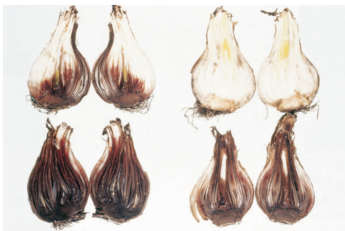
Figure 2. Basal rot symptoms – half bulb views.