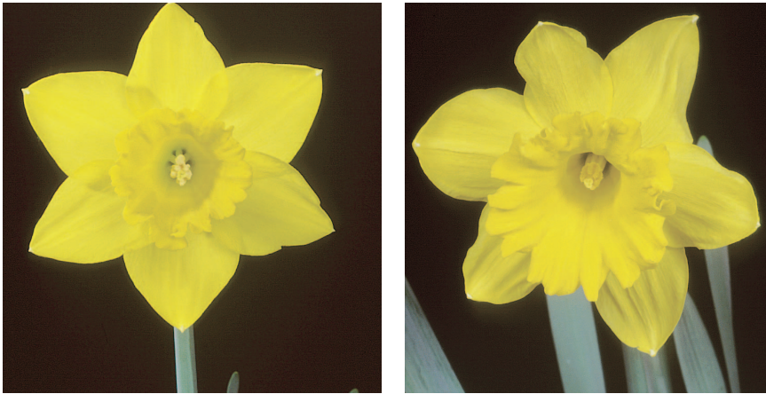
Figure 5. Two narcissus cultivars important in breeding – ‘St Keverne’ (LEFT) (with field resistance to basal rot) and ‘Golden Harvest’ (RIGHT) (highly susceptible).