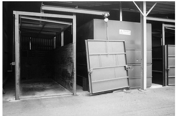
Figure 3. Hot-water treatment tanks: Bulk bins of bulbs are loaded into the tanks by a fork-lift truck, the door is secured and pre-heated water is pumped into the treatment tank from a holding tank.

Many growers utilise the HWT procedure to add fungicides (and sometimes an insecticide to control large