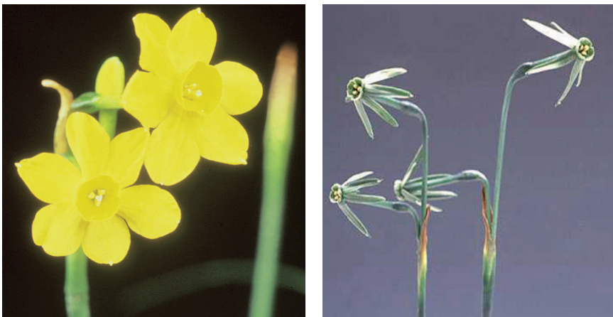
Figure 6. Narcissus jonquilla (LEFT) and N. viridiflorus (RIGHT), basal rot-resistant species being exploited in narcissus breeding.