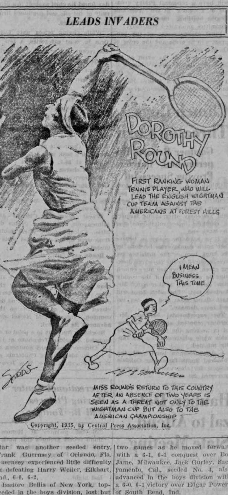
MISS ROUND'S RETURN TO THIS COUNTRY AFTER AN ABSENCE OF TWO YEARS IS SEEN AS A THREAT NOT ONLY TO THE WIGHTMAN CUP BUT ALSO TO THE AMERICAN CHAMPIONSHIP.

a kind of guarantee that no discrimination has been tolerated. We answer: A German government solemnly arrived at with the Holy See will probably not bother a great deal about what it says to Mr. Brundage.