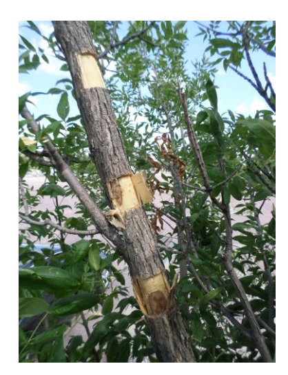
infested that long.

However, we are not finding a lot of either yet in our canopy sampling. The larval population is smaller than the population that infested the trees in 2016 and 2017 (based on examination of the older galleries). This may mean that most of eggs have yet to hatch and I suspect this is the case. We will continue to do weekly sampling and report in the Update .