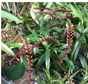
falcatum 'Standing Tall' AM/AOS $18