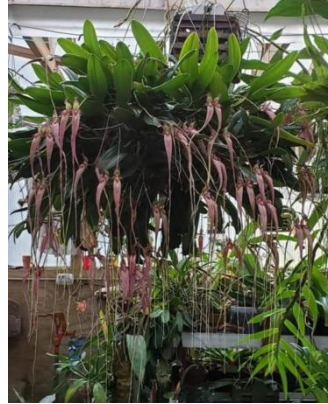
Melting Point $20