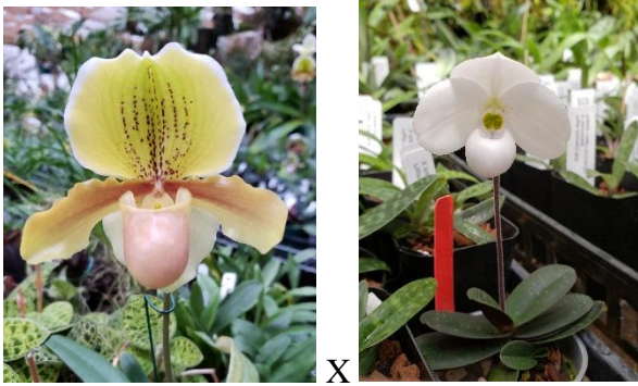
Paph (Memoria Sandra Pechter Song X thaianum) $30