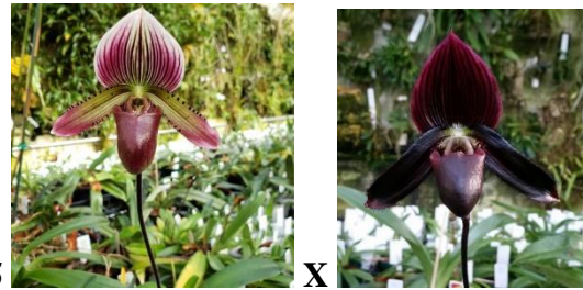
Paph Natalie Goldston (Donna's Bird X Vercruyse ) $25

Donna's Bird is half Paph fowliei, which helps reduce the size. Colors should range anywhere from coloratum to dark vini-color. Parents pictured