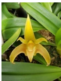
lobbii "Kathy's Gold" AM/AOS $20