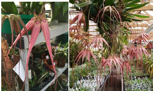
Elizabeth Ann 'Buckleberry' FCC/AOS $30

Divisions will be at least three bulbs and will be potted in moss. Must be pre ordered