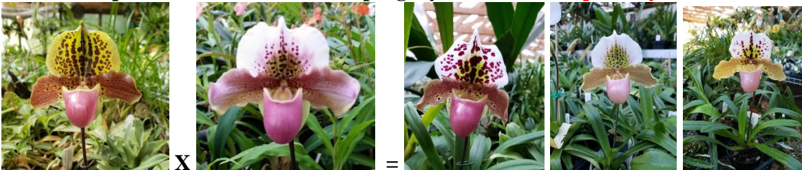
Paph Chiada Gill (thaiantum X delenatii 'Deerwood' AM/AOS) $30

Paph Tiny Leopard (Little by Little 'War Eagle' HCC/AOS X Mary's Little Leopard 'Deerwood' AM/AOS) $30 Spots, Spots and more Spots! With henryanum strongly present in all 4 grandparent, and the spotted Paph exul in one, I'm expecting lots of spots. These are now blooming size. Pictured below are the two parents and the first three progeny to bloom. Temporarily Sold Out