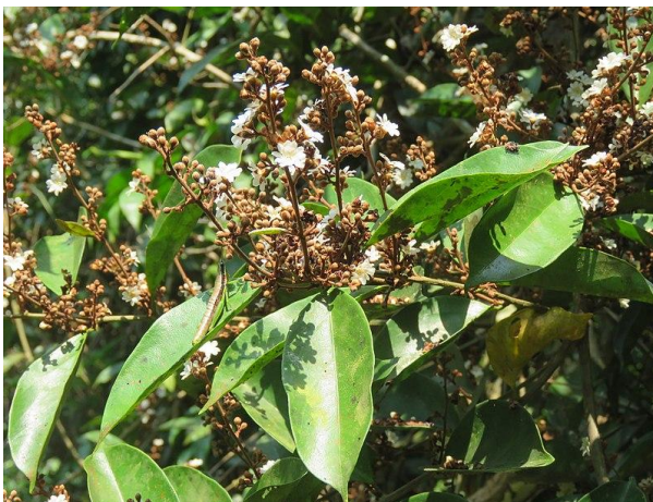
Erycibe paniculata Roxb.