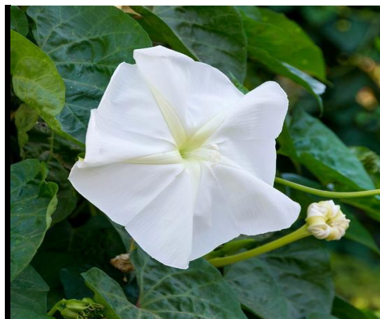
Ipomoea alba L.