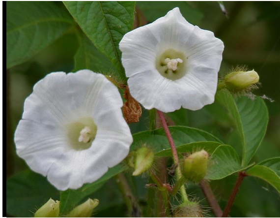
Merremia aegyptia (L.) Urban