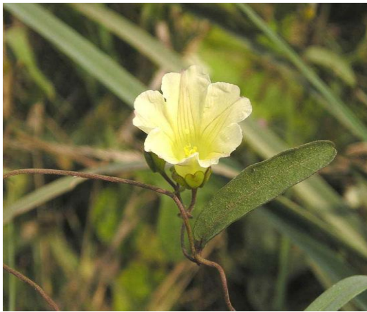
Merremia hirta (L.) Merr.