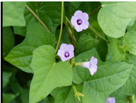
Ipomoea triloba L.