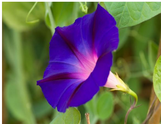
Ipomoea purpurea (L.) Roth.