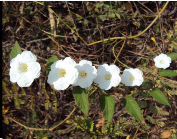
Merremia umbellata (L.) Hall.