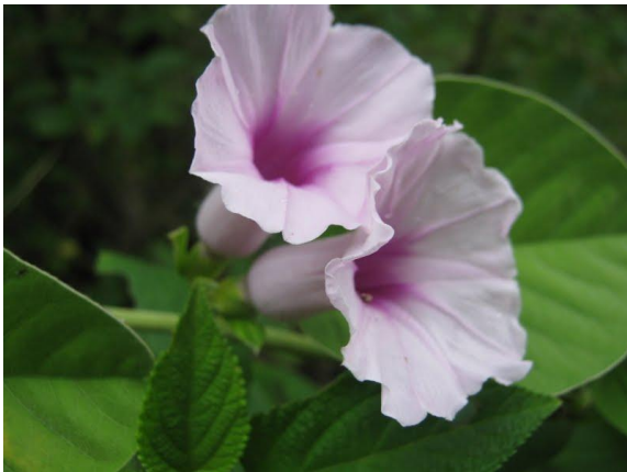
Argyreia pomacea (Roxb.) Choisy