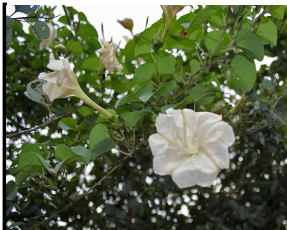
Rivea hypocrateriformis (Desr.) Choisy