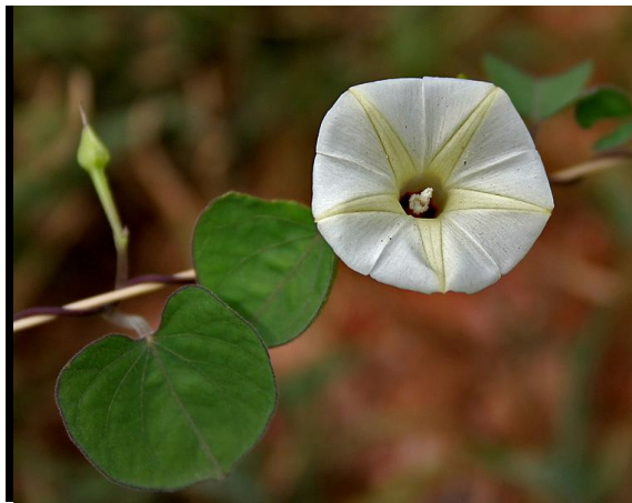
Ipomoea obscura (L.) Ker-Gawl.