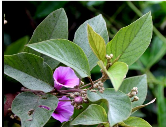
Argyreia elliptica (Roth) Choisy