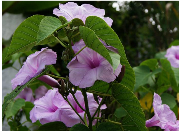
Ipomoea carnea Jack.