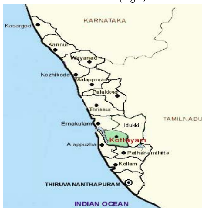
Fig. 1 Map of Kerala showing Kottayam district

the windward side of the Western Ghats. From October to December, Kottayam receives light rain from the Northwest Monsoon. The average annual rainfall is 3, 200 millimetres (130 in). The highest temperature recorded here was 38.5 °C and the lowest was 15 °C. Depending on the location and specific phyto-geographical condition of the district, there are varieties of food crops as well as cash crops are cultivated. Rice is the principal crop extensively cultivated in low lying regions like Vaikom and Upper Kuttanad. The area also suitable for the cultivation of cash crops like rubber plantations . There by it significantly contributes to the overall rubber production in India. Kottayam occupies the first position in the production of rubber in India. Rubber trees provide a stable income for the farmers as well as workers. Apart from these, other crops like tapioca, coconut, pepper, vegetables etc., are also being cultivated in this district (Fig.1).