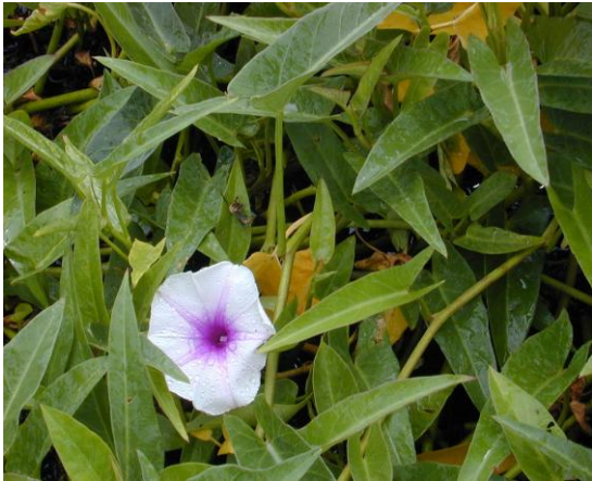
Ipomoea aquatica Forssk.