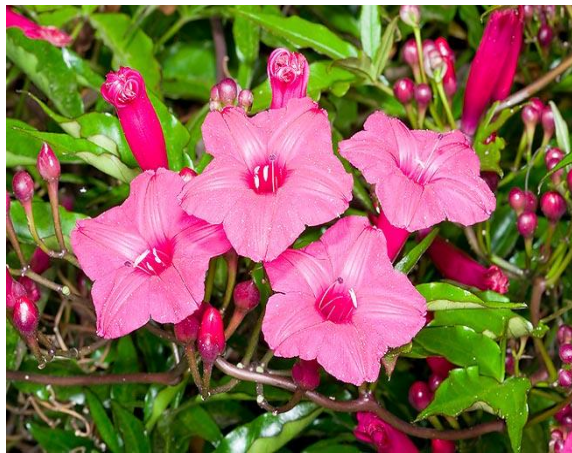
Ipomoea horsfalliae Hook.f.