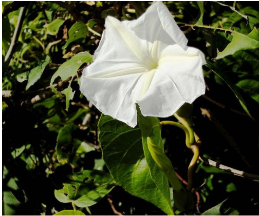
Ipomoea violacea L.