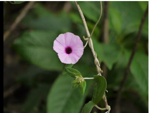
Argyreia sericea Dalz.