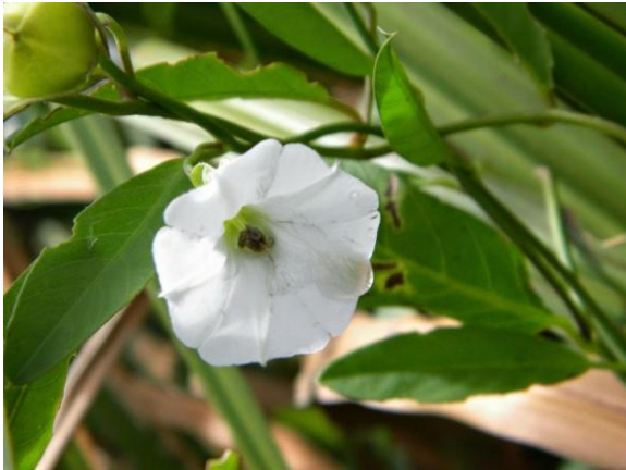
Aniseia martinicensis (Jacq.) Choisy