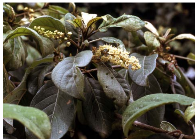
Flowering branch. (source untraceable)

Terminalia brownii is a small (< 20 m) deciduous tree with round or flat crown, often straight bole. Branches tend to appear from whorls, which gives the tree a layered appearance. Young bark light and pubescent, old bark grey and fissured. Leaves alternate – spirally arranged at the end of the branches; simple, entire, elliptic-ovate, 5-8 cm long, 3-5 cm wide, petiole 2-3 cm, glabrous below, apex pointed. Flowers small, white in 7-10 cm long many-flowered spikes, with an unpleasant smell. Individual flowers consist of calyx, 5 stamen and ovary; no petals. Flowers are hermaphroditic or male.