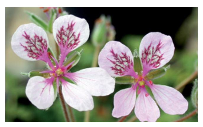
Fig. 1. Close view of two flowers of Erodium cazorlanum from the same inflorescence illustrating the morphological changes associated to floral ontogeny and protandry. Initially, during male phase (right flower) stigmatic lobes are closed, stamens are straight and anthers dehisce to offer pollen, note the two already dehisced anthers showing abundant red pollen. After, during female phase (left flower) the five receptive stigmatic lobes open in a star like shape, the stamens draw back and eventually anthers fall down, note that only one anther remains attached to the filament. Those changes functionally reduce the possibility of autonomous selfing but asynchrony among flowers allows geitonogamy.

a stamen with forceps and brushing the dehisced anther directly onto the stigma until all five lobes were thoroughly coated with pollen, as easily observed with magnifying glasses. In the vast majority of cases anthers were detached from the flower immediately before being used for experimental pollinations, only occasionally some anthers were preserved sealed in a vial till the next day if the recipient flower was not receptive. All pollinations were marked by placing a small numbered jeweler tag around the pedicel.