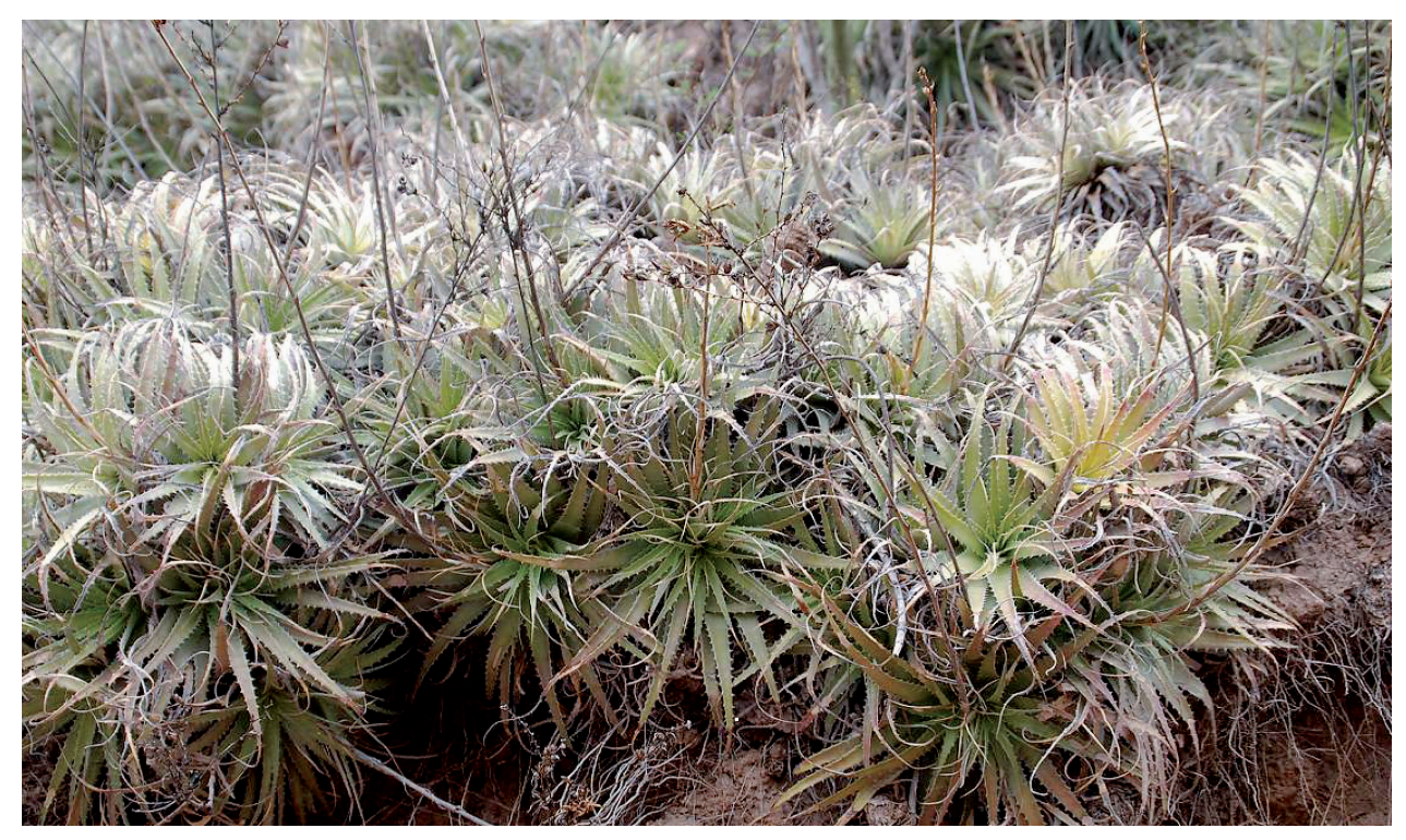
Fig. 23. A species of the bromeliad genus Puya showing the dead leaves that serve as a substrate for Perichaena calongei.

na (Fig. 23). It has proved to be an excellent substrate for myxomycetes as cultures of the leaf bases have been over 94% positive for myxomycete fruiting bodies or plasmodia. No other substrate, of the more than 100 moist chamber cultures, prepared with native plant remains from the same areas produced this species. It therefore appears to have microhabitat requirements found so far only in this plant genus.