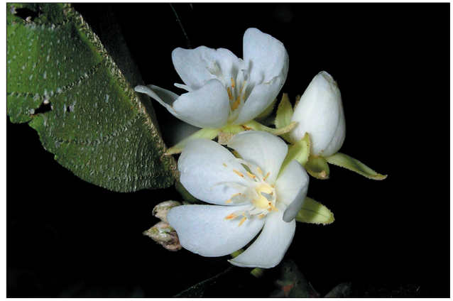
FIGURE 3. Flowers of Dombeya mandenensis (Malvaceae sensu lato), a Priority 2 species known only from Mandena (where it occurs within the newly-established conservation zone, comprising parcels M15 & M16) and from Sainte Luce.

The re-evaluation of the priority species conducted for the present analysis based on information gathered since 2001, resulted in changes in status for eight taxa (for example Table 1). Three of these taxa ( Asteropeia micraster , a new species of Pentarthopalopilia , and Pentopetia boivinii ) were removed from the list because populations were located outside the Tolagnaro region, and one taxon that had been added in 2001