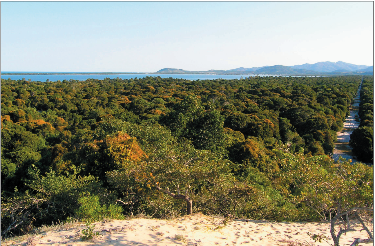
FIGURE 2: Littoral forest at Petriky, southeast of Tolagnaro (Fort Dauphin), where many QMM priority plant species occur, including eight that are shared with Mandena. The road on the right of the image was opened in the mid-1980s to provide access for QMM's exploration work.

tion. The data obtained through these steps were compiled in an 'endemic species data file', which has been kept up-to-date as new information has become available.