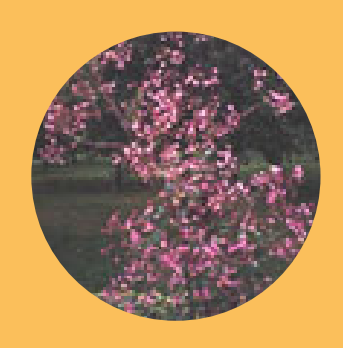
Thalictrum delavayi | meadow rue