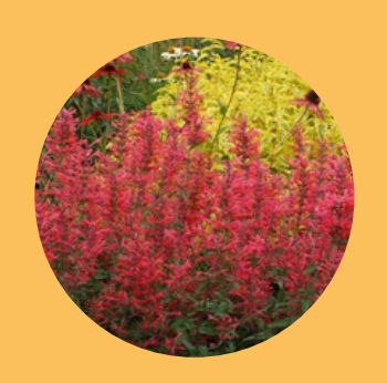
Agastache 'Kudos Coral' | giant hyssop $11 | 4 Inch Coral Pink blooms. Long blooming. Deer and rabbit resistant.

Ajuga 'Cordial Canary' | Feathered Friends™ Cordial Canary bugleweed $6.50 | 3.5 Inch