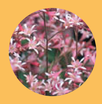
Heuchera 'Caramel' | coral bells