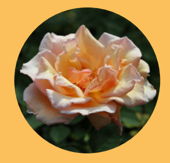
Rosa 'Pearlie Mae' | Buck rose