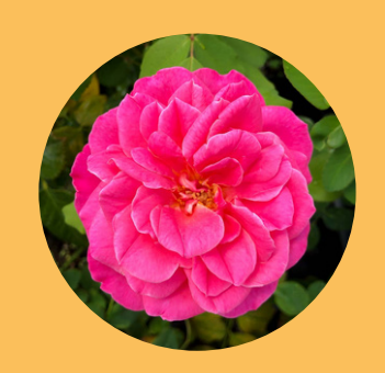
Rosa 'American Legacy' | Buck rose $25 | 1 Quart

Bright blooms come in flushes throughout the season. The shrub itself is moderately sized and packed with luscious green foliage. H: 2-3' W: 2-3'