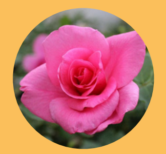
Rosa 'Barn Dance' | Buck rose $25 | 1 Quart

Pink, pointed buds open to double blooms borne in clusters with a light fragrance. This is a Buck rose. H: 2-3' W: 2-3'