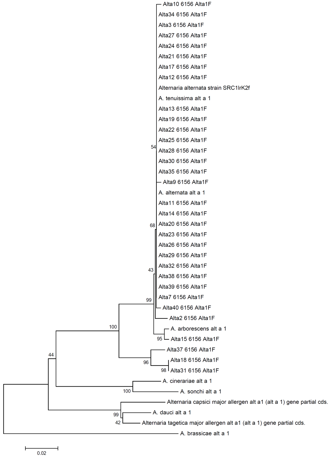
Figure 3. The phylogenetic tree for the Alt a1 gene sequences of the Alternaria species and the reference isolates of the Alternaria species. The bootstrap support values have 1000 replicates. The strain numbers follow the species.