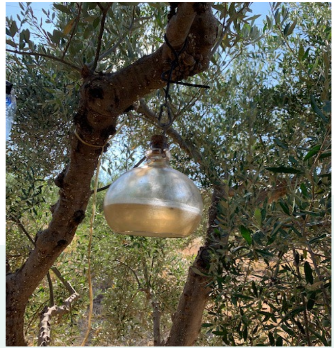
Figure 2. Pictures from the field visit at olive orchards located in the Messara valley, Crete