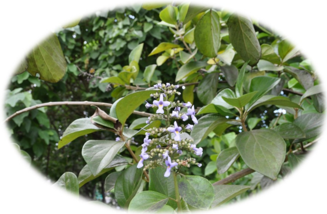
Palo de Nigua

U.S. Fish and Wildlife Service Southeast Region Caribbean Ecological Services Field Office Boquerón, Puerto Rico