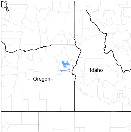
Figure 1. Mapped extent

Provisional. A provisional ecological site description has undergone quality control and quality assurance review. It contains a working state and transition model and enough information to identify the ecological site.