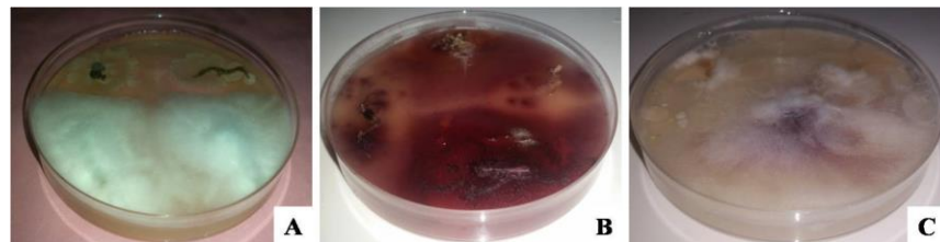
Figure 4: Recovering of Fusarium oxysporum f. sp. lycopersici from tomato samples A: fluffy white mycelia manifested on leaves samples B: Shaven colonies of roots pigmented in dark magenta C: Fluffy pale pink colonies from petiole samples