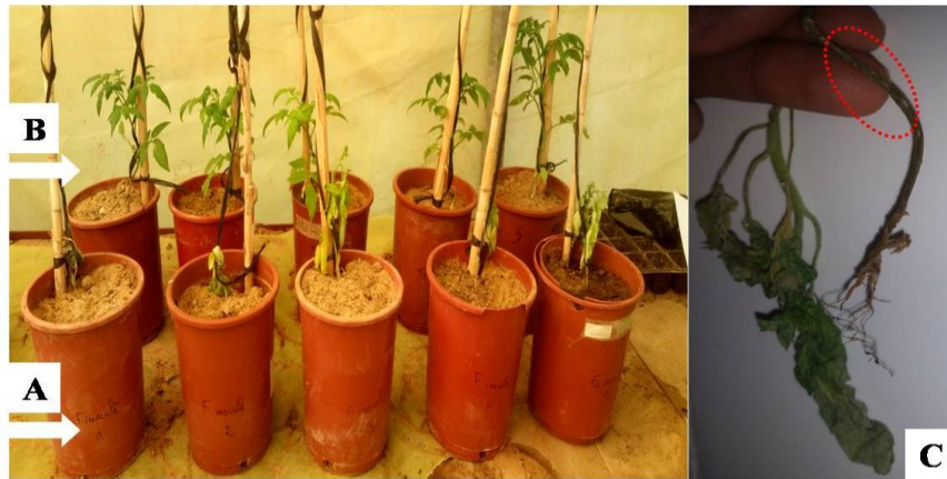
Figure 2: Pathogenicity test of Fusarium oxysporum in Tafna cultivar (tomato) A: Plants inoculated with the phytopathogenic agent B: Control seedlings C: Brown and dry necrosis visible stretched on few centimeters of stem