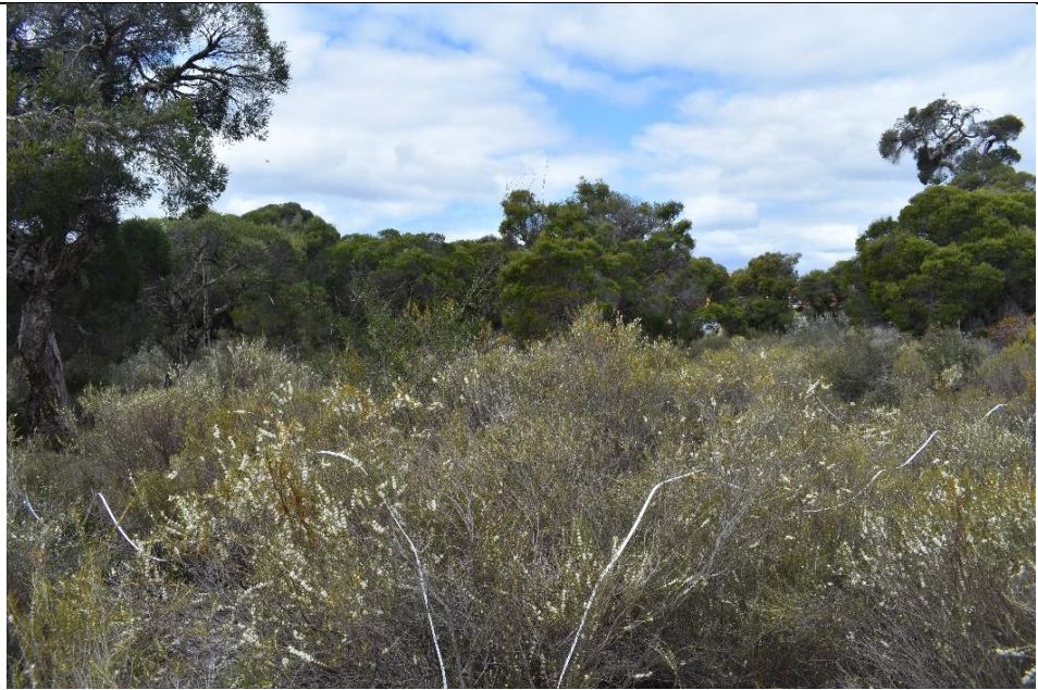
Vegetation Type: Melaleuca preissiana Open Woodland

Quadrat No.: RF09 Survey Date: 21/09/2020 Personnel: SH, KS, LC Latitude: Environment ally Sensitive Longitude: Environment ally Sensitive Location: Ranford Bushland Topography: Flat Aspect: Southeast Slope: 0-3% Soil: Black Sand Rock: 0% Leaf Litter: 0% Bare Ground: 5% Drainage: Moderate Condition: Excellent