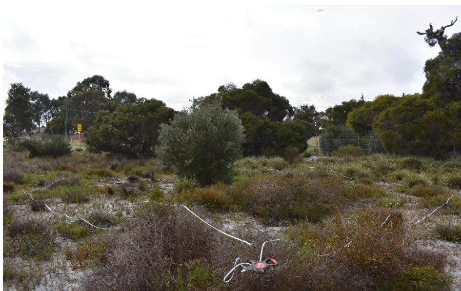
Vegetation Type: Mixed Dampland Shrubs