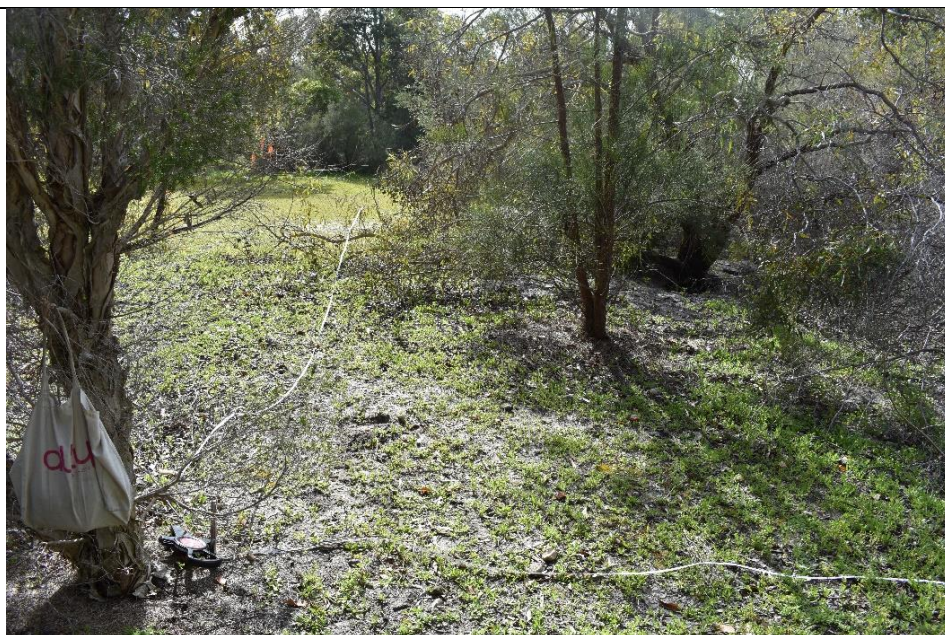
Vegetation Type: Eucalyptus tottiana Woodland

Quadrat No.: RF01 Survey Date: 21/09/2020 Personnel: SH, KS, LC Latitude: Environmentally Sensitive Longitude: Location: Ranford Bushland Topography: Mid Slope Aspect: Southwest Slope: 0-3% Soil: Grey Brown Sand Rock: 0% Leaf Litter: 3% Bare Ground: 20% Drainage: Well Condition: Degraded