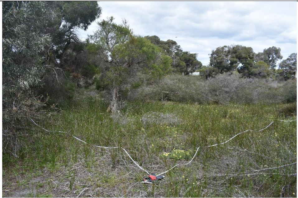
Vegetation Type: Melaleuca preissiana Open Woodland

Quadrat No.: RF11 Survey Date: 21/09/2020 Personnel: SH, LC Latitude: Environment ally Sensitive Longitude: Environment ally Sensitive Location: Ranford Bushland Topography: Flat Aspect: Southeast Slope: 0% Soil: Loamy Sand Rock: 0% Leaf Litter: 0% Bare Ground: 3% Drainage: Moderate Condition: Good