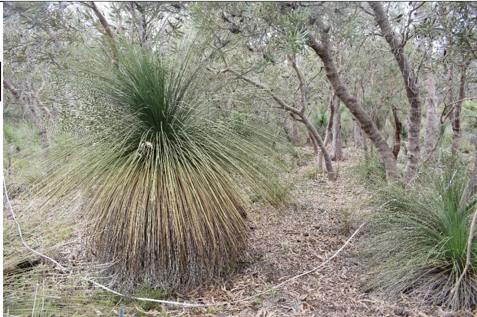
Vegetation Type: Banksia Woodland

Quadrat No.: RF05 Survey Date: 21/09/2020 Personnel: SH, KS, LC Latitude: Environmentally Sensitive Longitude: Location: Ranford Bushland Topography: Flat Aspect: North Slope: 0% Soil: Grey Sand Rock: 0% Leaf Litter: 70% Bare Ground: 1% Drainage: Well Condition: Very Good