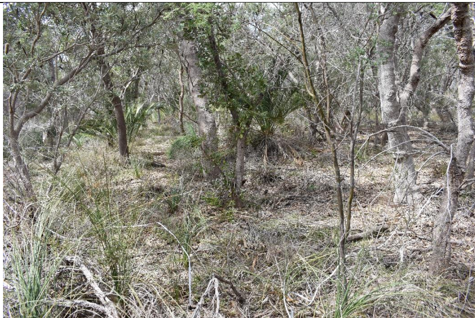
Vegetation Type: Banksia Woodland

Quadrat No.: RF04 Survey Date: 21/09/2020 Personnel: SH, KS, LC Latitude: Longitude: Environment ally Sensitive Location: Ranford Bushland Topography: Upper Slope Aspect: Northwest Slope: 0-3% Soil: Grey Sand Rock: 0% Leaf Litter: 50% Bare Ground: 2% Drainage: Well Condition: Very Good