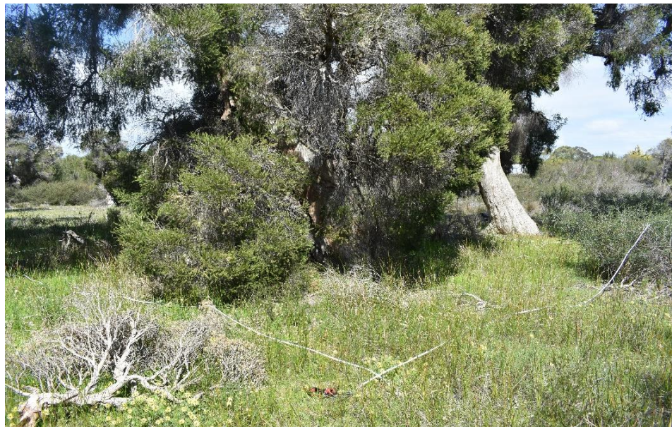
Notes: Melaleuca preissiana Open Woodland

Quadrat No.: RF10 Survey Date: 21/09/2020 Personnel: SH, KS, LC Latitude: Environment Longitude: ally Sensitive Location: Ranford Bushland Topography: Flat Aspect: Southeast Slope: 0% Soil: Loamy Sand Rock: 0% Leaf Litter: 4% Bare Ground: 1% Drainage: Moderate Condition: Good