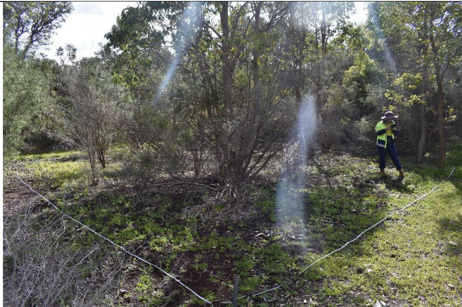
Vegetation Type: Corymbia calophylla Woodland

Quadrat No.: RF02 Survey Date: 21/09/2020 Personnel: SH, KS, LC Latitude: Environmentally Sensitive Longitude: Environmentally Sensitive Location: Rantford Bushland Topography: Mid Slope Aspect: South Slope: 0-3% Soil: Brown Sand Rock: 0% Leaf Litter: 60% Bare Ground: 15% Drainage: Well Condition: Degraded