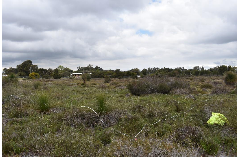
Vegetation Type: Hypocalymma angustifolium Shrubland

Quadrat No.: RF06 Survey Date: 21/09/2020 Personnel: SH, KS, LC Latitude: Environment Longitude: ally Sensitive Location: Ranford Bushland Topography: Flat Aspect: North Slope: 0% Soil: Grey Sand Rock: 0% Leaf Litter: 0% Bare Ground: 10% Drainage: Moderate Condition: Excellent