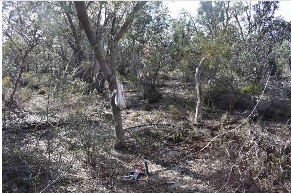
Vegetation Type: Banksia attenuata and Allocasuarina fraseriana Woodland

Quadrat No.: RF03 Survey Date: 21/09/2020 Personnel: SH, KS, LC Latitude: Environment Longitude: ally Sensitive Location: Ranford Bushland Topography: Mid Slope Aspect: Northwest Slope: 0-3% Soil: Grey Sand Rock: 0% Leaf Litter: 90% Bare Ground: 5% Drainage: Well Condition: Very Good