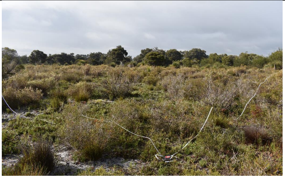
Vegetation Type: Hypocalymma angustifolium Shrubland

Quadrat No.: RF12 Survey Date: 22/09/2020 Personnel: SH, LC Latitude: Environment ally Sensitive Longitude: Environment ally Sensitive Location: Ranford Bushland Topography: Mid Slope Aspect: Southeast Slope: 1-3% Soil: Grey Sand Rock: 0% Leaf Litter: 0% Bare Ground: 7% Drainage: Well Condition: Very Good