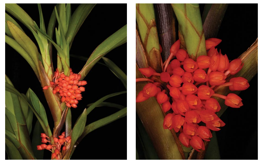
Ornithidium fulgens — Habit and inflorescence