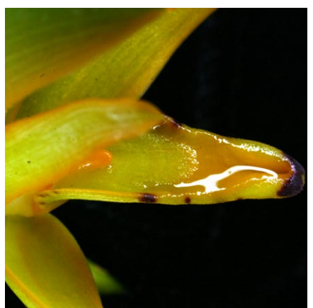
Rhetinantha scorpioidea --- Habit and resin on lip