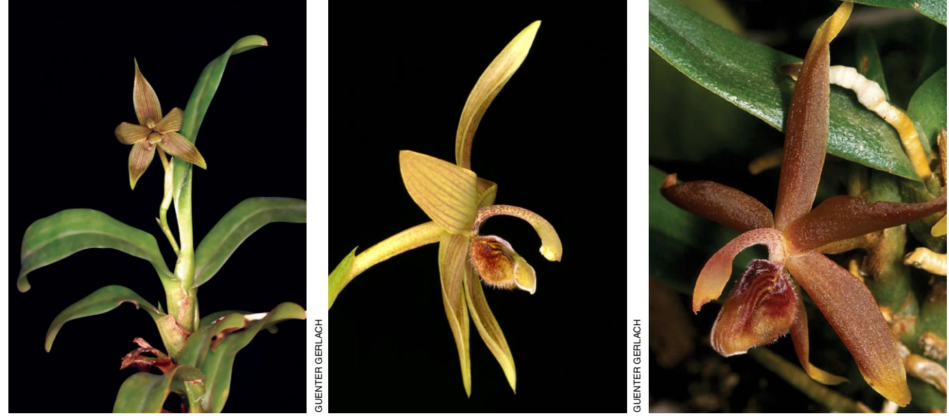
Cyrtidiorchis alata - Habit and flower

walls, or the mature capsules may open at the apex, with the segments reflexing widely. Roots may be smooth, or they may bear ringlike thickenings. The flowers may have a prominent column foot (a chinlike hinge formed by fusion of the lip base and column extension), or the column foot may be absent. The lip may be simple and linear, or it may have prominent lateral lobes. The bract subtending the flower may be short or long. Finally, the presence/absence and type of floral reward for pollinators varies greatly among genera. These include nectar, resin (collected by female bees to build nests), pseudopollen (powdery fake pollen on the lip, collected by female bees to feed to larvae), or more commonly, no reward at all. In the latter category, the flowers can falsely advertise the presence of nectar, resin, or pollen rewards, or even mimic the females of their insect pollinators.