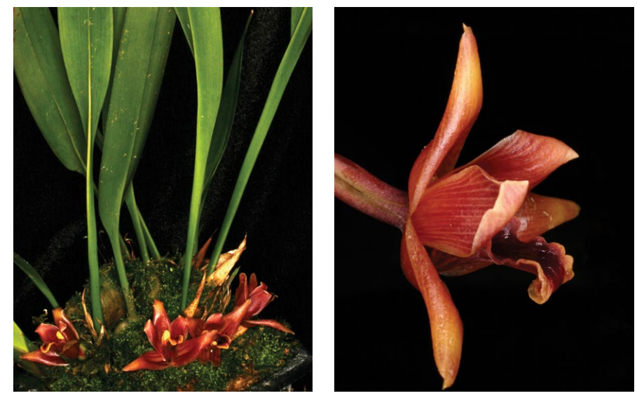
Mapinguari desvauxianus — Habit and flower