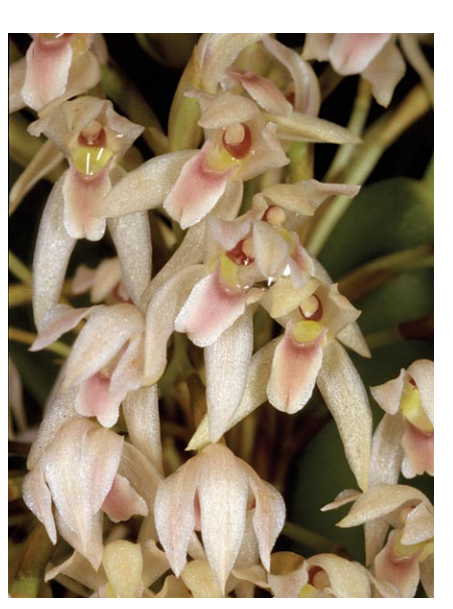
Camaridium densum --- Habit and inflorescence