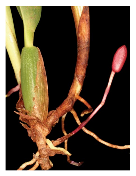
Mormolyca sp. - Position of inflorescence