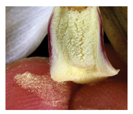
Maxillaria grayi — Pseudopollen on lip