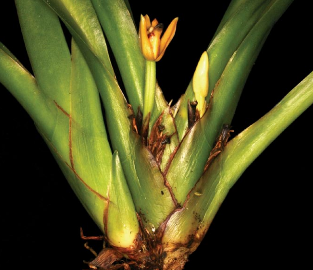
Heterotaxis sessilis — Habit and detail of lip