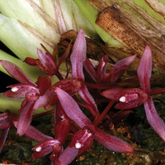
Inti bicallosa - Habit and inflorescence