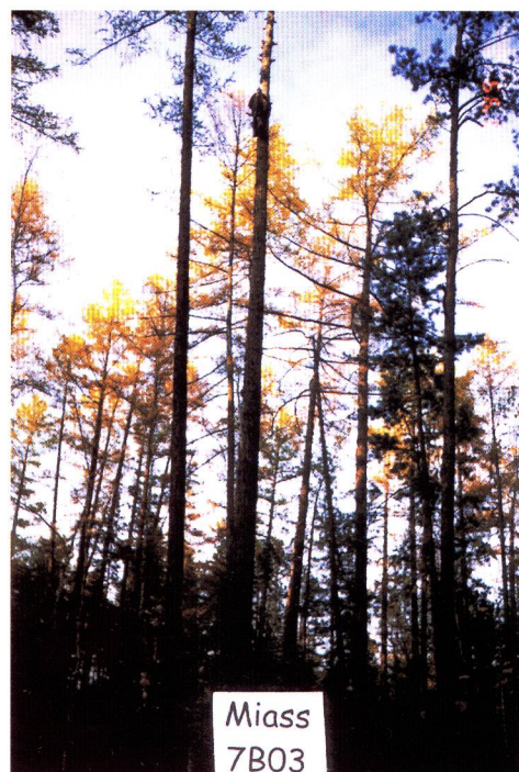
Photo. 2. Seed trees from central Siberia.

top left; Novokuznetsk (region No. 10), top right; Boguchany (region No. 9), bottom left; Altai (region No. 11), bottom right; Miass, Ufa (region No. 7)