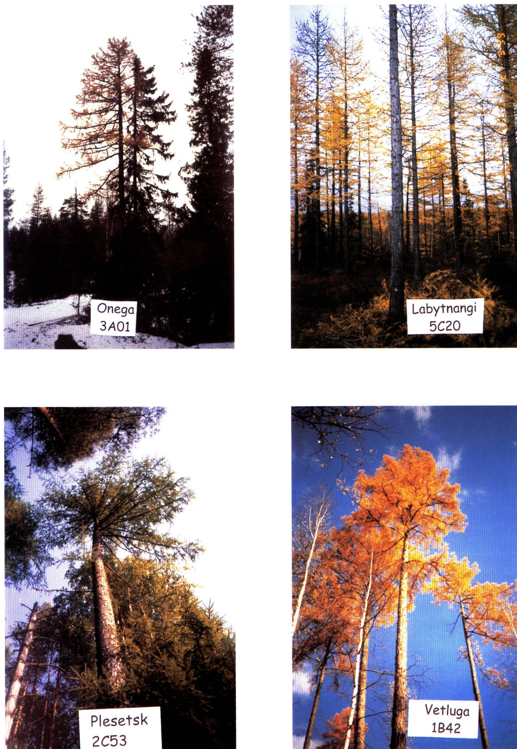
Photo. 1. Seed trees from European Russia and Urals.

top left; Onega (region No. 3), top right; Labytnangi, Salechard (region No. 5), bottom left; Plesetsk (region No. 2), bottom right; Vetluga, Vizhnij Novgorod (region No. 1) Each tree has its own recognition number, which is the combination of numerals and alphabet representing region, site in a region, and tree number in a site.