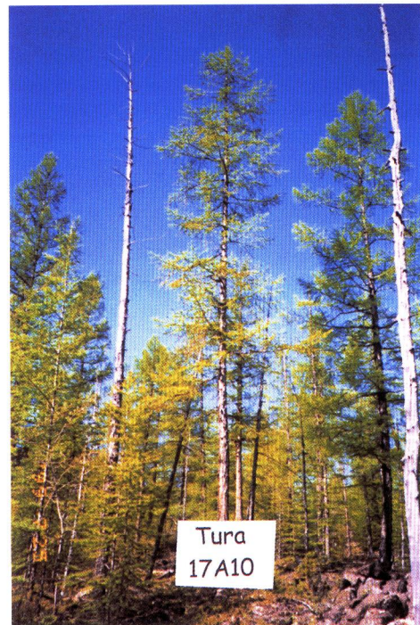
Photo. 3. Seed trees from central and eastern Siberia.

top left; Zhigansk, Yakutiya (region No. 12), top right; Magadan (region No. 13), bottom left; Boguchany (region No. 9), bottom right; Tura, Evenkiya (region No. 17). Each tree has its own recognition number, which is the combination of numerals and alphabet representing region, site in a region, and tree number in a site.