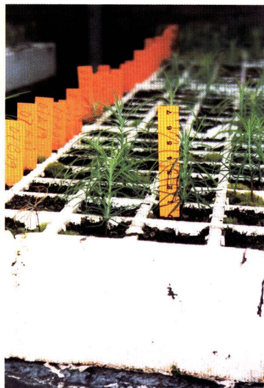
Photo. 7. Seedlings developed from seeds from Boguchany (region No. 9)