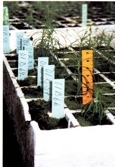
Photo. 5. Seedlings developed from seeds from Vizhnij Novgorod (region No. 1)