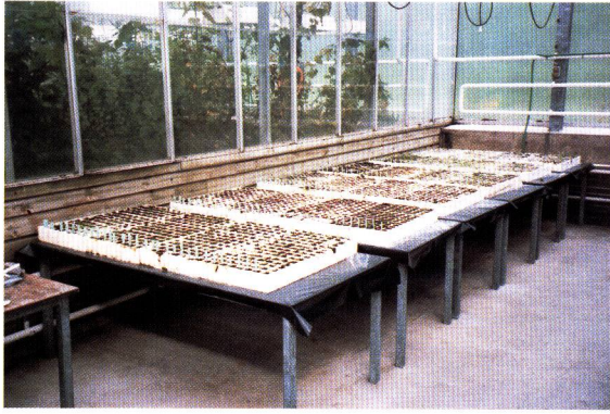
Photo. 4. Germination test in green house.