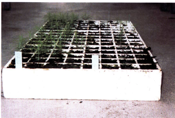
Photo. 8. Seedlings developed from seeds from Altai (region No. 11) and Yakutiya (region No. 12). Four lines in the left side are Altai, and four lines in the right side are Yakutiya.