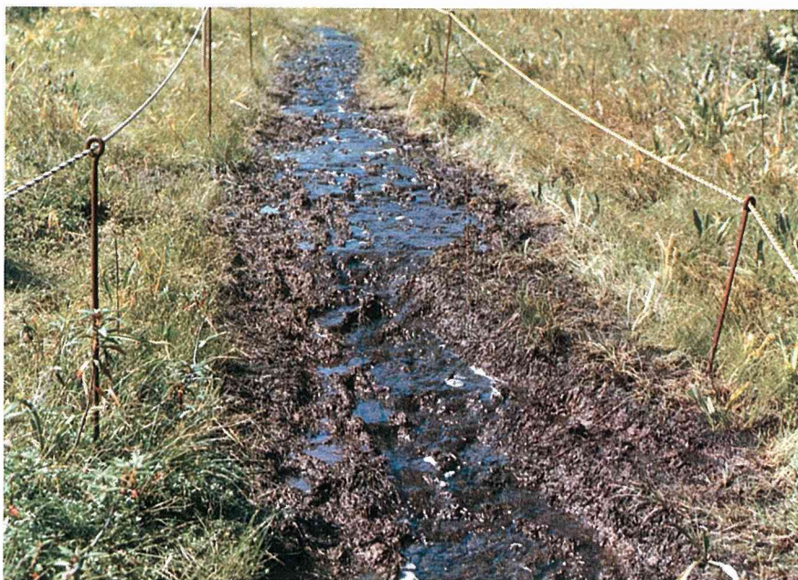
Photo 3. A muddy path becomes the water course after a shower. (photo by Ito, 11 Sept. 1985).