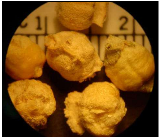
Each A. spinifera seed is enclosed within fruiting bracts. The fruits have a very hard consistency. Scale shown is millimeters.