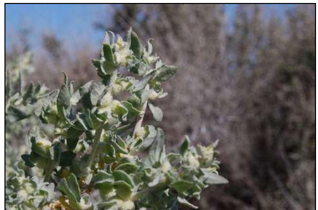
Fruits are beginning to form in the light yellow areas that are spongy in appearance.