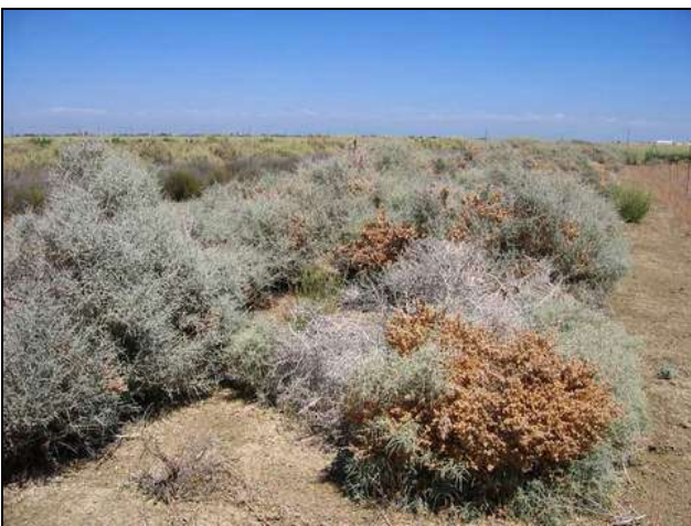
A. spinifera at the native plant nursery.