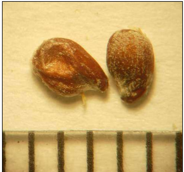
A. spinifera seeds that have been removed from their fruits. We did this out of curiosity; we did not extract seeds from fruits before planting them.