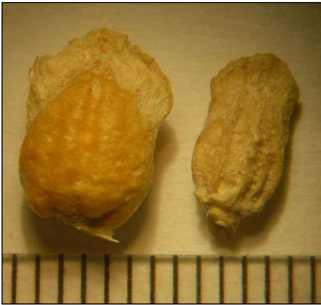
We found that after an A. spinifera fruit (left) is soaked in water, the outer layer becomes soft and can easily be scraped off, revealing a hard surface underneath (right). Scale shown is millimeters.