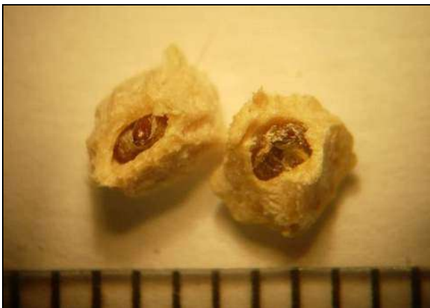
We soaked A. spinifera fruits in water to soften them, and then cut them open with a scalpel, to view the seeds contained inside.