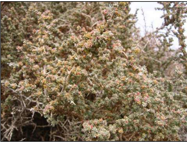
A. spinifera in flower during February 2009.