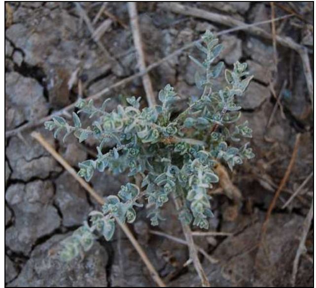
A young A. spinifera plant observed at the native plant nursery during August 2008.