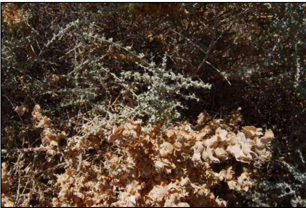
Mature fruits are displayed on the plant.