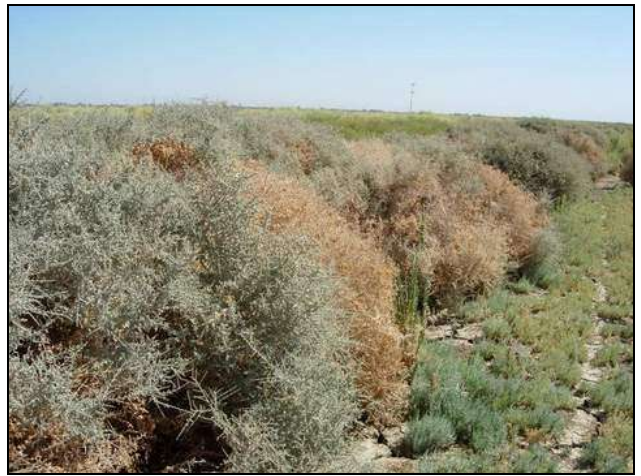
A. spinifera at the native plant nursery. Frankenia salina (alkali heath) is pictured on the right.