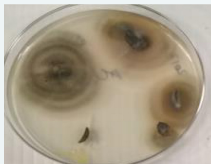
Alternaria colony on media