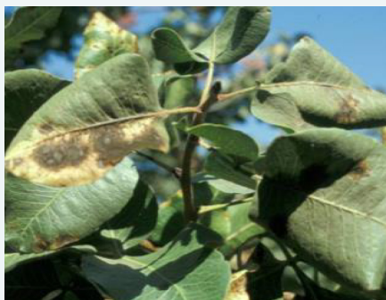
Leaf lesions with sporulation