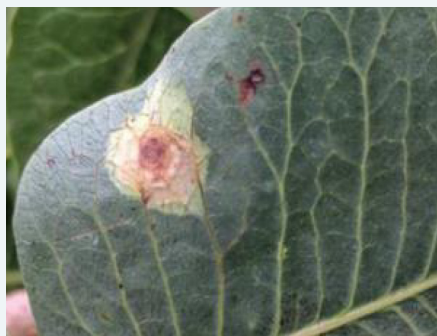
Initial Alternaria lesion