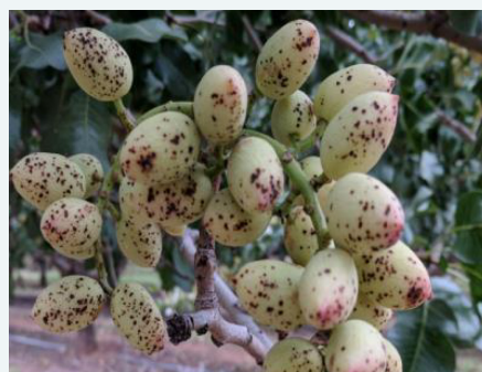
Black lesions on fruit