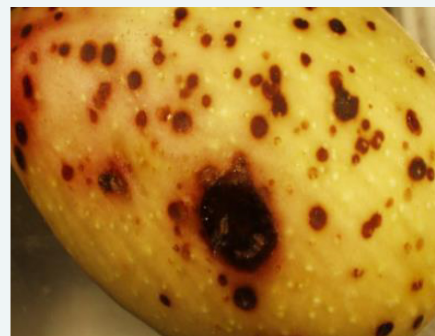
Lesions with reddish halo