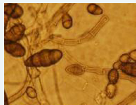
Conidia spores of Alternaria