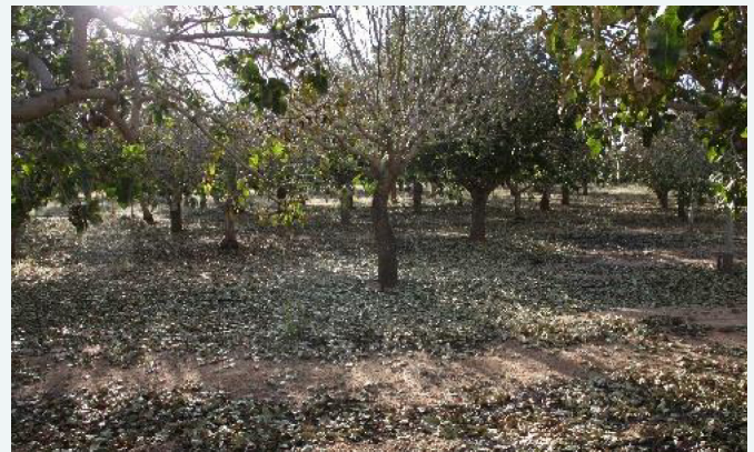
Complete defoliation of tree canopy

SCIENTIFIC NAME: Septoria pistaciarum (teleomorph: Mycosphaerella pistaciarum )