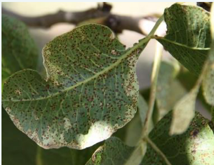
Brown necrotic spots