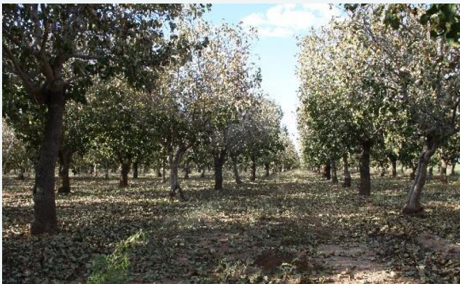
Severe defoliation at harvest