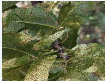
Spots on both sides of leaf