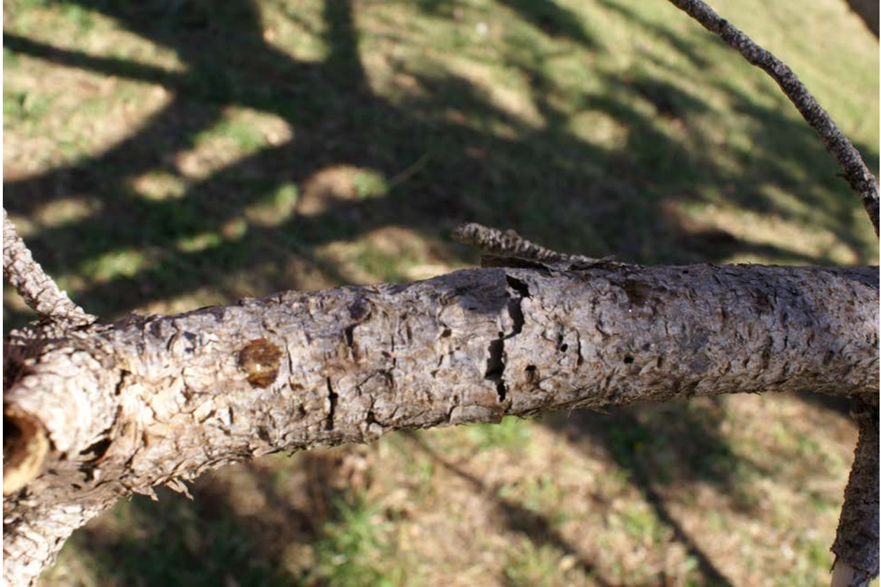
Fig 6. When infected shoot tips are not removed, Diplodia tip blight can spread into limbs and cause a canker which may exude resin.

Cultural methods of control for Diplodia tip blight include removing diseased shoots and branches by pruning. Tools should be disinfected between cuts to prevent disease spread. The best prevention is to water pine trees during periods of drought and maintain proper fertility.