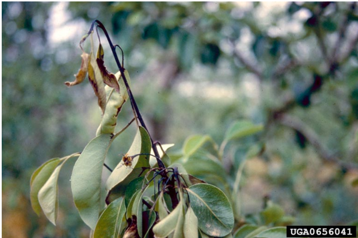
Fig 1. Typical 'shepherd's crook' symptom on a pear tree with fire blight disease.

Control of fire blight is best achieved by planting resistant cultivars. If the disease develops, diseased twigs and branches should be removed as soon as they appear. During the growing season, wood should be pruned 12 to 14 inches below visible cankers. In fall or winter months, cankers may be removed 6 to 8 inches below the discolored areas. Pruning tools should be disinfested between each cut by to avoid spreading the bacteria. Disinfectants may include bleach solution (1 part household bleach and 9 parts water), isopropyl alcohol, or other disinfecting products. Fungicides containing copper may be applied for disease control, but they may cause russetting of fruit on some apple and pear cultivars. The antibiotic streptomycin provides better control under high disease pressure than copper. Chemicals should be applied as soon as bloom begins.