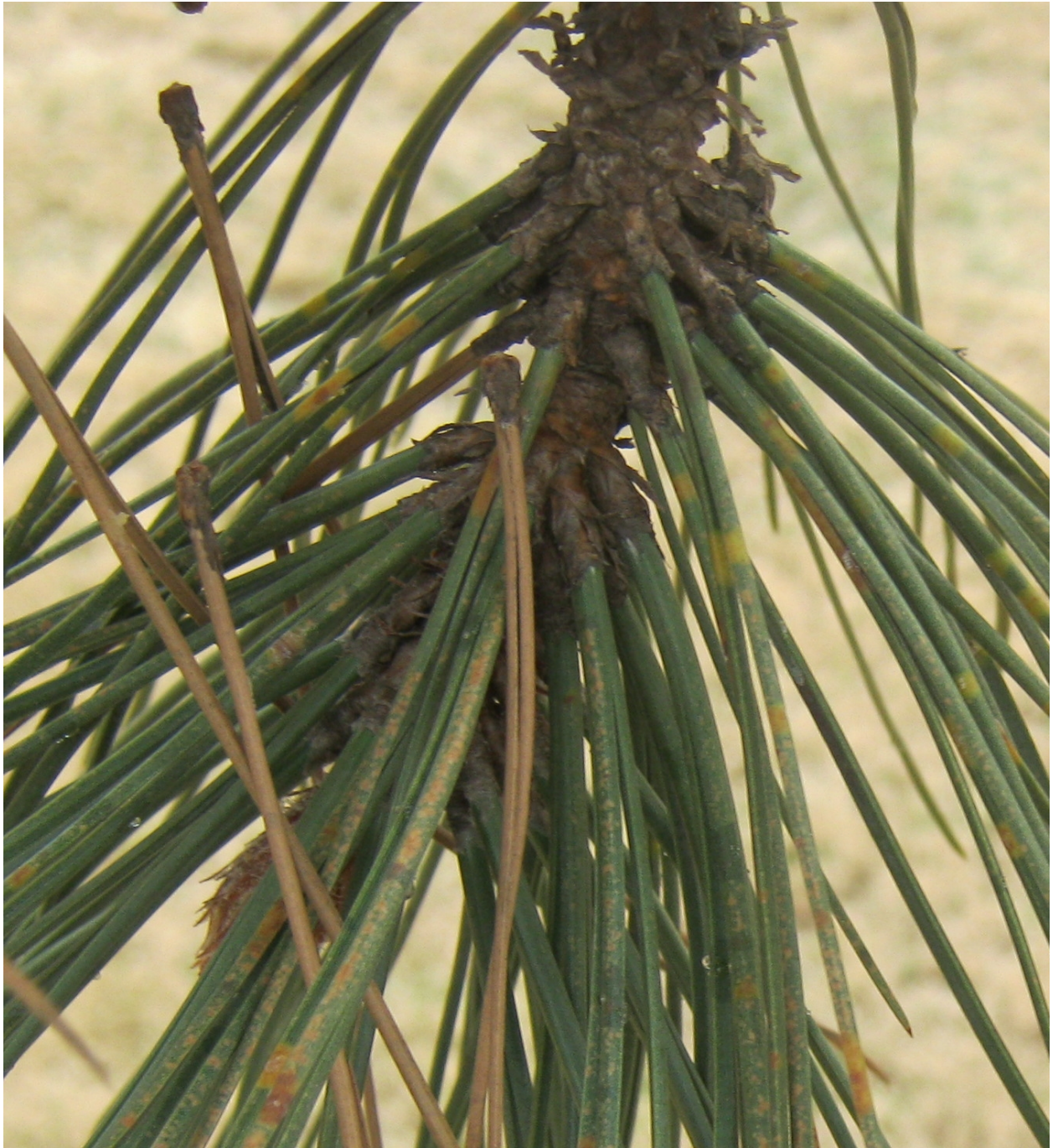
Fig 7. The early symptoms of Dothistroma needle blight are visible in the fall as yellow spots or bands on the needles.