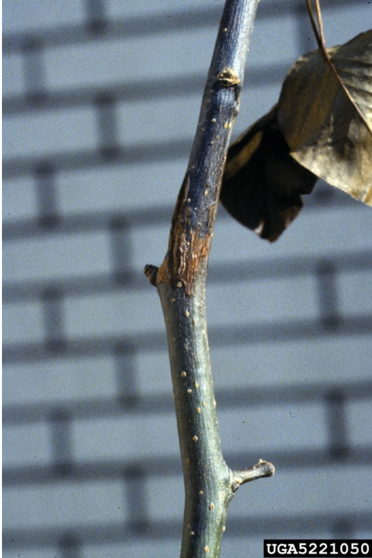
Fig 2. Fire blight canker at the base of a blighted shoot.