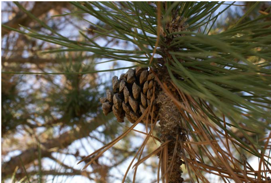
Fig 5. Examine the scales of newer cones for signs of Diplodia tip blight.