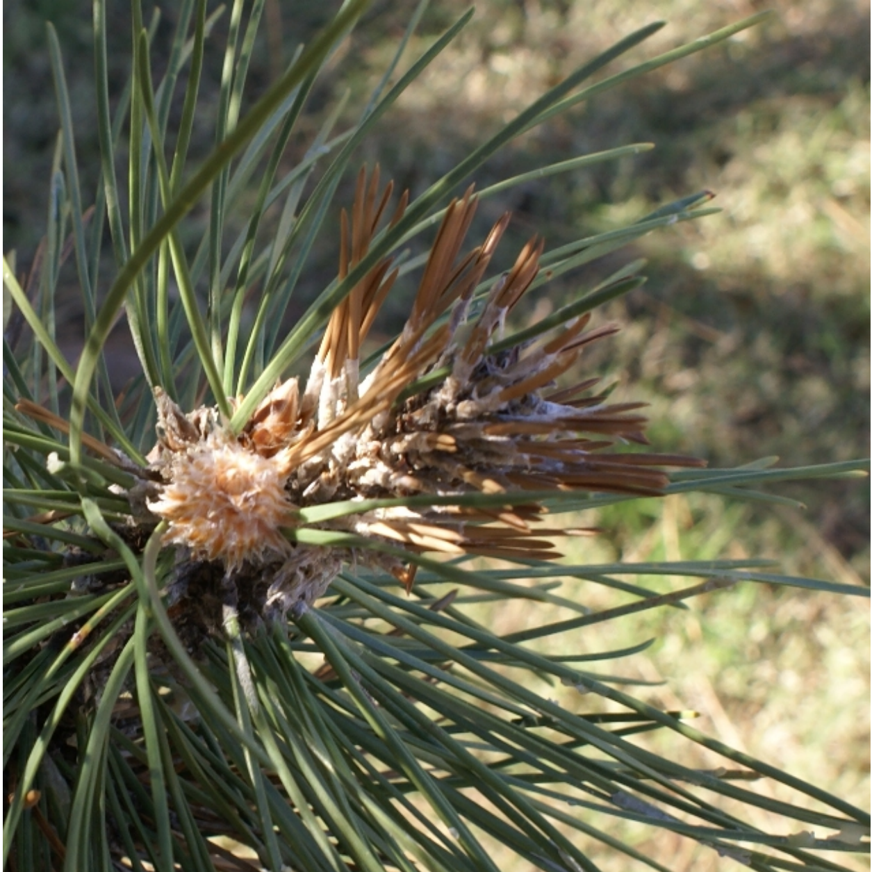
Fig 3. Discoloration and death of new needles as they were emerging in the spring.

Cones may become infected and black fruiting structures may be visible on the cone scales (Fig. 4). Be sure to examine newer cones rather than those that have been on the ground for an unknown amount of time (Fig 5). Cankers may develop on branches and occasionally resinous ooze is present around these sites (Fig 6). A progressive dieback develops and limbs may be killed.