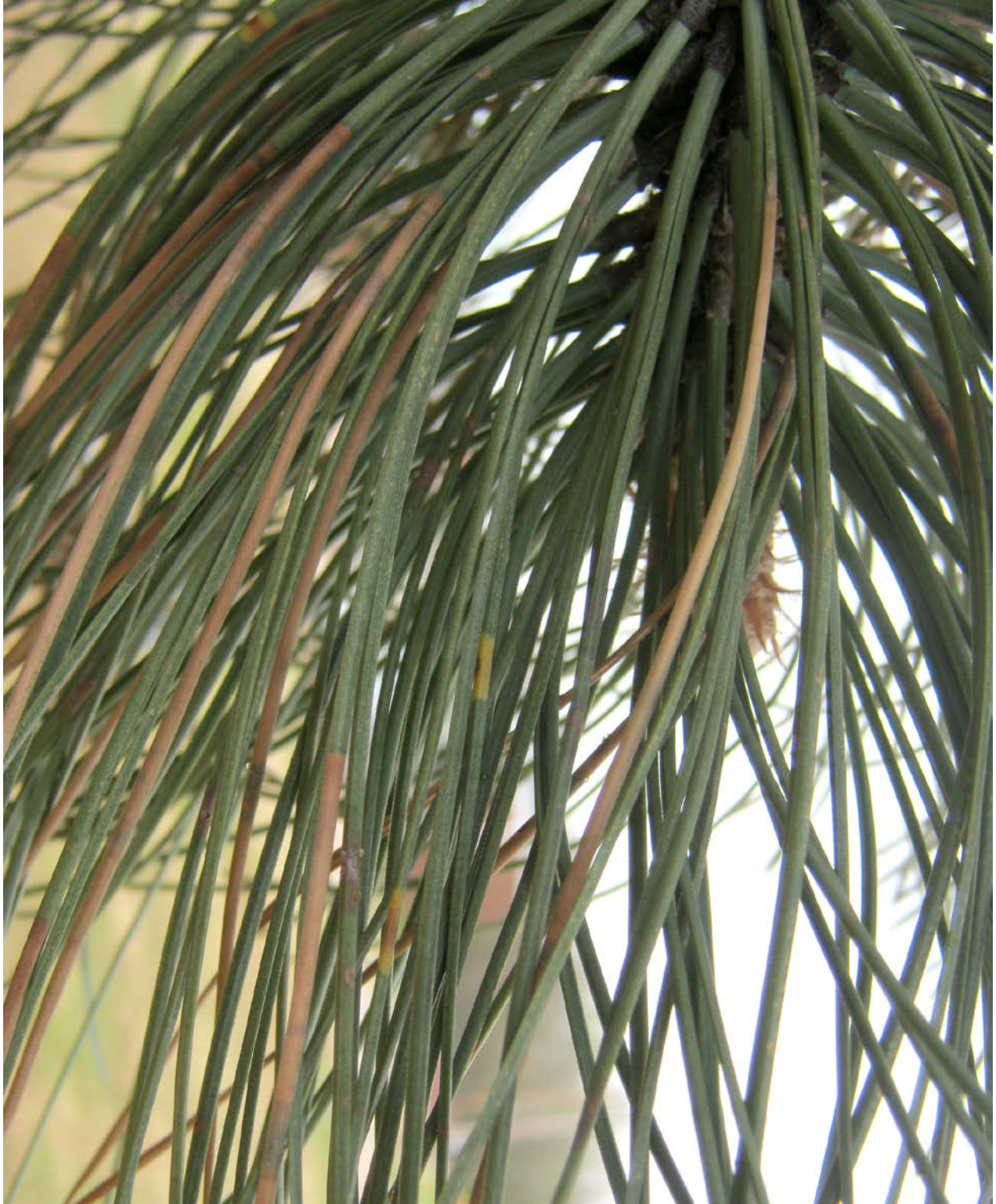
Fig 8. Symptoms of Dothistroma needle blight progress so that entire tips of needles are discolored while the base remains green.