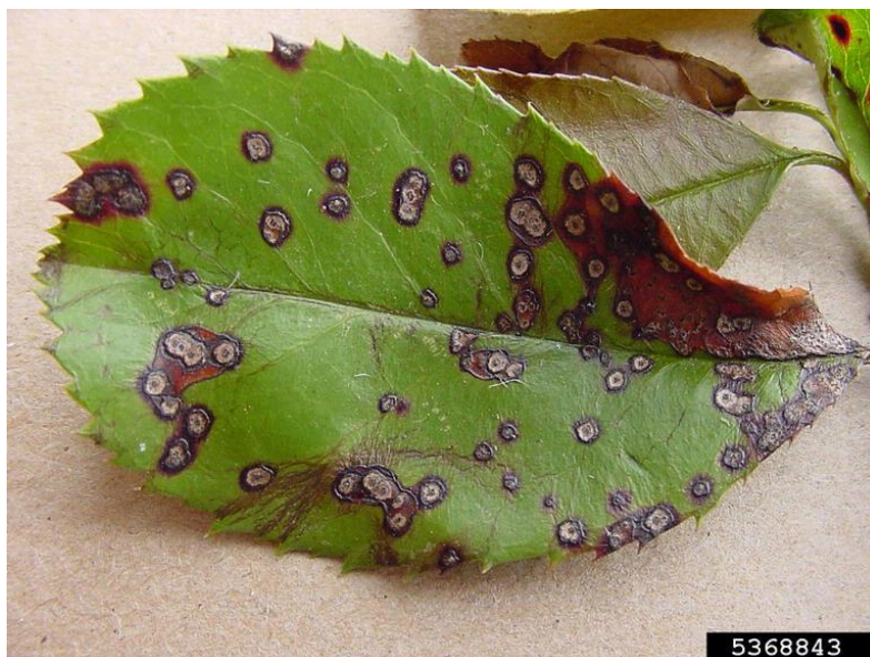
Fig 9. Typical symptoms of Entomosporium leaf spot of red-tipped Photinia.

Leaf spot and anthracnose diseases in general have a narrow host range. Although a grower may observe leaf spot or anthracnose on many trees and shrubs in the landscape, the pathogens are not likely to be the same organism unless the plants are closely related. For instance, a grower may observe Entomosporium leaf spot of red-tipped Photinia and black spot of rose in the same landscape, but the pathogens are not the same (Figs 9-10). In this situation, it suggests that the environment is moist and temperatures are moderate. Although the pathogens vary, most leaf spot and anthracnose diseases have similar recommendations for control.