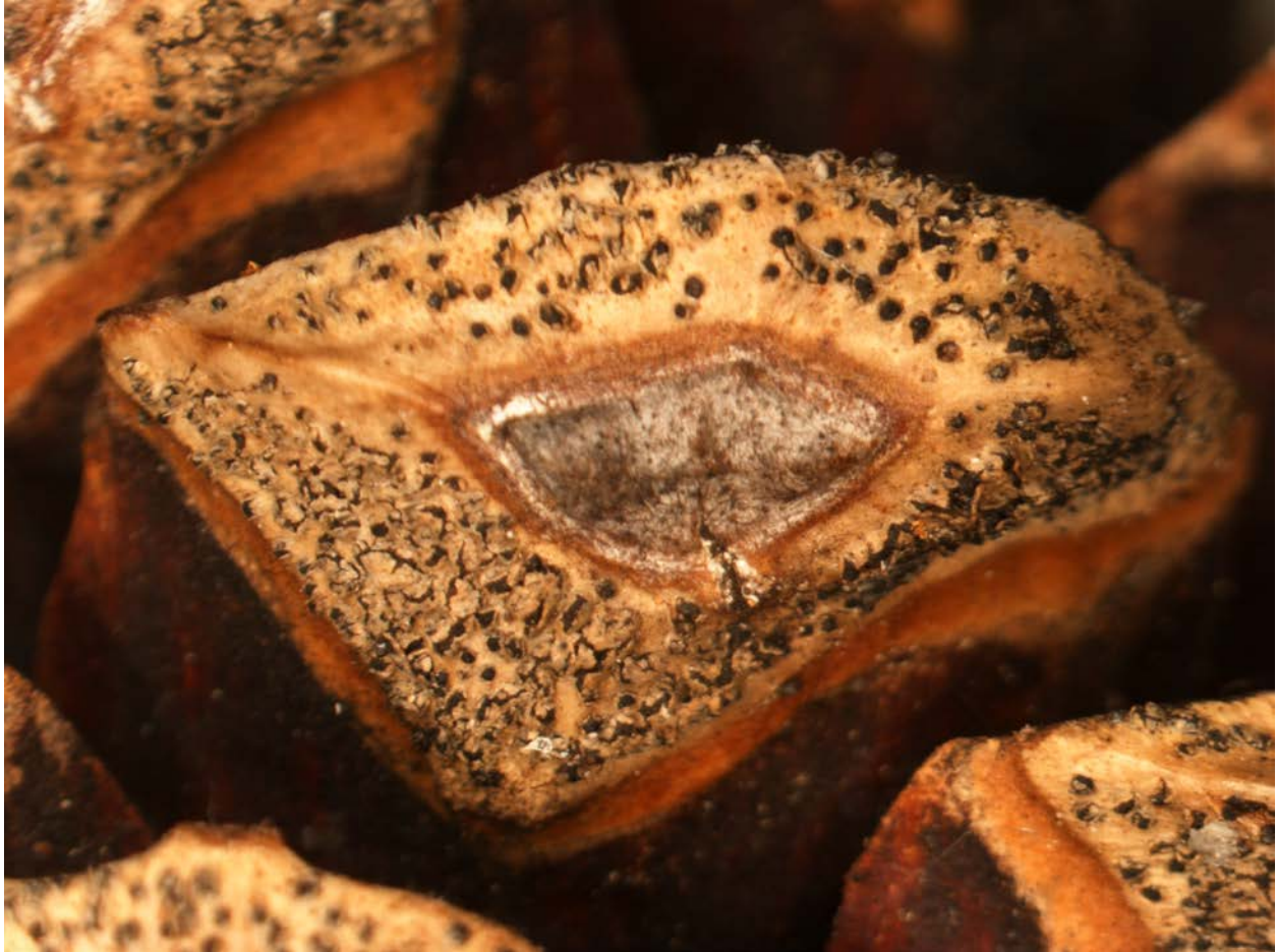
Fig 4. Cone scales with black fruiting bodies of the fungus that causes Diplodia tip blight.