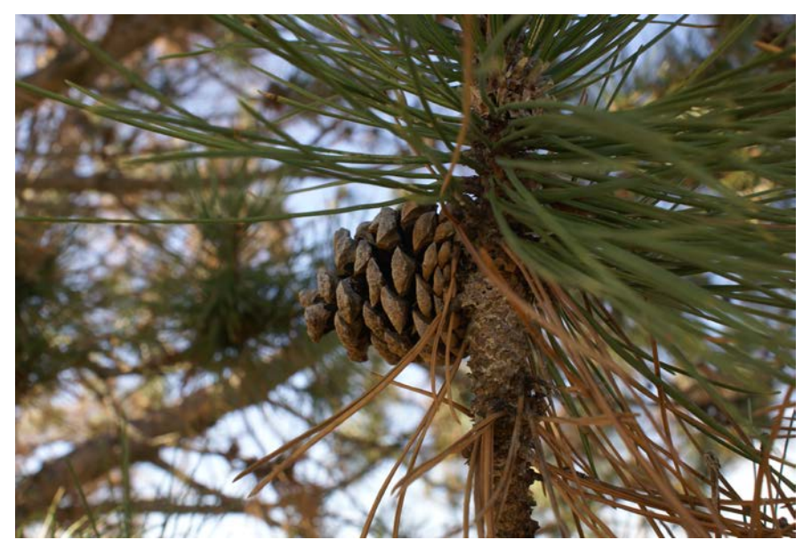
Fig 5 . Examine the scales of newer cones for signs of Diplodia tip blight.

Fig 4. Cone scales with black fruiting bodies of the fungus that causes Diplodia tip blight.