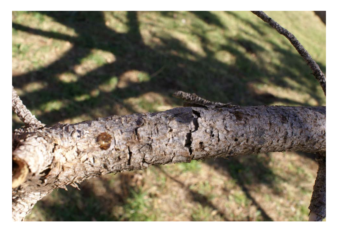
Fig 6 . When infected shoot tips are not removed, Diplodia tip blight can spread into limbs and cause a canker which may exude resin.

Cultural methods of control for Diplodia tip blight include removing diseased shoots and branches by pruning. Tools should be disinfected between cuts to prevent disease spread. The best prevention is to water pine trees during periods of drought and maintain proper fertility.