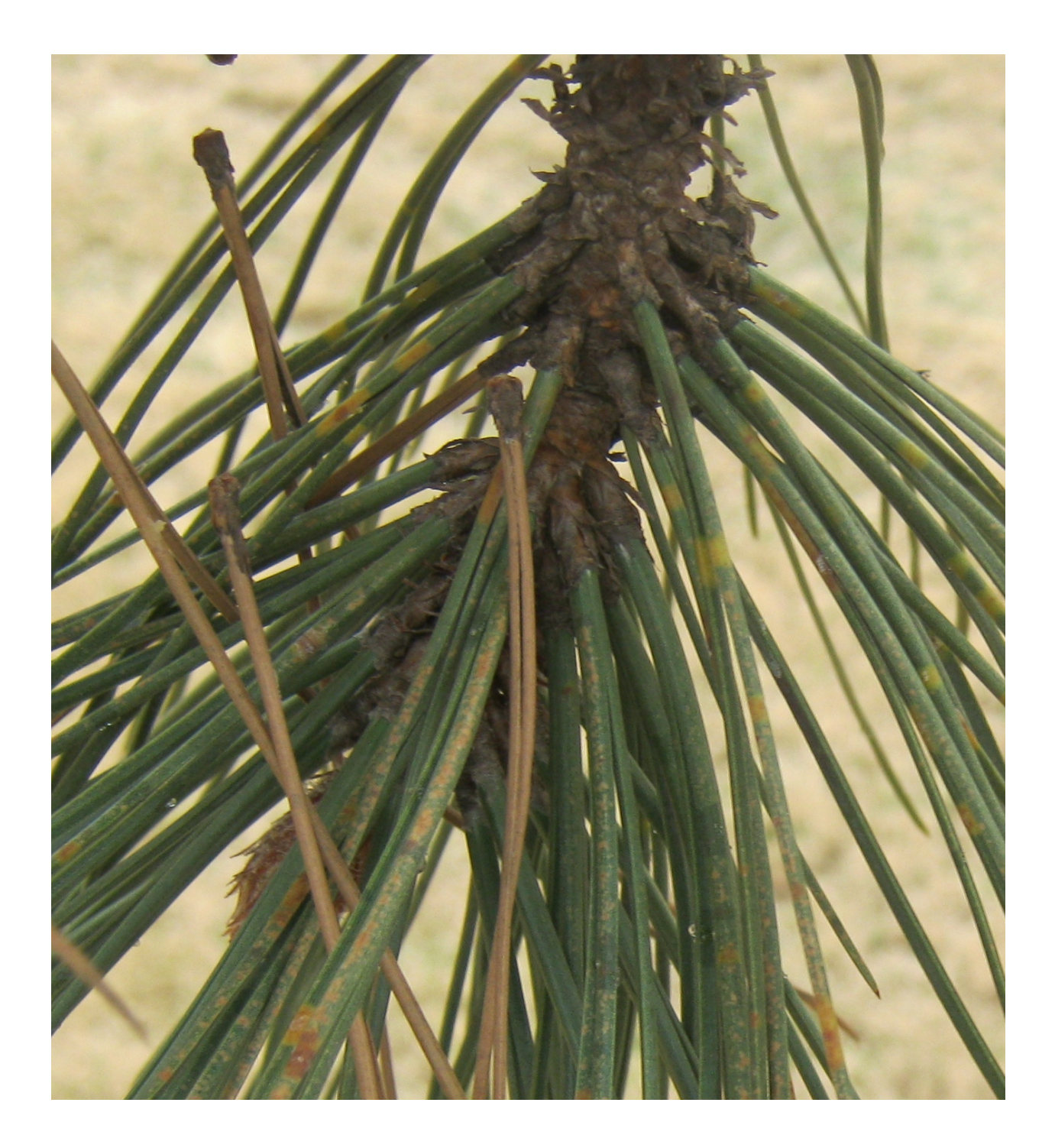
Fig 7 . The early symptoms of Dothistroma needle blight are visible in the fall as yellow spots or bands on the needles.