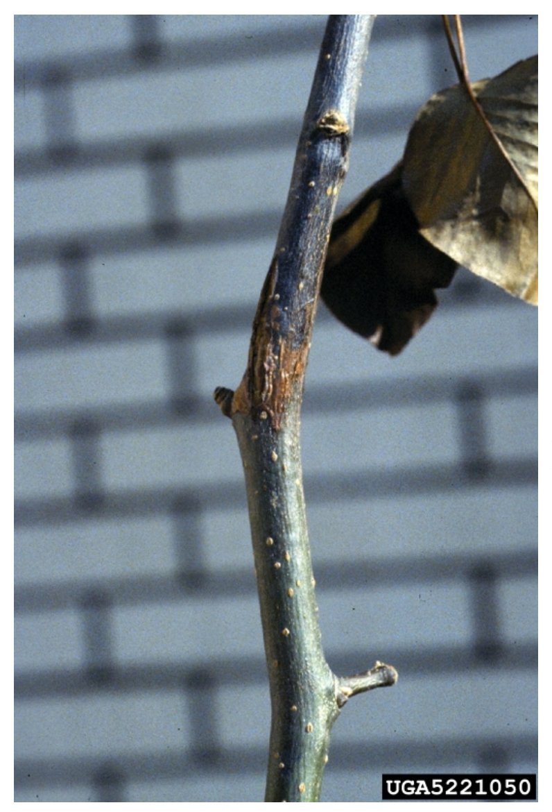
Fig 2. Fire blight canker at the base of a blighted shoot.