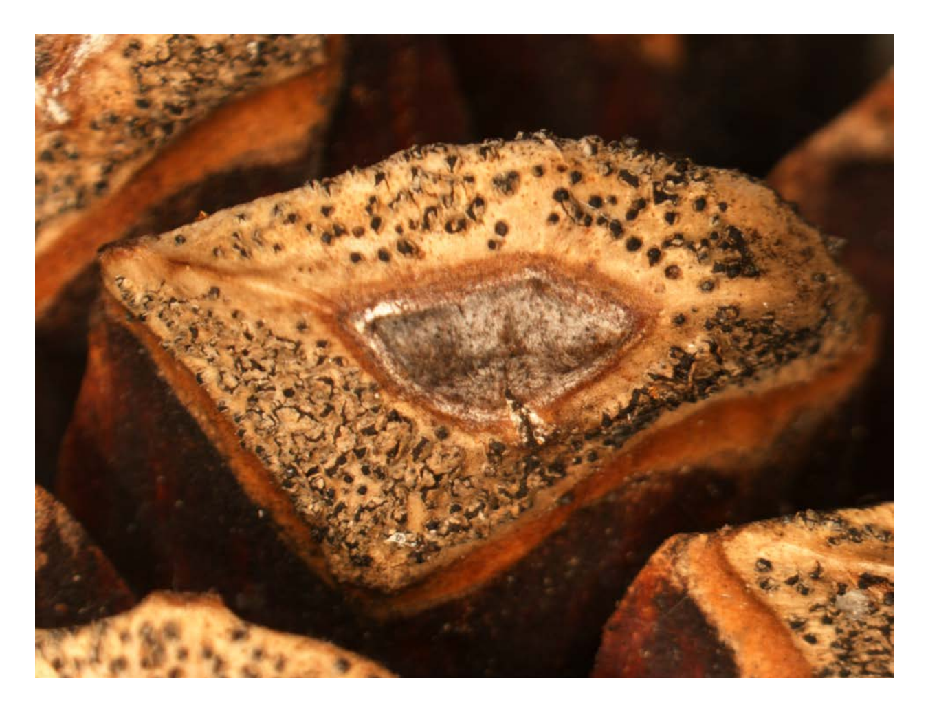
Fig 4. Cone scales with black fruiting bodies of the fungus that causes Diplodia tip blight.