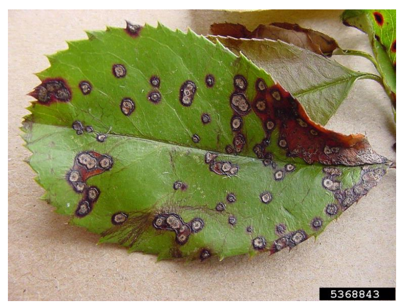
Fig 9 . Typical symptoms of Entomosporium leaf spot of red-tipped Photinia.

Leaf spot and anthracnose diseases in general have a narrow host range. Although a grower may observe leaf spot or anthracnose on many trees and shrubs in the landscape, the pathogens are not likely to be the same organism unless the plants are closely related. For instance, a grower may observe Entomosporium leaf spot of red-tipped Photinia and black spot of rose in the same landscape, but the pathogens are not the same (Figs 9-10). In this situation, it suggests that the environment is moist and temperatures are moderate. Although the pathogens vary, most leaf spot and anthracnose diseases have similar recommendations for control.