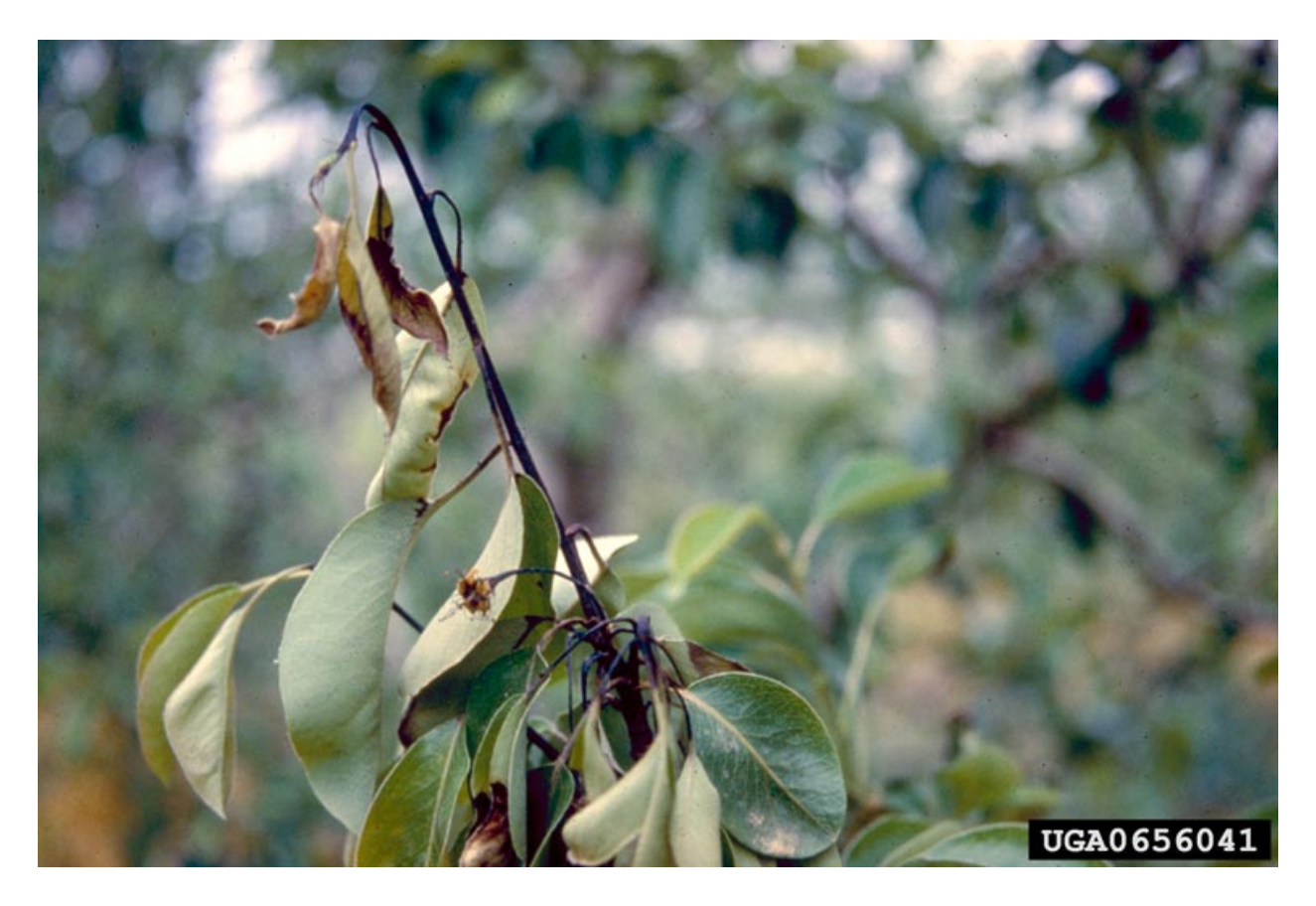
Fig 1. Typical 'shepherd's crook' symptom on a pear tree with fire blight disease.

Control of fire blight is best achieved by planting resistant cultivars. If the disease develops, diseased twigs and branches should be removed as soon as they appear. During the growing season, wood should be pruned 12 to 14 inches below visible cankers. In fall or winter months, cankers may be removed 6 to 8 inches below the discolored areas. Pruning tools should be disinfested between each cut by to avoid spreading the bacteria. Disinfectants may include bleach solution (1 part household bleach and 9 parts water), isopropyl alcohol, or other disinfecting products. Fungicides containing copper may be applied for disease control, but they may cause russeting of fruit on some apple and pear cultivars. The antibiotic streptomycin provides better control under high disease pressure than copper. Chemicals should be applied as soon as bloom begins.