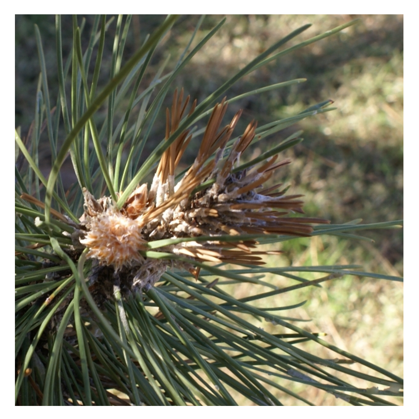
Fig 3. Discoloration and death of new needles as they were emerging in the spring.

Cones may become infected and black fruiting structures may be visible on the cone scales (Fig. 4). Be sure to examine newer cones rather than those that have been on the ground for an unknown amount of time (Fig 5). Cankers may develop on branches and occasionally resinous ooze is present around these sites (Fig 6). A progressive dieback develops and limbs may be killed.