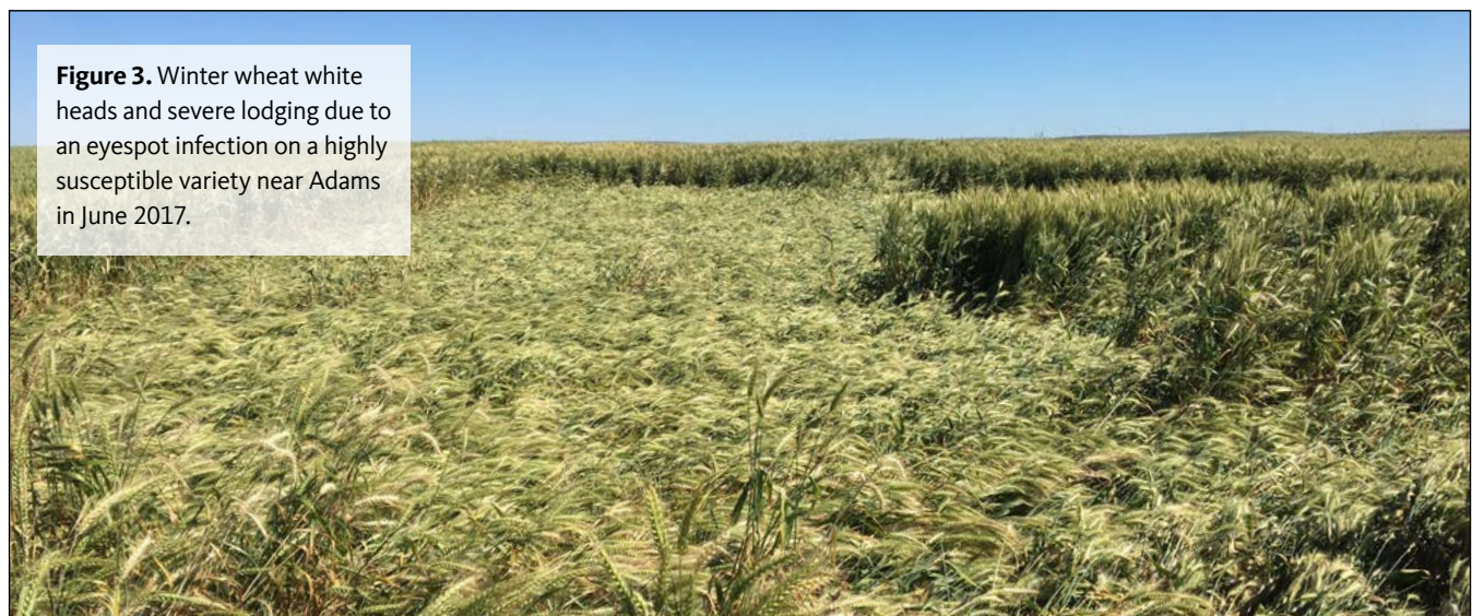
Figure 3. Winter wheat white heads and severe lodging due to an eyespot infection on a highly susceptible variety near Adams in June 2017.