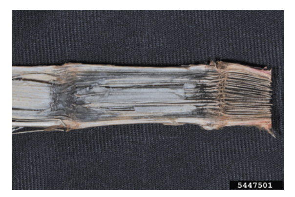
Figure 47.11 Charcoal rot on corn.

Charcoal rot is caused by the fungus Macrophomina phaseolina , and it is often called the dry weather wilt. Charcoal rot typically affects prematurely senescing plants that are under drought stress. Disease development is ideal when soil is dry and soil temperatures are 90°F or higher. The signs of charcoal rot include sclerotia, which are tiny, black, round, survival structures produced by this fungus (Fig. 47.11).