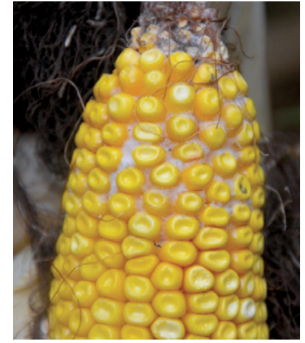
Figure 47.17b Corn ear with late Diplodia ear rot infection. Notice the white mycelia between kernels.

green spores on and between them (Fig.47.18). Usually the tip of the ear is where infected kernels tend to concentrate but any other part of the ear may be infected. Sporulation of the fungus is most evident on kernels that were injured. However the fungus can also be present on kernels without showing symptoms.