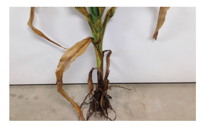
Figure 47.19b Corn wilt caused by early infection of Goss's wilt bacteria.