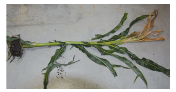
Figure 47.21 Bacterial stalk rot symptoms on corn. This disease affects the top part of the plant.

Bacterial stalk rot typically develops midseason rather than at the onset of senescence. It is more common in irrigated corn when an open well as the source of irrigation water. Bacterial stalk rot is caused by the bacterium Erwinia chrysanthemi pv. zeae . Infection is associated with warm temperatures (90-100°F) and high humidity. This pathogen overwinters only in stalk tissues above the soil surface. Infection can initially take place at the top or bottom of the plant. Early symptoms consist of plant lodging and dark brown, water-soaked lesions that progress to soft or slimy stalk tissues, which appear