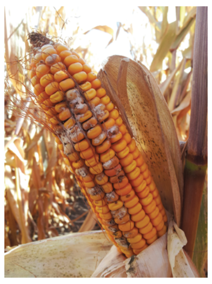
Figure 47.16 Corn ear with Fusarium ear rot.

The symptoms vary greatly depending on the genotype, environment, and disease severity. Individual infected kernels can be scattered in the ear, and under severe conditions, the fungus may consume the entire ear. Infected kernels have whitish pink to lavender fungal growth.