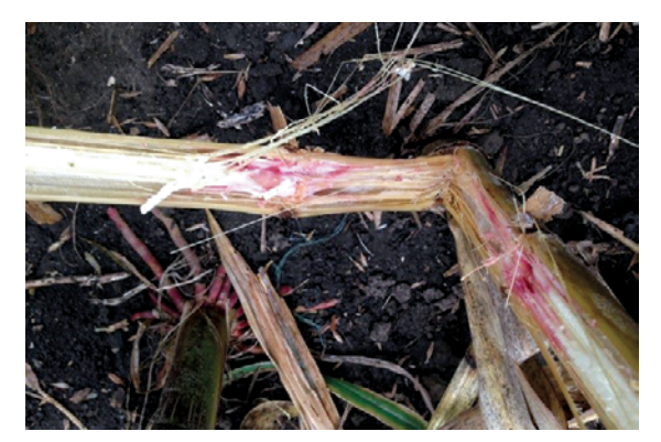
Figure 47.13 Gibberella stalk rot.

by the fungus Gibberella zeae , which is called Fusarium graminearum in its asexual stage. This fungus is also a common seedling pathogen of corn and soybeans, and the causal pathogen of Fusarium head blight (scab) of wheat, barley, oat, and rye. The symptoms are a pinkishred discoloration of the inside the cornstalk (Fig. 47.13). Perithecia (reproductive structures) may be observed on the surface of the stalk rind as small, round, black specks often near a node and are easily scratched off. Perithecia overwinter on the crop residue and act as the primary inoculum for the next growing season. This pathogen causes both ear rot and stalk rot of corn. Disease development is favored by warm, wet conditions. Stalk breakage and lodging often occur due to this disease. To