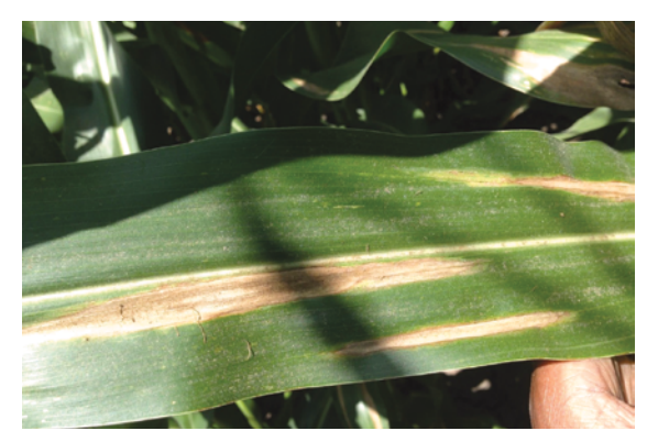
Figure 47.8 Northern corn leaf blight symptoms. Note the "cigar" shape of the lesion.

The symptoms associated with northern corn leaf blight are often referred to as cigar-shaped lesions (Fig. 47.8). They are typically 1- to 6-inches long, graygreen to tan-colored, and often observed on the lower leaves. As the disease develops, the lesions spread to all leafy structures, including the husks. The lesions may become so numerous that the leaves are eventually destroyed causing major reductions in yield due to lack of carbohydrates available to fill the grain. The leaves then become grayish-green and brittle, resembling leaves killed by frost. Yield losses can reach as high as 30-50% if the disease establishes itself before tasseling.