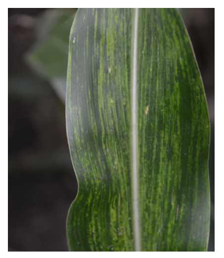
Figure 47.25 A close-up of brome mosaic virus symptoms. Notice the chlorotic mosaic streaks on the corn leaf.

Brome mosaic virus (BrMV) is transmitted by nematodes in the Longidoridae family. BrMV infects several grass species, and tillage along the field edges may move nematodes to the field. This virus is not common, but sometimes corn plants near field edges can be infected. Infected plants are stunted and leaves have mosaic, chlorotic streaks on the entire leaf (Fig. 47.25). Infection is systemic (throughout the entire plant) and infected plants do not produce an ear (Fig. 47.26). Sometimes infected plants die or are outcompeted by healthy plants. BrMV can be managed by using tolerant hybrids, avoiding movement of soil from the field edges, and controlling grassy weeds especially at the field edges.