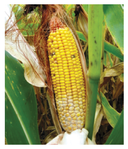
Figure 47.17a Diplodia ear rot on corn. Notice the dead ear leaf.

Aspergillus ear rot is most important ear disease because of the production of aflatoxins that are dangerous to humans and animals (Chapter 46). Two common species Aspergillus flavus and A. parasticus infect corn. Of these, A. flavus is the most predominant species. The fungus overwinters in the soil and debris and infection is favored by hot, dry weather. The fungus is spread to silk by wind or insects. This disease can be important under drought conditions. Insect damage predisposes the kernels to infection and consequent Aspergillus ear rot development. In most cases only a few kernels on an ear are infected. Infected kernels have masses of olive to yellow-