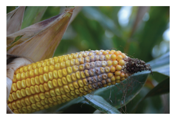
Figure 47.15 Gibberella ear rot on corn.

Gibberella ear rot, also called red rot, is quite common in corn especially under prolonged rainy weather late in the growing season. Its symptoms are characterized by a reddish mold that appears at the tip and grows down the ear (Fig. 47.15). If infected early, the entire ear may rot and be covered with a pinkish mycelium that causes the husk to tightly adhere to the ear. Gibberella ear rot is caused by Gibberella zeae . This pathogen overwinters on corn debris and has a wide host range including small grains. In wheat, this pathogen results in Fusarium head blight. The fungus infects the ear through silks and progresses down the ear. The disease is favored by cool, wet weather just after silking. Corn following corn is