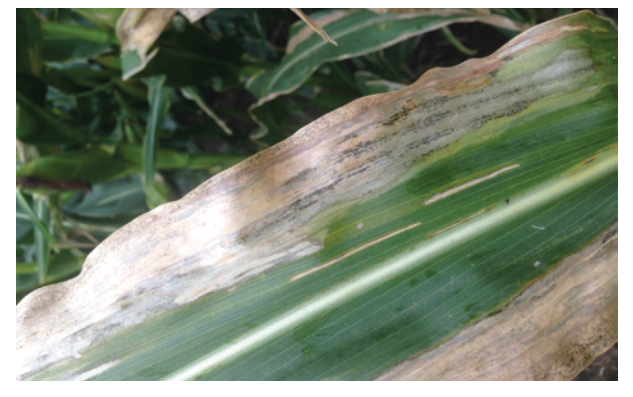
Figure 47.19a Characteristic lesion of Goss's wilt showing the black freckles (arrows) within the lesion.

The symptoms for Goss's bacterial wilt and leaf blight are foliar (leaf) blight (Fig. 47.19a) and a systemic wilt (Fig. 47.19b). Leaf blight is more common than systemic wilt. Lesions may be gray to tan in color with wavy, irregular margins that follow the leaf veins. The most obvious characteristics are the dark green to black water-soaked lesions often called "freckles" that appear on the infected area. Another characteristic of Goss's wilt is the bacterial ooze that may be found on the leaf surface. On the leaf surface, dry bacterial