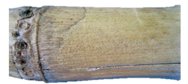
Figure 47.12 Diplodia stalk rot.

The fungus, Diplodia maydis (also known as Stenocarpella maydis ), causes both Diplodia stalk and ear rot of corn. The fungus overwinters on crop residue. Conidia (produced in the pycnidia) can be splashed onto