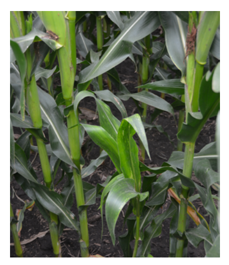
Figure 47.26 A stunted corn plant infected with brome mosaic virus between healthy plants. Such plant will not produce any ears.