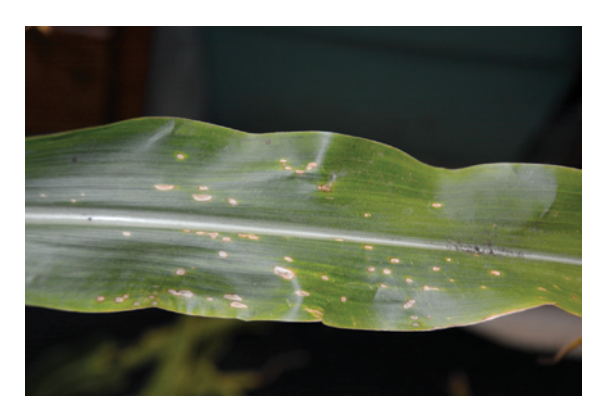
Figure 47.20 Holcus spot in corn.

Holcus spot symptoms can resemble chemical injury to leaves, similar to paraquat drift. Holcus spot is occasionally observed in South Dakota and typically does not reduce yield or reduce grain quality. The pathogen is caused by a bacterium called Pseudomonas syringae pv. syringae , which overwinters in crop debris. Wounds caused by hail, blowing soil or wind can increase chances of infection. Warm (75-85°F), wet, windy conditions early in the season favor infection and the development of Holcus leaf spot. The pathogen has a wide host range including many grasses and dicots. It can have ice nucleating activity that may enhance frost injury to corn leaves. Holcus spot symptoms first appear as water-soaked, dark green lesions near the tips of lower