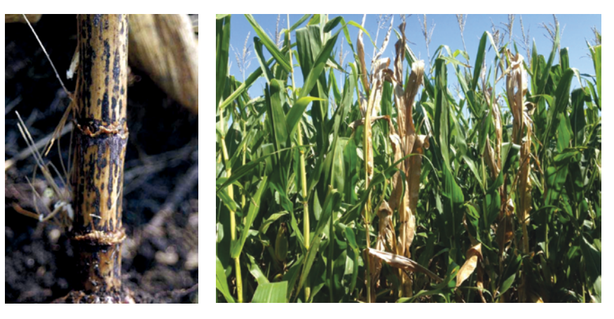
Figure 47.10 (a) Outer anthracnose stalk rot symptoms. (b) Corn plants killed by anthracnose stalk rot.

Anthracnose stalk rot of corn is caused by the fungus Colletotrichum graminicola , which overwinters on infested corn residues (leaves and stalks). This is the same fungus that can cause anthracnose leaf blight (see description above). However, presence of the leaf blight phase does not necessarily lead to stalk rot phase. The fungus produces reproductive structures, called acervuli, which contain setae