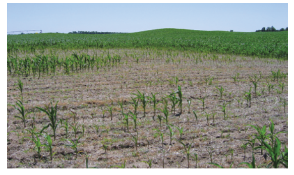
Figure 47.22 Severe damage caused by sting nematodes on corn.

Corn nematodes are microscopic, unsegmented roundworms that either feed inside the corn roots (endoparasites) or feed outside the corn roots (ectoparasites). Nematodes feed on root cells by puncturing the cell walls with their hollow stylets, which resemble minute hypodermic needles. Nematodes cause yield losses in corn in two ways: directly, by injuring cells and using up cell metabolites; and indirectly, by creating wounds that become entry points for bacterial, fungal, and viral pathogens. Over a dozen nematodes have been found to infect corn in South Dakota and the extent of yield loss will depend on the type of nematode, the population density in the soil, soil type (sandy