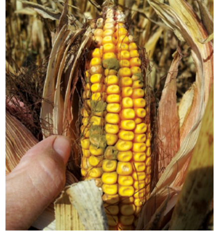
Figure 47.18 Aspergillus ear rot symptoms.

Bacterial diseases can be destructive if infections are severe and widespread. The selection of resistant hybrids and the use of other