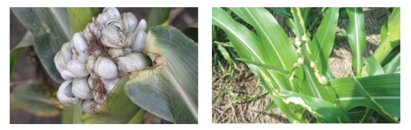
Figure 47.4 (a) Common smut on corn ear. (b) Common smut can also develop on leaves.

Corn smut is commonly observed in corn (dent, sweet, and popcorn) in South Dakota. However, corn smut is not usually an economically damaging disease. Corn plants generally are infected early in the growing season. Yield losses have been reported to be as high as 20% some years. Common smut of corn is caused by the fungus Ustilago maydis . Immature corn smut galls (called huitlacoche) are treated as a delicacy in Mexico. Spores from the common smut galls overwinter in the soil. These overwintering spores are called teliospores. Teliospores can be blown long distances with soil particles or carried into a new area on unshelled seed corn, and in manure from animals that are fed infected cornstalks. Spores germinate with moisture and air temperatures between 50-95°F. Common smut is most severe when young, actively growing plant tissues are wounded (Fig. 47.4).