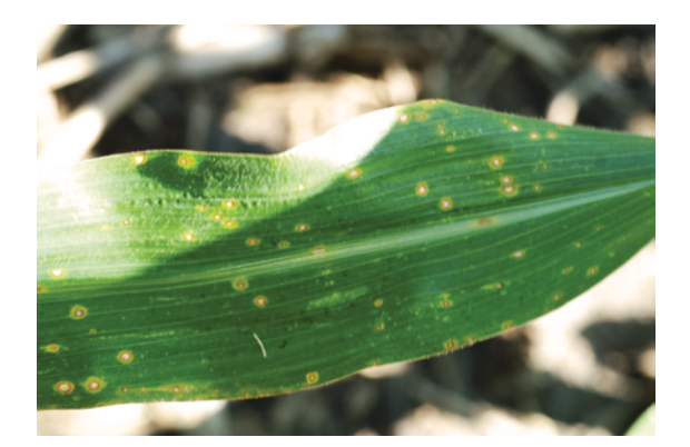
Figure 47.6 Eye spot on corn. Notice the yellow halo around the lesion.

1. Plant corn hybrids that have resistance to eye spot. Resistant hybrids are the main line of defense against this disease.