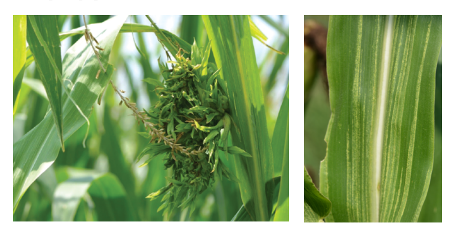
Figure 47.5 Crazy top of corn. (a) Proliferation of what would have been the tassel and (b) chlorotic stripes on the leaf caused by crazy top pathogen.

Young corn plants subjected to saturated soil conditions are prone to crazy top infection. This is a rare disease on corn in South Dakota but is observed occasionally on a few scattered corn plants along a field edge. Crazy top is caused by the soil-borne fungus Sclerophthora macrospora . This fungus attacks all types of corn and a number of wild grasses. Infected grasses at the edge of the field also serve as an additional inoculum