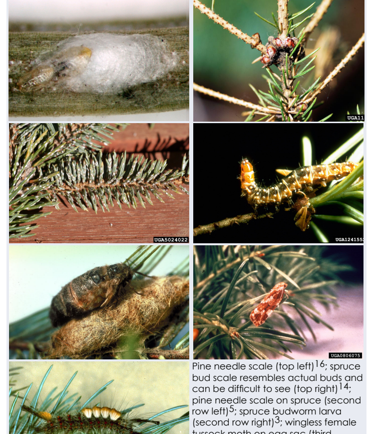
tussock moth on egg sac (third row left)<sup>17</sup>; adult spruce budworm (bottom right)<sup>3</sup>; tussock moth larvae have long tufts of white hairs on the back and long black tufts on both ends (bottom right)<sup>18</sup>.

Spruce bud scale (Physokermes piceae) is the major soft scale affecting spruce in Utah. This reddish-brown globular scale feeds on the twigs of spruce, producing honeydew, which can lead to the formation of black sooty mold growing on the spruce foliage. The overwintering stage is an immature scale on spruce needles. When feeding resumes in spring, the immature scales return to the twigs to feed, where they will spend the rest of their lives. Adult females will lay eggs in June with egg hatch occurring in late June to mid July.