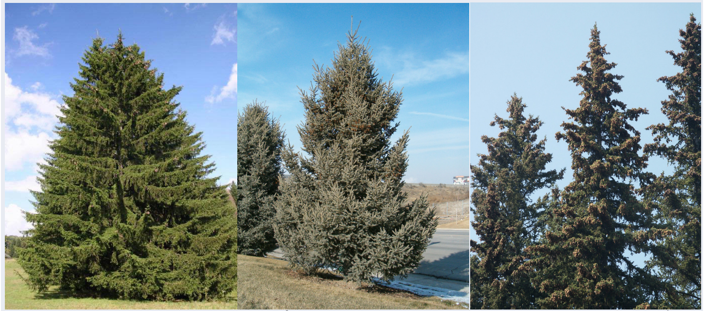
Common spruce trees left to right: Norway spruce (Picea abies)<sup>2</sup>, white spruce (Picea glauca 'Densata'), and Engelmann spruce (Picea engelmannii)<sup>1</sup>.

form and blue color. Many blue spruces are not blue at all, but green. Many of those with pronounced blue color are grafted.