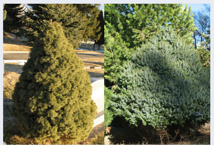
Left to right: White spruce (Picea glauca 'Conica'), and Serbian spruce (Picea omorika 'Nana') ^{\rm l}.

The rarest of the five Utah spruces described here, remarkable for its attractive needles that are dark green on top and almost white beneath and its narrow conical crown shape. They can be found growing in Utah and sometimes are available in nurseries, but are not common. Cultivars are available that have broader crowns, shrubby or weeping forms.