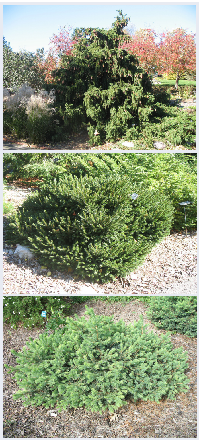
Common spruce trees top to bottom: while spruce (Picea abies 'Arocona'), while spruce (Picea abies 'Pumila'), and blue spruce (Picea pungens 'Mesa Verde') ^1 .