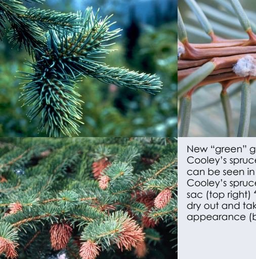
New "green" galls created by Cooley's spruce gall adelgid can be seen in spring (top left) <sup>3</sup>; Cooley's spruce gall adelgid egg sac (top right) <sup>4</sup>; by fall, green galls dry out and take on a "pine cone" appearance (bottom left)<sup>5</sup>.

If your tree is dying from the top down, bark beetles should be suspected. In Utah, two species of ips are responsible for most of the bark beetle-related spruce death-the spruce ips ( Ips hunteri ) and Engelmann spruce ips ( Ips pillifrons ). Both beetles overwinter under the bark of trees killed