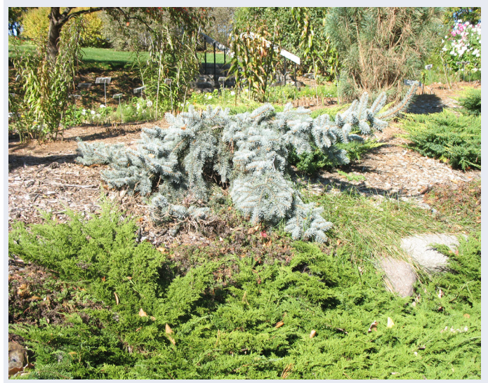
Blue spruce (Picea pungens 'Glauca Procumbens')<sup>1</sup>.

Spruces are common trees in cultivated landscapes in Utah. They have varied shapes, attractive foliage color, and can be fairly long-lived. They have pests, but not overly so, and are not very messy. Overall, the spruce genus ( Picea ) is commonly planted because it is a good tree for many landscape situations. There also are many native spruces in our mountains, and some of these come under cultivation when someone builds a cabin or other development occurs.