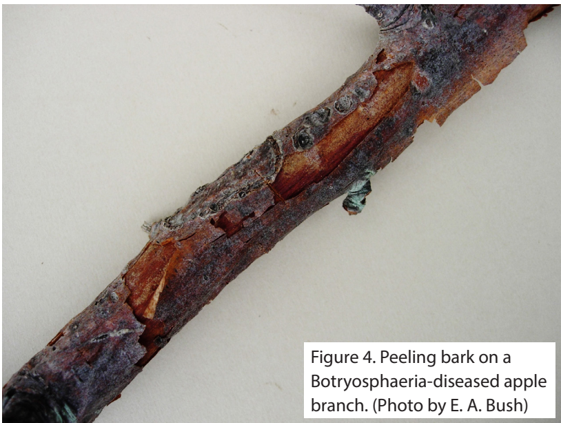
Figure 4. Peeling bark on a Botryosphaeria -diseased apple branch.

Cankered areas on tender stems of smooth-barked species, such as crab apple, may appear blistered (fig. 5). On gum-producing trees, such as sweetgum and Prunus species, gum may exude from cankered areas (fig. 6). Because of this symptom, Botryosphaeria canker and dieback on peach is called “gummosis.” Black fungal spore-producing structures (pycnidia) are sometimes present on diseased tissue and can be observed erupting through the bark. These fruiting bodies are white inside when sliced open (fig. 7).