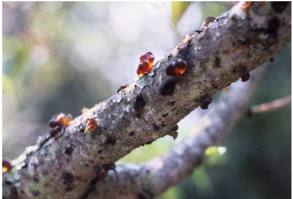
Figure 6. Gum exudation (gummosis) on a Botryosphaeria -diseased peach branch.