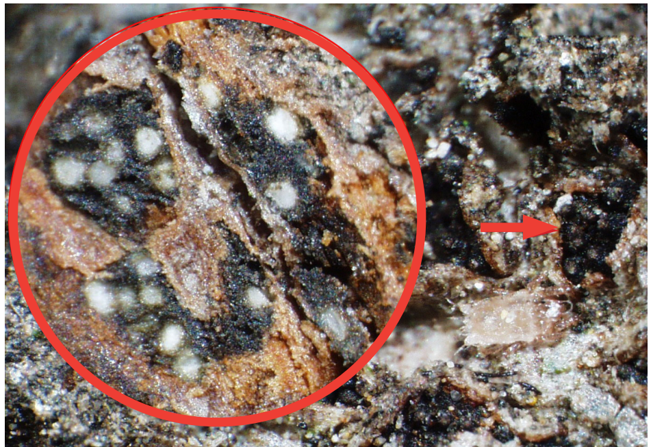
Figure 7. A magnified view of black fruiting bodies (pycnidia) [arrow] of Botryosphaeria species erupting through the bark of a Botryosphaeria -diseased photinia branch. The fruiting bodies are white inside when sliced open (circular inset).