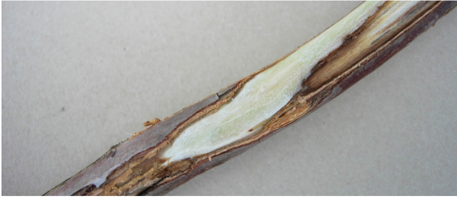
Figure 2. A wilting rhododendron branch with the bark partially removed to reveal the brown discoloration in the wood caused by Botryosphaeria species.