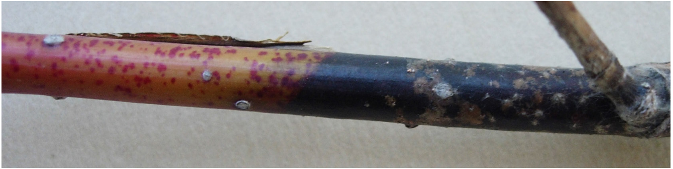
Figure 5. A Botryosphaeria canker (discolored tissue) on a smooth-barked bloodtwig dogwood.