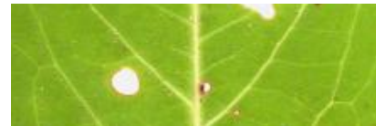
Leaf spots and shothole on English Laurel due to Pseudomonas .