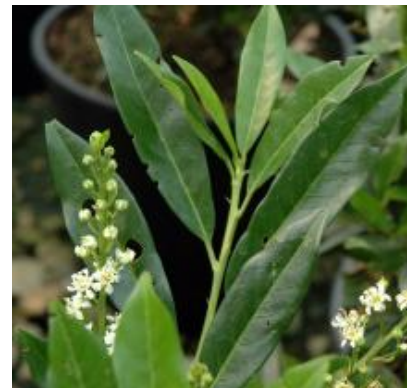
Note the holes in the leaves both along the margins as well as in the leaf blade.

Symptoms Necrotic leaf spots with circular to irregular margins. Bacterial spots are brown surrounded by a reddish border with a yellow halo. Abscission layers