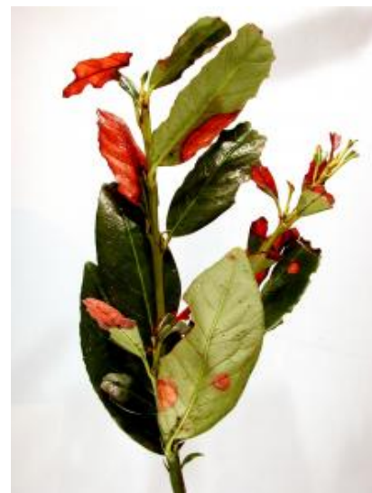
Leaf spots and shothole due to the fungus Wilsonomyces carpophilus .