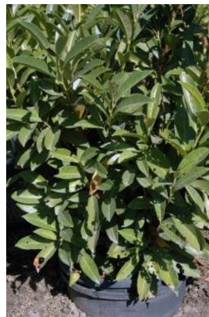
Shothole symptoms are more obvious near the base of this plant.