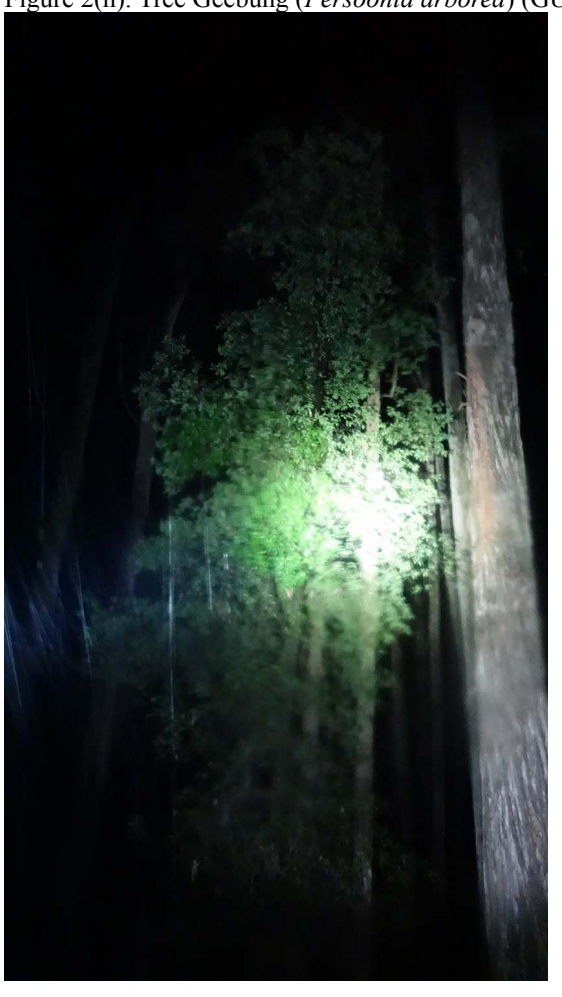
170914 - Stony Creek_Plantation Road_Toolangi State Forest – Tree Geebung & Greater Gliders - FFRC