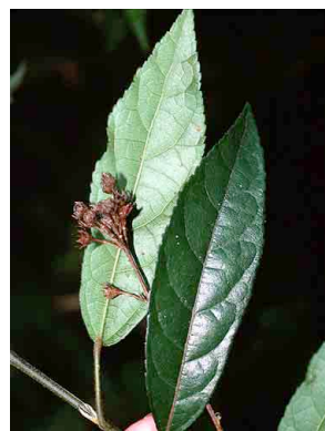
28 Pavonia MALVACEAE