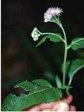
2 Ageratum ASTERACEAE