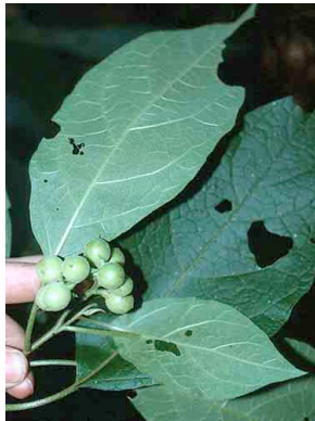
47 Lycianthes heteroclita SOLANACEAE