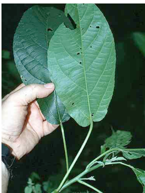
17 Acalypha EUPHORBIACEAE