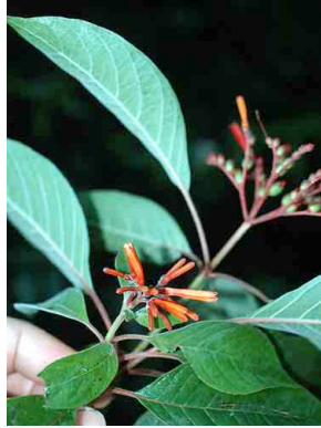
43 Hamelia patens RUBIACEAE