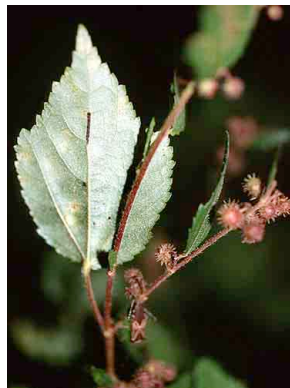
53 Triumfetta TILIACEAE