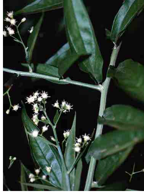
3 Baccharis ASTERACEAE