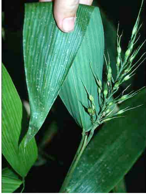
41 Olyra latifolia POACEAE