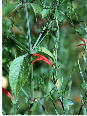
44 Dicliptera sexangularis SCROPHULARIACEAE