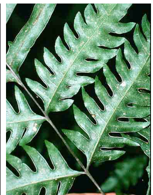
60 Pteris PTERIDOPHYTA