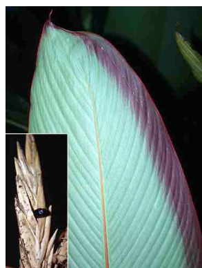
33 Pleistachya purpurascens