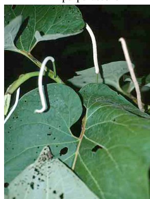
38 Piper auritum PIPERACEAE