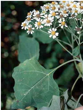
7 Podachaenium eminens ASTERACEAE