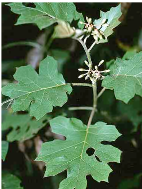
51 Solanum torvum SOLANACEAE