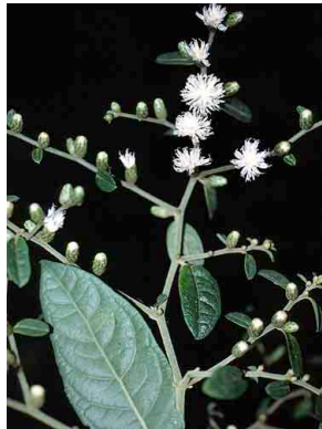
8 Vernonia ASTERACEAE