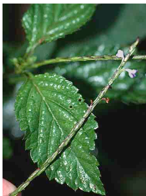
57 Stachytarpheta cayennensis VERBENACEAE