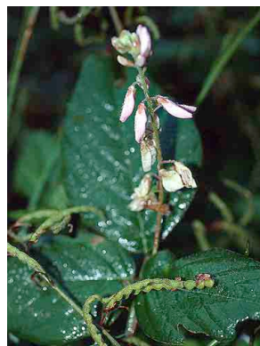
19 Desmodium FABACEAE