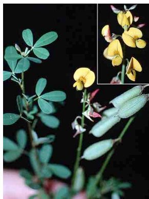
18 Crotalaria FABACEAE