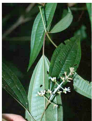
36 Miconia affinis MELASTOMATACEAE