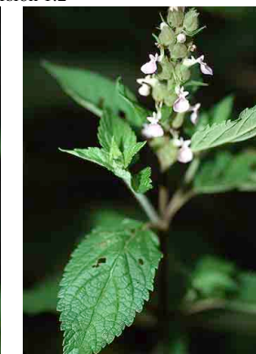
25 Teucrium vesicarium LAMIACEAE