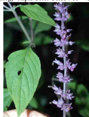
24 Salvia LAMIACEAE