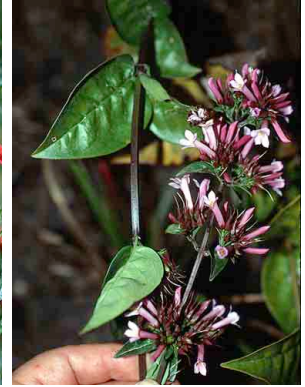
45 Russelia campechiana SCROPHULARIACEAE