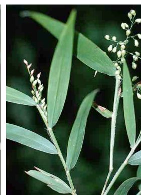
40 Lasiacis POACEAE