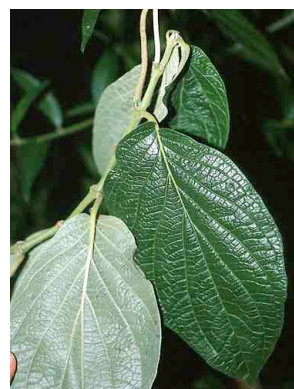
39 Piper jacquemontianum PIPERACEAE