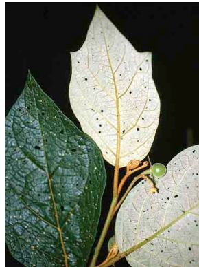
49 Solanum erythrotichum SOLANACEAE