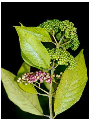
56 Callicarpa acuminata VERBENACEAE