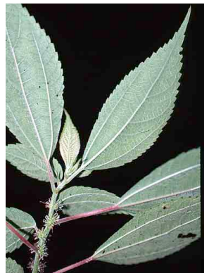
54 Boehmeria ramiflora URTICACEAE