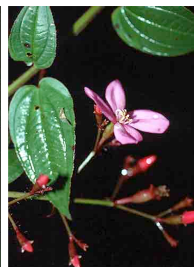
35 Arthrostemma ciliatum MELASTOMATACEAE