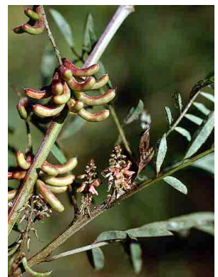
20 Indigofera FABACEAE