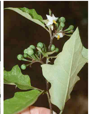
50 Solanum rudepannum SOLANACEAE