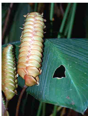
32 Calathea crotalifera MARANTACEAE