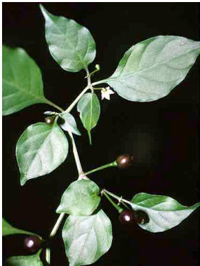
46 Capsicum anuum SOLANACEAE