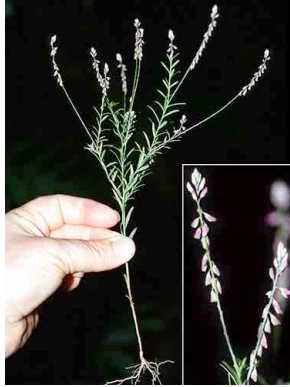
42 Polygala paniculata POLYGALACEAE