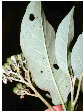
48 Solanum erianthum SOLANACEAE