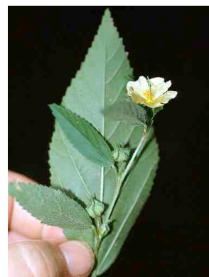
29 Sida MALVACEAE