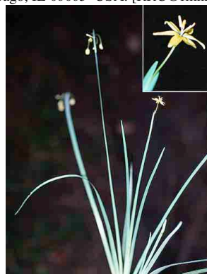
23 Sisyrinchium tinctorium IRIDACEAE