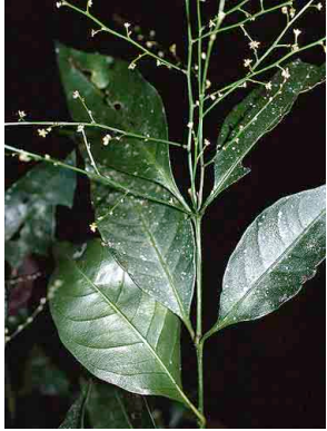
1 Iresine nigra AMARANTHACEAE