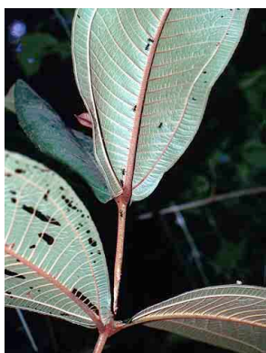
37 Miconia impetiolearis MELASTOMATACEAE