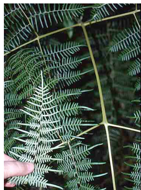
59 Pteridium aquilinum PTERIDOPHYTA