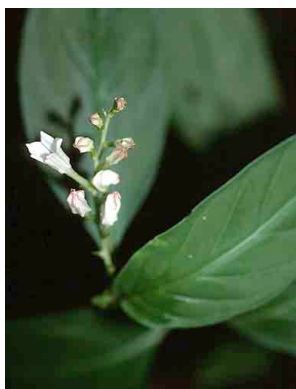
26 Spigelia humboldtiana LOGANIACEAE