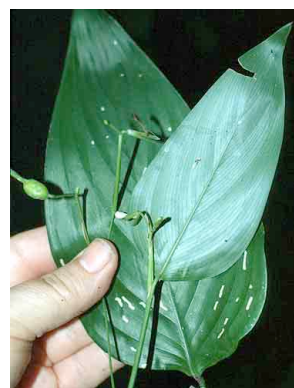
34 Maranta gibba MARANTACEAE