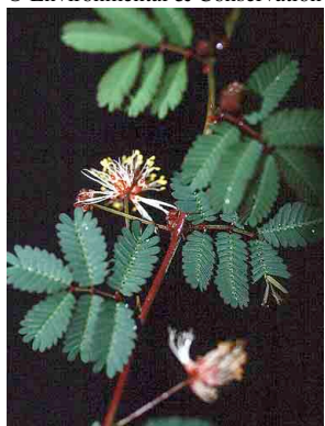
21 Mimosa FABACEAE