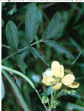
22 Senna FABACEAE