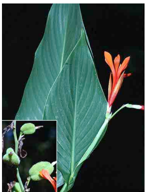
16 Canna CANNACEAE