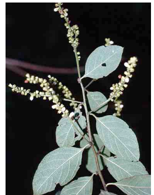
15 Cordia spinescens BORAGINACEAE