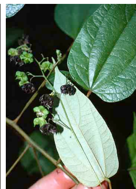
30 Wissadula MALVACEAE