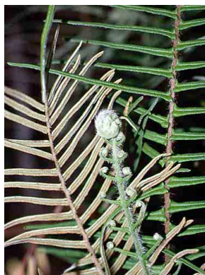
58 Blechnum PTERIDOPHYTA