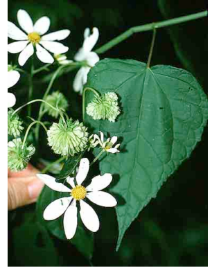
5 Montanoa atriplicifolia ASTERACEAE