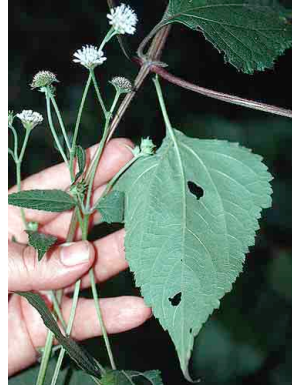
4 Melanthera nivea ASTERACEAE