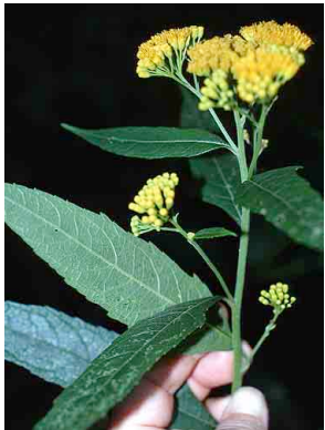
6 Neurolaena lobata ASTERACEAE