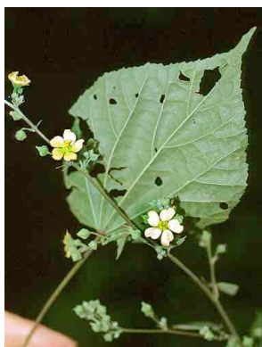
27 Pavonia paniculata MALVACEAE