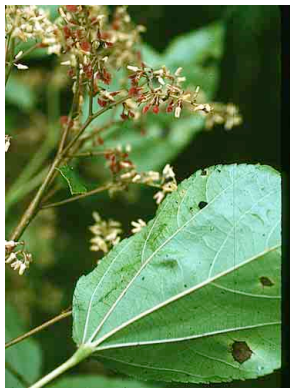
52 Heliocarpus donnell-smithii TILIACEAE