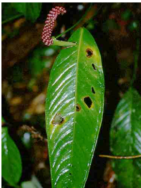
11 Anthurium 6 ARACEAE