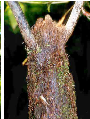
189 Cyathea 3 PTERIDOPHYTA