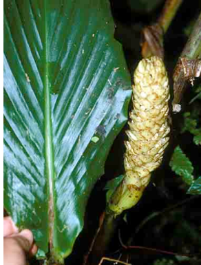
182 Renealmia 1 ZINGIBERACEAE