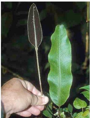
191 Elaphoglossum 1 PTERIDOPHYTA