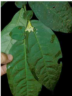
171 Lycianthes SOLANACEAE