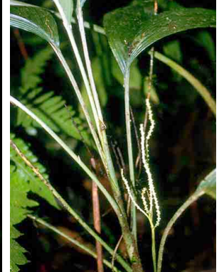
25 Chamaedorea palmeriana ARECACEAE