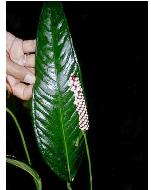
10 Anthurium 5 ARACEAE