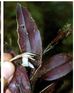
120 Epidendrum 4 ORCHIDACEAE