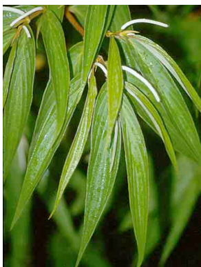
136 Piper 1 PIPERACEAE