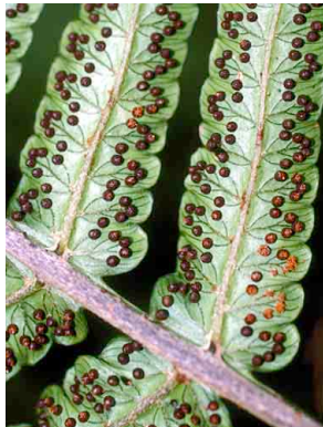
187 Cyathea 1 PTERIDOPHYTA