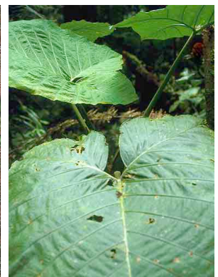
20 Xanthosoma ARACEAE