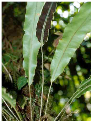
192 Elaphoglossum 2 PTERIDOPHYTA