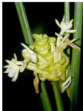
98 Calathea 2 MARANTACEAE