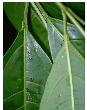
180 Citharexylum VERBENACEAE