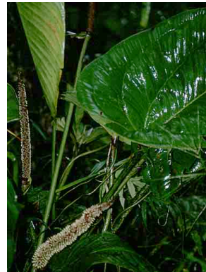
9 Anthurium 4 ARACEAE