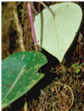
132 Peperomia 3 PIPERACEAE