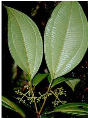
107 Ossaea 1 MELASTOMATACEAE