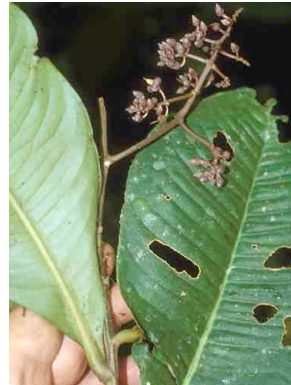
113 Ardisia MYRSINACEAE