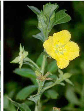
114 Ludwigia ONAGRACEAE