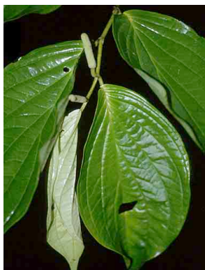
137 Piper 2 PIPERACEAE