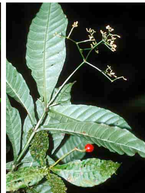
159 Psychotria aff. orosiana RUBIACEAE