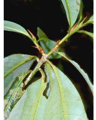
65 Erythroxylum macrophyllum ERYTHROXYLACEAE