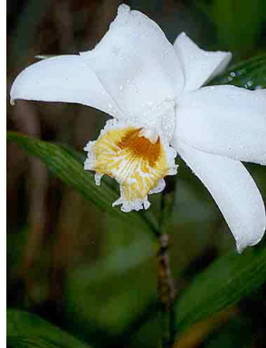
124 Sobralia ORCHIDACEAE