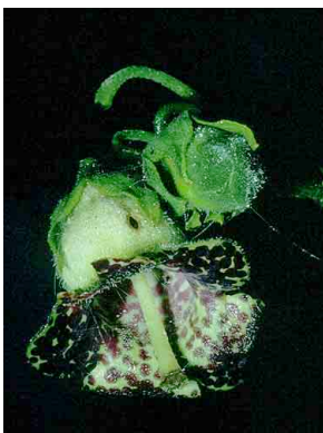
77 Capanea grandiflora GESNERIACEAE