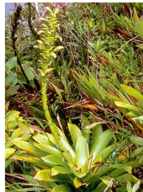
39 Guzmania BROMELIACEAE