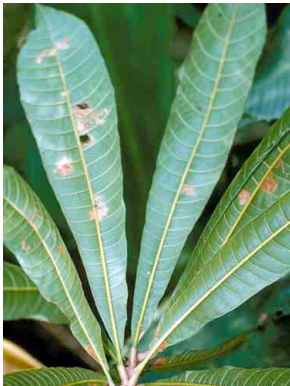
167 Meliosma SABIACEAE