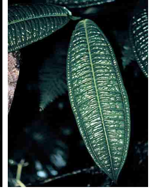
145 Faramea suerrensii RUBIACEAE