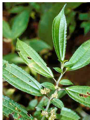
179 Pilea 3 URTICACEAE