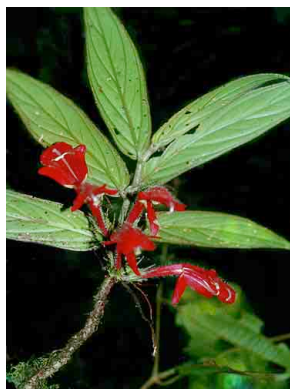
78 Columnnea dressleri GESNERIACEAE