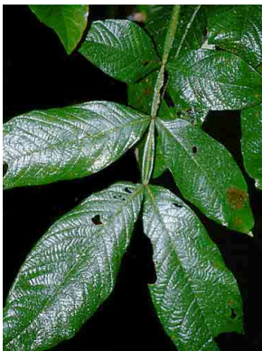
72 Inga leonis FABACEAE