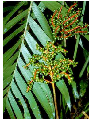
29 Chamaedorea 2 ARECACEAE