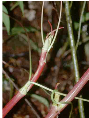
169 Smilax SMILACACEAE