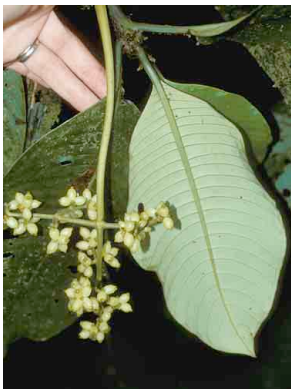
156 Notopleura RUBIACEAE