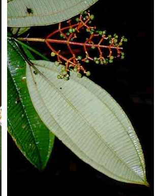
105 Miconia 2 MELASTOMATACEAE