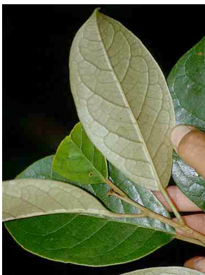
66 Hyeronima EUPHORBIACEAE