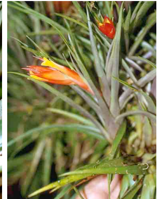
35 Guzmania angustifolia BROMELIACEAE