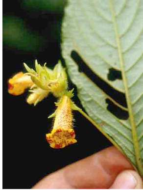
82 Gasteranthus wendlandianus GESNERIACEAE