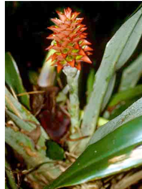
34 Aechmea BROMELIACEAE