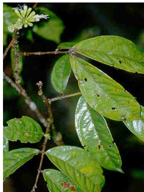
73 Inga punctata FABACEAE