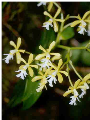
117 Epidendrum 1 ORCHIDACEAE