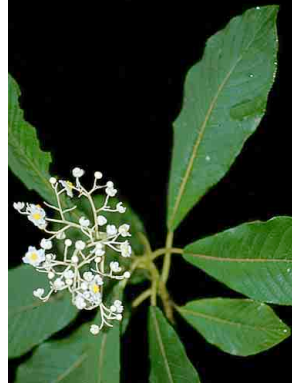
3 Saurauia pittieri ACTINIDIACEAE