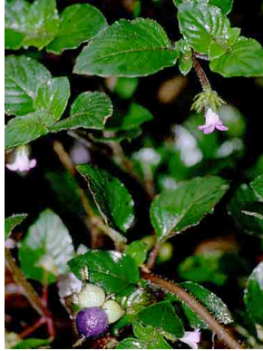
142 Coccocypselum RUBIACEAE