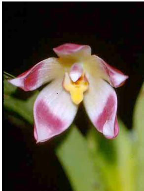
126 Sp 1 ORCHIDACEAE