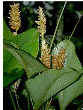
94 Calathea 3 MARANTACEAE