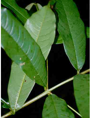
181 Vochysia cf. hondurensis VOCHYSIACEAE