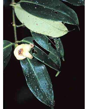
165 Schradera neooides RUBIACEAE