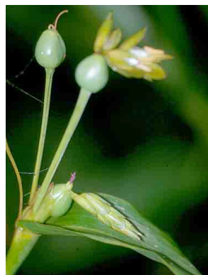
140 Coix lacryma-jobi POACEAE