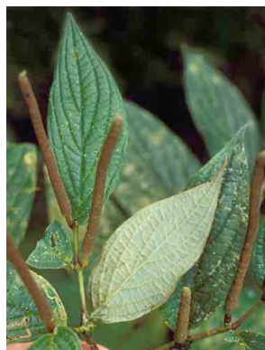
139 Piper 4 PIPERACEAE