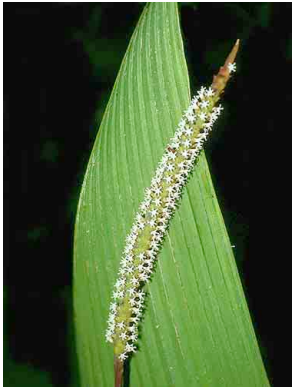
31 Geonoma 2 ARECACEAE