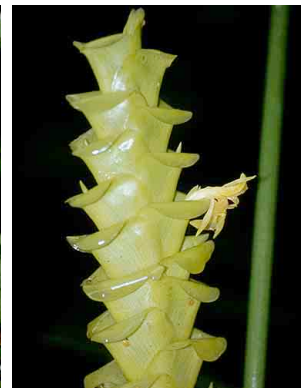
95 Calathea 3 MARANTACEAE