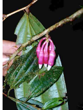
64 Psammisia ramiflora ERICACEAE