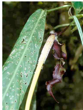
13 Anthurium 8 ARACEAE