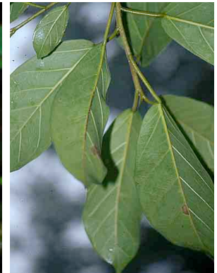
110 Ficus 1 MORACEAE