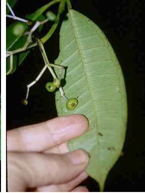
144 Faramea multiflora RUBIACEAE