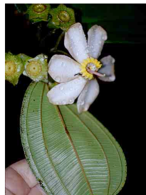
99 Blakea MELASTOMATACEAE