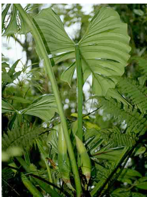
16 Philodendron 2 ARACEAE