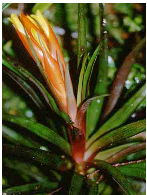
36 Guzmania melinonis BROMELIACEAE