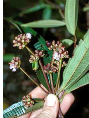
103 Conostegia 2 MELASTOMATACEAE