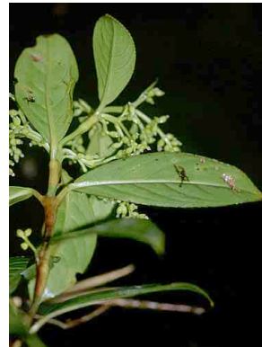
49 Hedyosmum montanum CHLORANTHACEAE