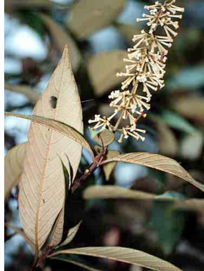
163 Rondeletia buddleioides RUBIACEAE