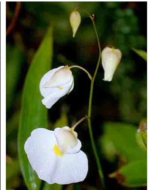
90 Utricularia endresii LENTIBULARIACEAE