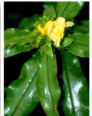
55 Costus villosissimus COSTACEAE