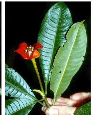
160 Psychotria elata RUBIACEAE