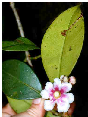
52 Clusia 1 CLUSIACEAE