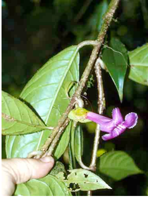
81 Drymonia l GESNERIACEAE