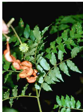
69 Cojoba sophorocarpa FABACEAE