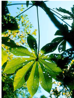
47 Cecropia CECROPIACEAE