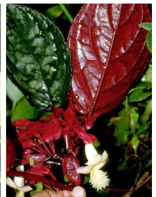
80 Drymonia turrialvae GESNERIACEAE