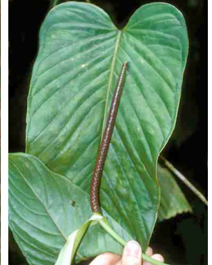
5 Anthurium cuspidatum ARACEAE