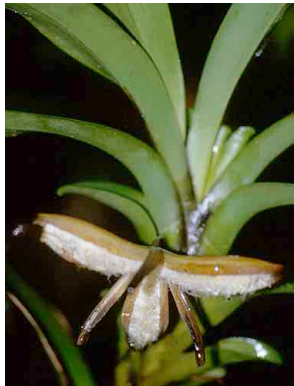
127 Sp 1 ORCHIDACEAE