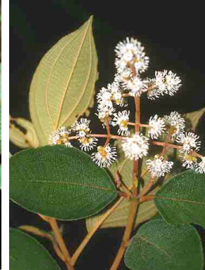
104 Miconia 1 MELASTOMATACEAE