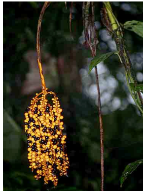
28 Chamaedorea 1 ARECACEAE