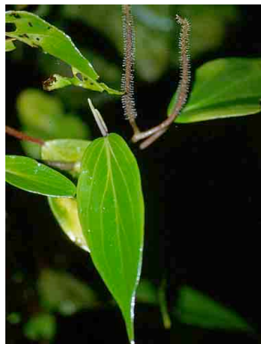
133 Peperomia 4 PIPERACEAE