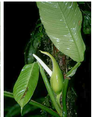
15 Philodendron 1 ARACEAE