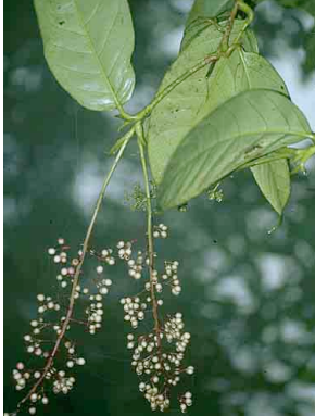
22 Schefflera ARALIACEAE