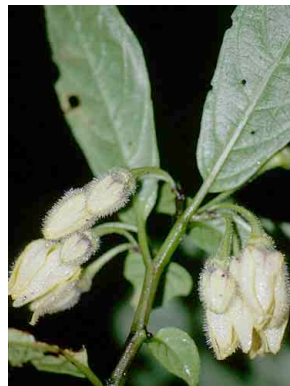
174 Solanum 3 SOLANACEAE