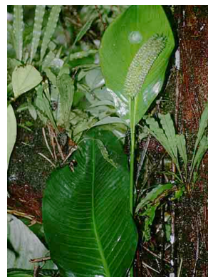
19 Spathiphyllum ARACEAE