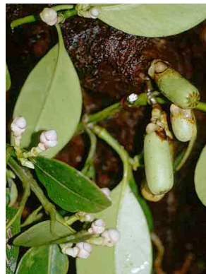
53 Clusia 2 CLUSIACEAE