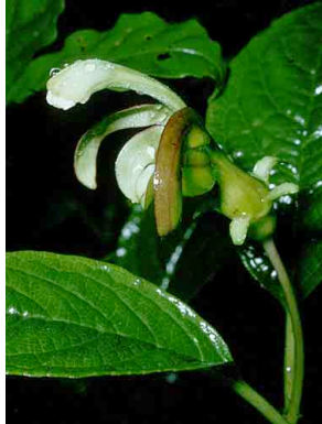
42 Burmeistera cyclostigma CAMPANULACEAE