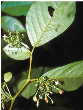
172 Solanum 1 SOLANACEAE