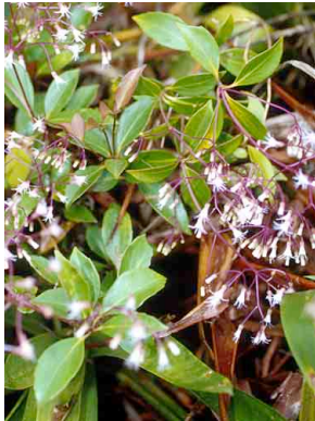
32 Dresslerothamnus peperonioides ASTERACEAE