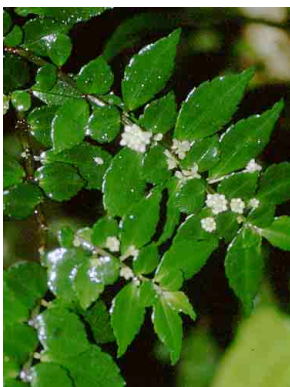
177 Pilea 1 URTICACEAE