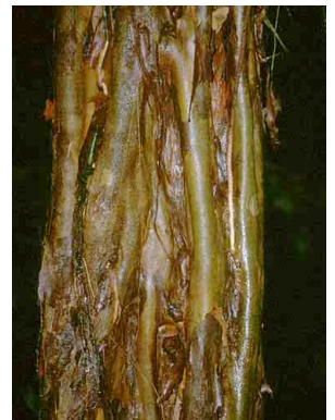
175 Ticoendron incognitum TICODENDRACEAE