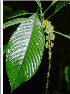
154 Notopleura aggregata RUBIACEAE