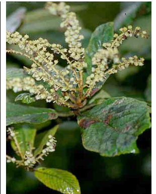
50 Clethra CLETHRACEAE