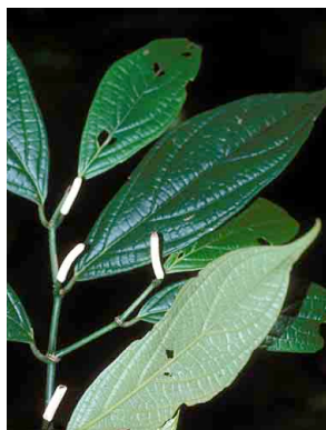
138 Piper 3 PIPERACEAE