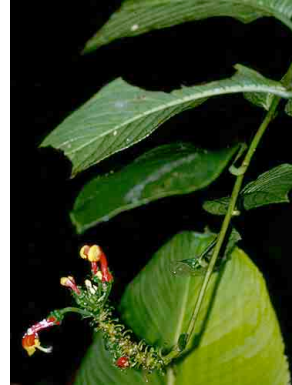
44 Centropogon granulosis CAMPANULACEAE