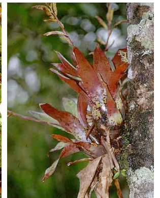
40 Tillandsia BROMELIACEAE