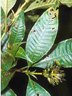
161 Psychotria RUBIACEAE