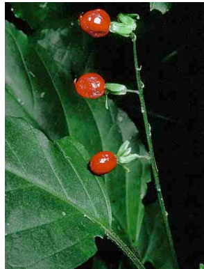
129 Rivina humilis PHYTOLACCACEAE