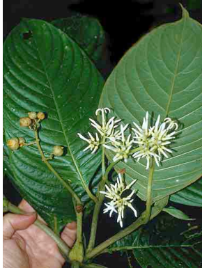
162 Raritebe palicoureoides RUBIACEAE