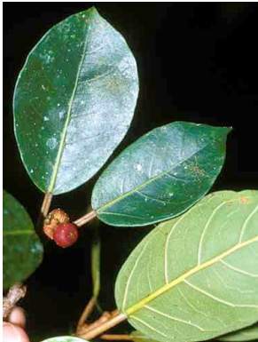
111 Ficus 2 MORACEAE