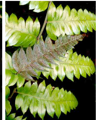
190 Diplazium PTERIDOPHYTA