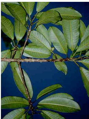
67 Sapium laurifolium EUPHORBIACEAE