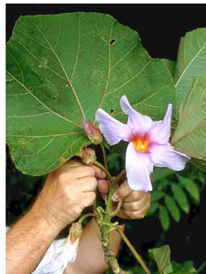
93 Wercklea insignis MALVACEAE