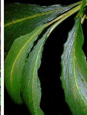
184 Renealmia 3 ZINGIBERACEAE