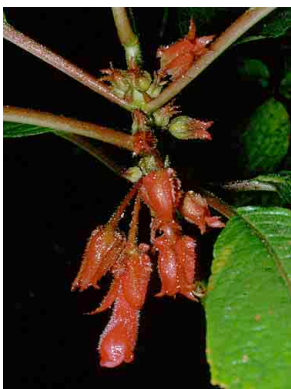
76 Alloplectus tetragonus GESNERIACEAE