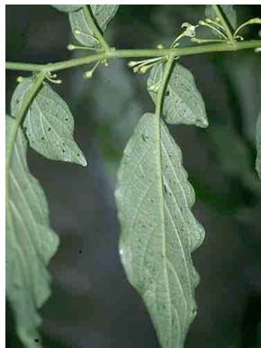
173 Solanum 2 SOLANACEAE