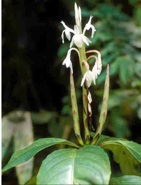
1 Aphelandra dolichantha ACANTHACEAE