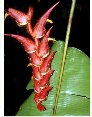
85 Heliconia magnifica HELICONIACEAE