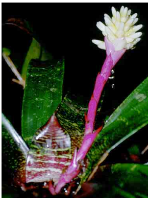
37 Guzmania musaica BROMELIACEAE