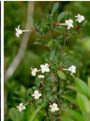
149 Hillia palmana RUBIACEAE