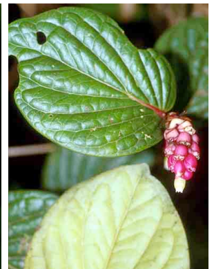
60 Cavendishia axillaris ERICACEAE