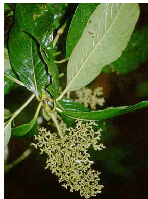
158 Psychotria luxurians RUBIACEAE