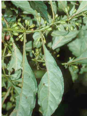
152 Hoffmannia RUBIACEAE