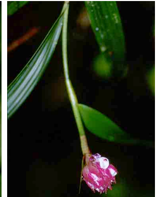
115 Elleanthus ORCHIDACEAE