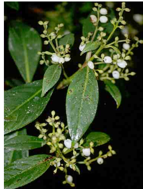
48 Hedyosmum correanum CHLORANTHACEAE