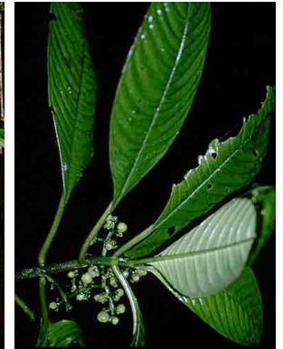
155 Notopleura macrophylla RUBIACEAE