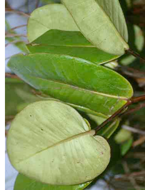
4 Alzatea verticillata ALZATEACEAE