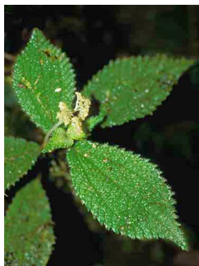
178 Pilea 2 URTICACEAE