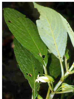
79 Drymonia lanceolata GESNERIACEAE