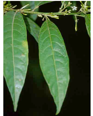
170 Cestrum SOLANACEAE