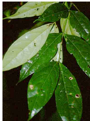
74 Inga FABACEAE