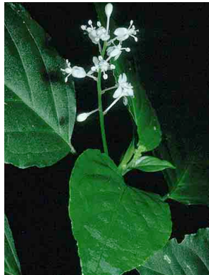
128 Rivina humilis PHYTOLACCACEAE