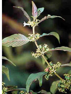
164 Sabicea panamensis RUBIACEAE