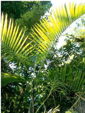
27 Chamaedorea woodsoniana ARECACEAE