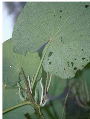
135 Piper umbellatum PIPERACEAE