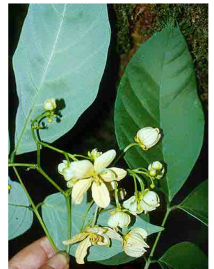
75 Senna FABACEAE