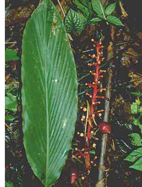
183 Renealmia 2 ZINGIBERACEAE