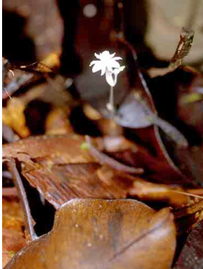
41 Gymnosiphon suaveolens BURMANNIACEAE