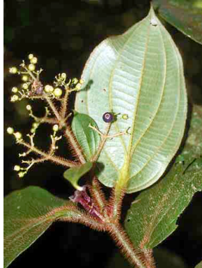
102 Conostegia 1 MELASTOMATACEAE