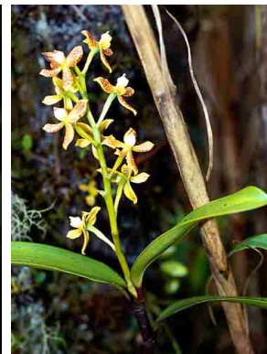
119 Epidendrum 3 ORCHIDACEAE