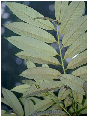
112 Virola MYRISTICACEAE