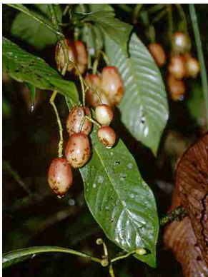
51 Chrysochlamys CLUSIACEAE