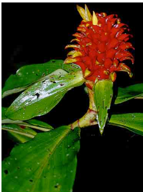
56 Costus COSTACEAE