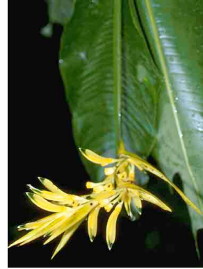
84 Heliconia hirsuta HELICONIACEAE