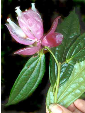
62 Cavendishia megabracteata ERICACEAE