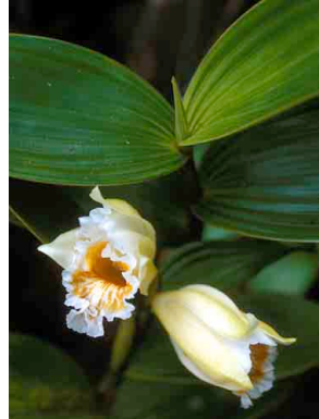
125 Sobralia ORCHIDACEAE