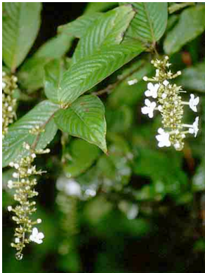
146 Gonzalagunia panamensis RUBIACEAE