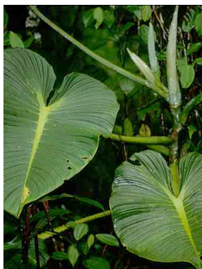
17 Philodendron 3 ARACEAE