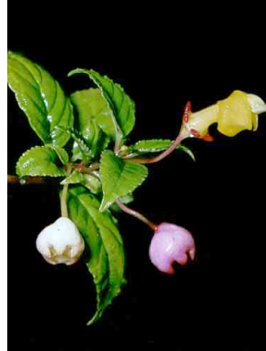
43 Burmeistera parviflora CAMPANULACEAE