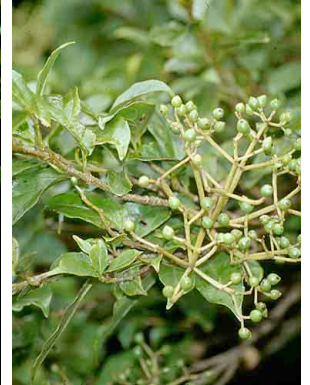
45 Viburnum costaricanum CAPRIFOLIACEAE