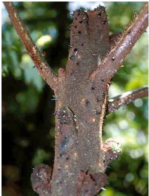
186 Cyathea 1 PTERIDOPHYTA