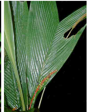
30 Geonoma 1 ARECACEAE