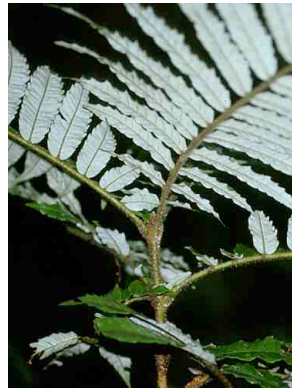
88 Alfaraea costaricensis JUGLANDACEAE