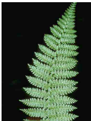
195 Trichomanes PTERIDOPHYTA