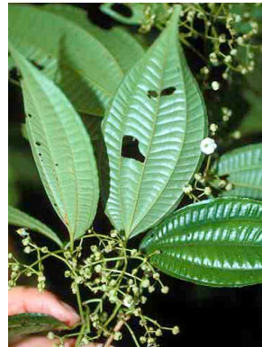
108 Ossaea 2 MELASTOMATACEAE