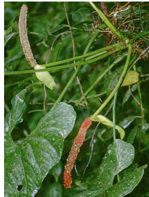
8 Anthurium 3 ARACEAE