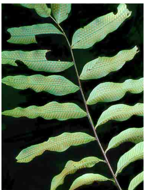
194 Polypodium PTERIDOPHYTA