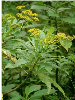
33 Senecio ASTERACEAE