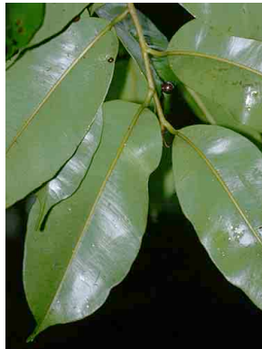
168 Micropholis SAPOTACEAE