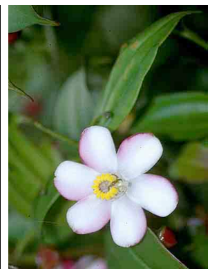
100 Blakea MELASTOMATACEAE