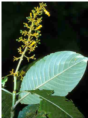
157 Palicourea RUBIACEAE