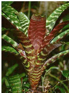
38 Guzmania musaica BROMELIACEAE