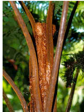
188 Cyathea 2 PTERIDOPHYTA