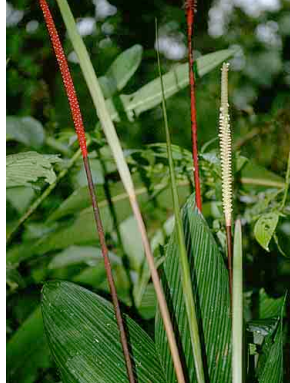
23 Calyptrogyne ghiesbreghtiana ARECACEAE