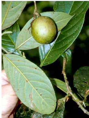
87 Calatola costaricensis ICACINACEAE