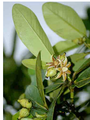
54 Clusia 3 CLUSIACEAE