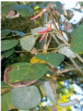
71 Erythrina l FABACEAE