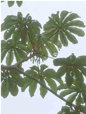
46 Cecropia CECROPIACEAE