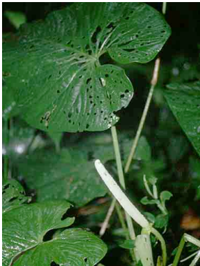
6 Anthurium 1 ARACEAE