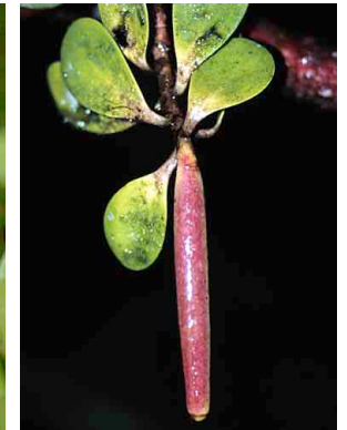
150 Hillia RUBIACEAE