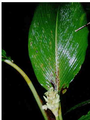
97 Calathea 2 MARANTACEAE