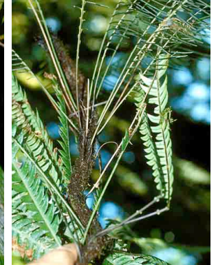
185 Blechnum PTERIDOPHYTA