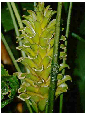
96 Calathea 1 MARANTACEAE