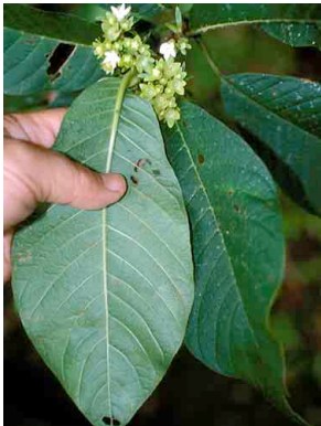
166 Sommera donnell-smithii RUBIACEAE