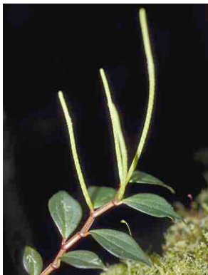
131 Peperomia 2 PIPERACEAE