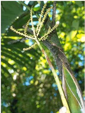
26 Chamaedorea scheryi ARECACEAE