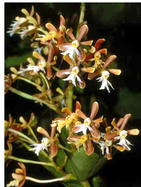
118 Epidendrum 2 ORCHIDACEAE