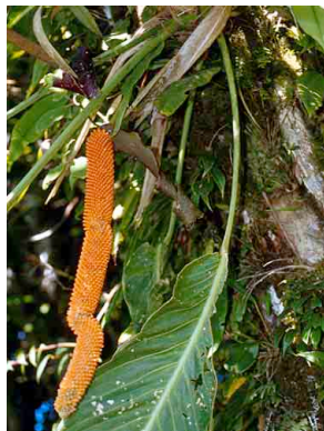
12 Anthurium 7 ARACEAE