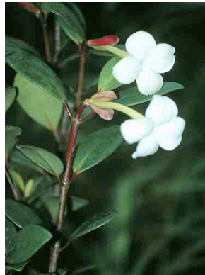
148 Hillia palmana RUBIACEAE