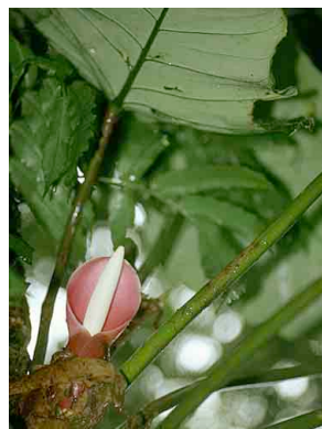
18 Philodendron 4 ARACEAE