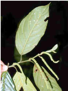
86 Calatola costaricensis ICACINACEAE