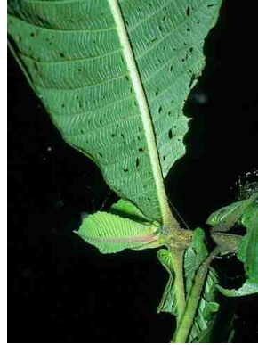
143 Elaeagia auriculata RUBIACEAE