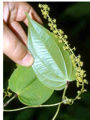
59 Dioscorea racemosa DIOSCOREACEAE