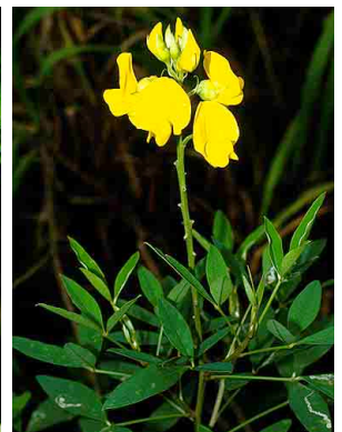
70 Crotalaria sagittalis FABACEAE