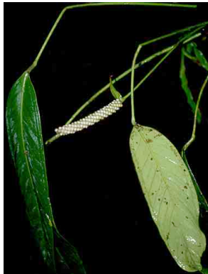
7 Anthurium 2 ARACEAE