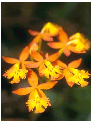
116 Epidendrum radicans ORCHIDACEAE