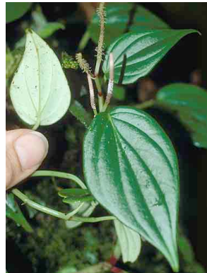
130 Peperomia 1 PIPERACEAE