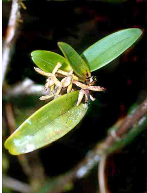
121 Maxillaria ORCHIDACEAE