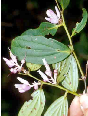
61 Cavendishia bracteata ERICACEAE