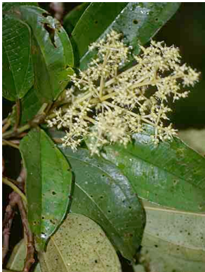
106 Miconia 3 MELASTOMATACEAE