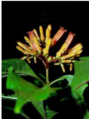
147 Hamelia patens RUBIACEAE