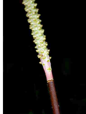
24 Calyptrogyne ghiesbreghtiana ARECACEAE