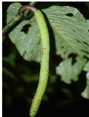
134 Piper augustum PIPERACEAE