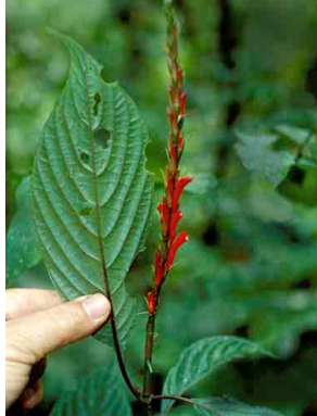
2 Razisea spicata ACANTHACEAE