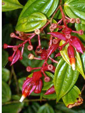
63 Cavendishia quereme ERICACEAE