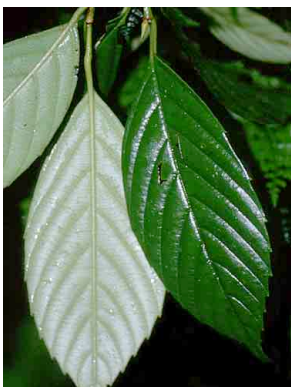
176 Ticoendron incognitum TICODENDRACEAE