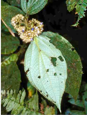
101 Clidemia MELASTOMATACEAE