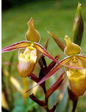
122 Phragmipedium ORCHIDACEAE