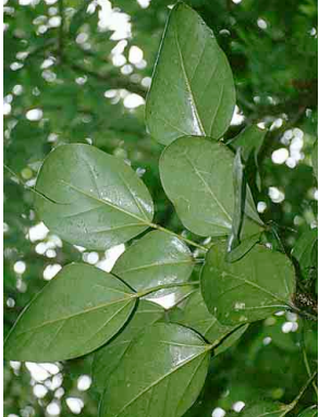
21 Dendropanax ARALIACEAE