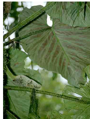
14 Philodendron verrucosum ARACEAE