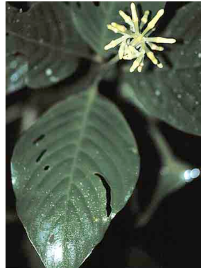
153 Joosia umbellifera RUBIACEAE