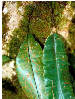
193 Oleandra PTERIDOPHYTA