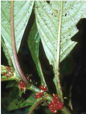
151 Hoffmannia congesta RUBIACEAE