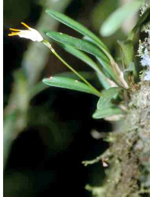
123 Pleurothallis ORCHIDACEAE