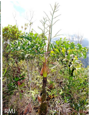
19a Dypsis coursii above camp III