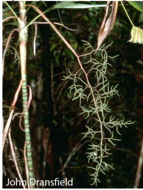
3b Dypsis forcifolia