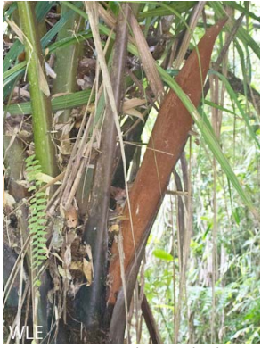
5b Dypsis perrieri