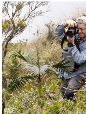
20b Dypsis pumila