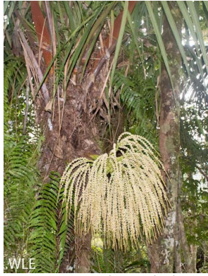
5c Dypsis perrieri