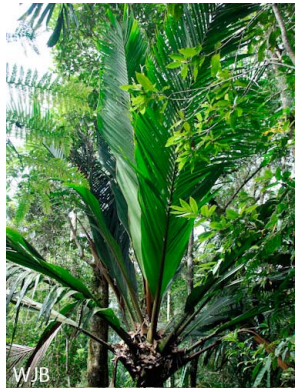
14a Marojejya insignis camp II – III