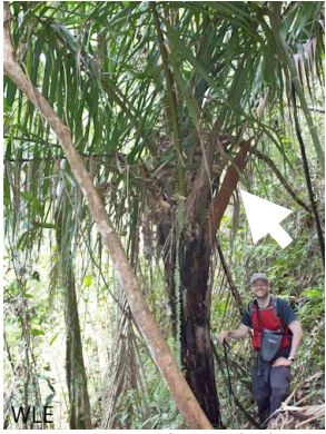
5a Dypsis perrieri entrance – camp III