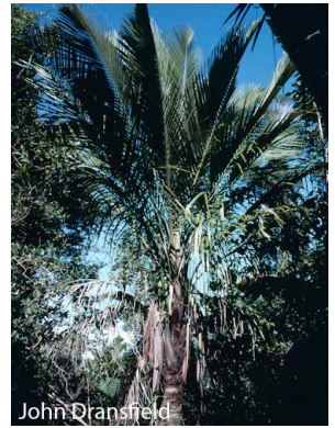
16a Ravenea robustior camp II – III