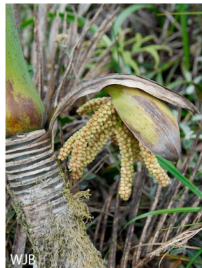
20c Dypsis pumila