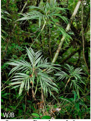
9 Dypsis cookei camp II – III