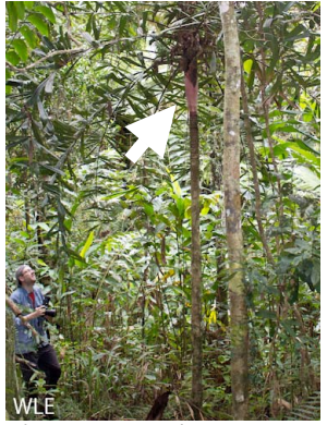
6a Dypsis rosea entrance – camp II