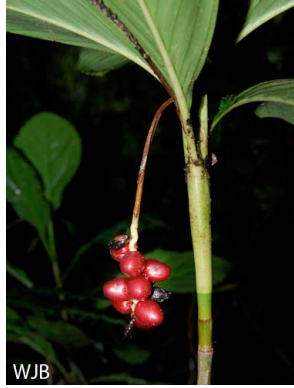
12c Dypsis spicata