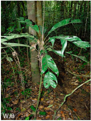
3a Dypsis forcifolia entrance – camp II