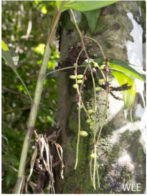
4b Dypsis lokohoensis