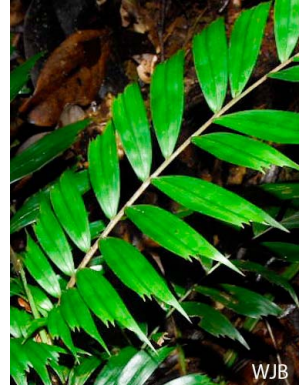
13b Dypsis thiryana