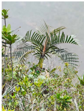
20a Dypsis pumila above treeline