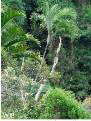
7a Dypsis baronii around camp II