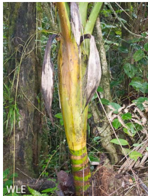
17b Dypsis unknown species