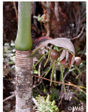
20d Dypsis pumila