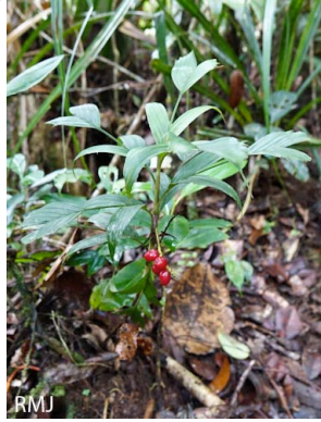
12b Dypsis spicata