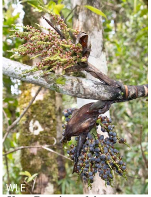
8b Dypsis andrianatonga