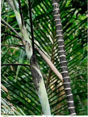
7b Dypsis baronii