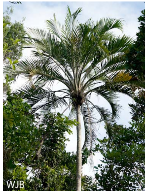
15a Ravenea sambiranensis camp II – treeline