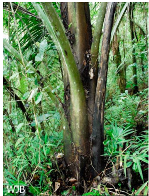
16b Ravenea robustior