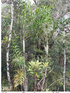
11a Dypsis oreophila camp II – III