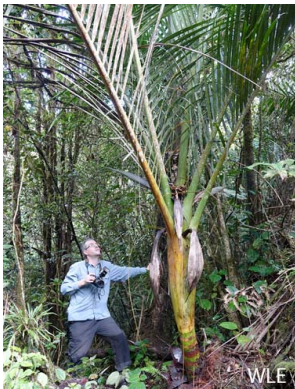
17a Dypsis unknown species around camp III