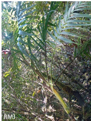
18 Dypsis acuminum camp II – treeline