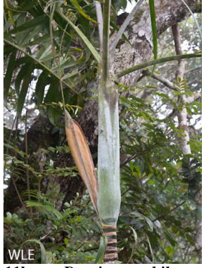
11b Dypsis oreophila