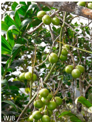
19b Dypsis coursii