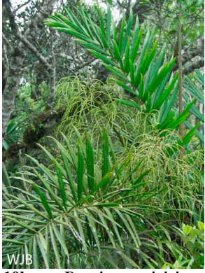
10b Dypsis marojejyi