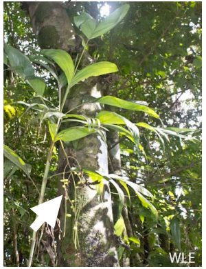
4a Dypsis lokohoensis entrance – camp III