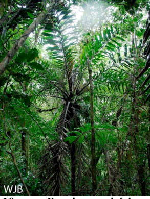
10a Dypsis marojejyi camp II – treeline