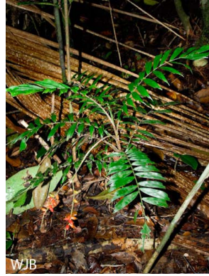
13a Dypsis thiryana camp II – III