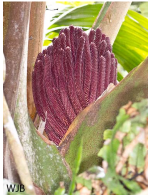
14b Marojejya insignis