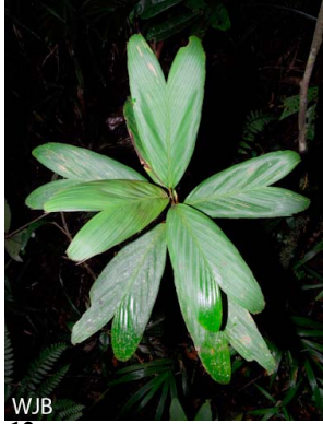
12a Dypsis spicata camp II – III

For more information on Madagascan palms see www.palmweb.org and Dransfield et al. (2006) Field guide to the palms of Madagascar . Kew Publishing, Richmond, Surrey, UK. version 1 12/2015