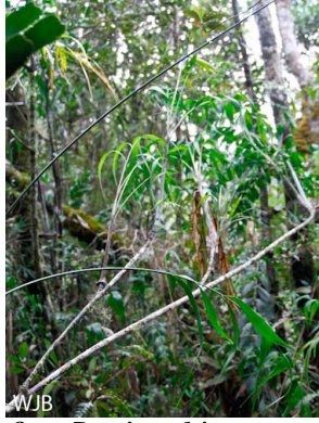
8a Dypsis andrianatonga camp II – treeline