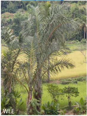
2 Raphia farinifera (raffia) cultivated outside park