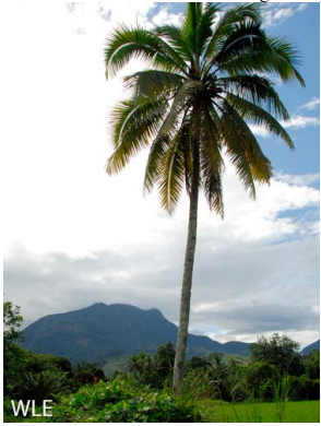
1 Cocos nucifera (coconut) cultivated outside park