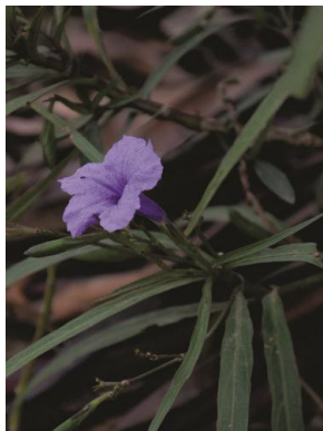
17 Ruellia simplex C. Wright