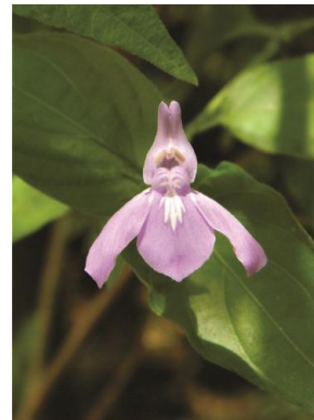
9 Justicia thunbergioides (Lindau) Leonard