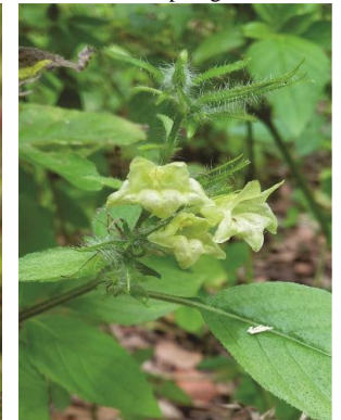
15 Ruellia ochroleuca Mart. ex Nees