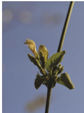
8 Justicia glaziovii Lindau