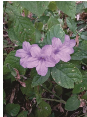
13 Ruellia geminiflora Kunth