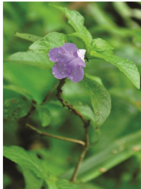
12 Ruellia bahiensis (Nees) Morong