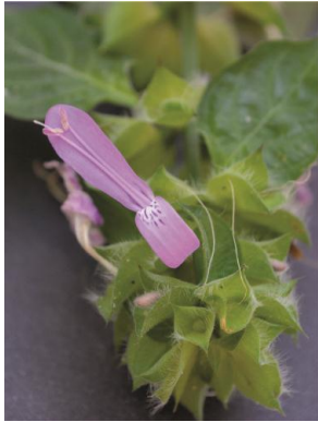
1 Dicliptera mucronifolia Nees