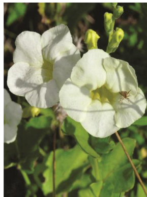
18 Asystasia gangetica (L.) T. Anderson (CULTIVADA)