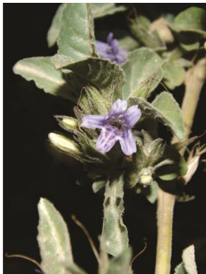
6 Hygrophila paraibana Rizzini