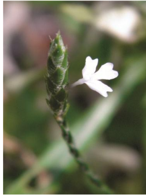
2 Elytraria imbricata (Vahl) Pers.