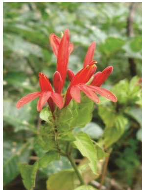
7 Justicia aequilabris (Nees) Lindau