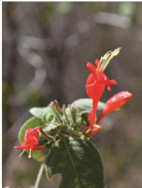
11 Ruellia asperula (Mart. ex Ness) Lindau