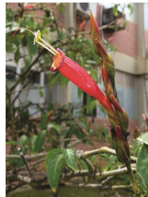
19 Sanchezia oblonga Ruiz & Pav. (CULTIVADA)