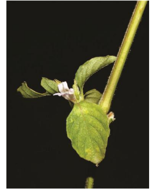
5 Hygrophila costata Nees