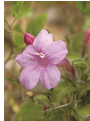
14 Ruellia inundata Kunth