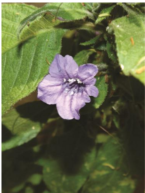
16 Ruellia paniculata L.