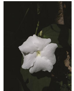
20 Thunbergia fragrans Roxb. (CULTIVADA)