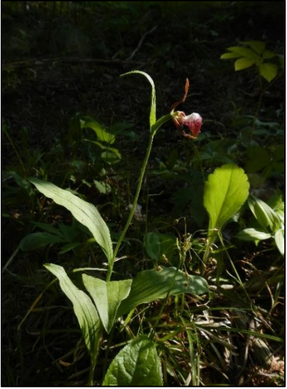
Figure 3. Flowering Cypripedium

Upland habitats are also important for ram's-head lady's-slipper, and they vary quite a bit. Some are in mesic broad-leaved forests, but most are in mature pine forests of natural origin, especially those dominated by jack pine or red pine. In this type of habitat, the rooting zone of ram's-head lady's slipper is usually in sandy soil or in thin, mineral soil over bedrock. Although these soil types are considered "droughty", the rooting zone of ram's-head lady's-slipper would, under most conditions, be relatively cool and moist. This is because the tree canopy creates a humid, shady environment, and the ground itself is covered by mosses and lichens. Populations of ram's-head lady's-slipper in upland habitats are typically larger and denser than those in swamps and sometimes contain several hundred stems.