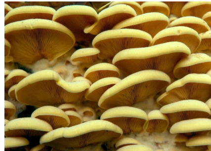
Orange Mock Oysters

Class: Gasteromycetes - spores produced internally, not forcibly discharged, instead disintegrating