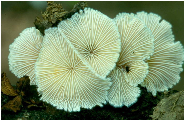
Common Split Gill