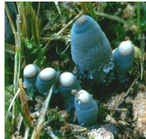
Dead Man's Fingers

Phylum: Basidiomycota - Spores produced on specialized cells called basidia (also contains rusts & smuts)