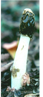
Pitted White Stinkhorn