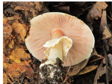
Meadow Mushroom with veil and gills free