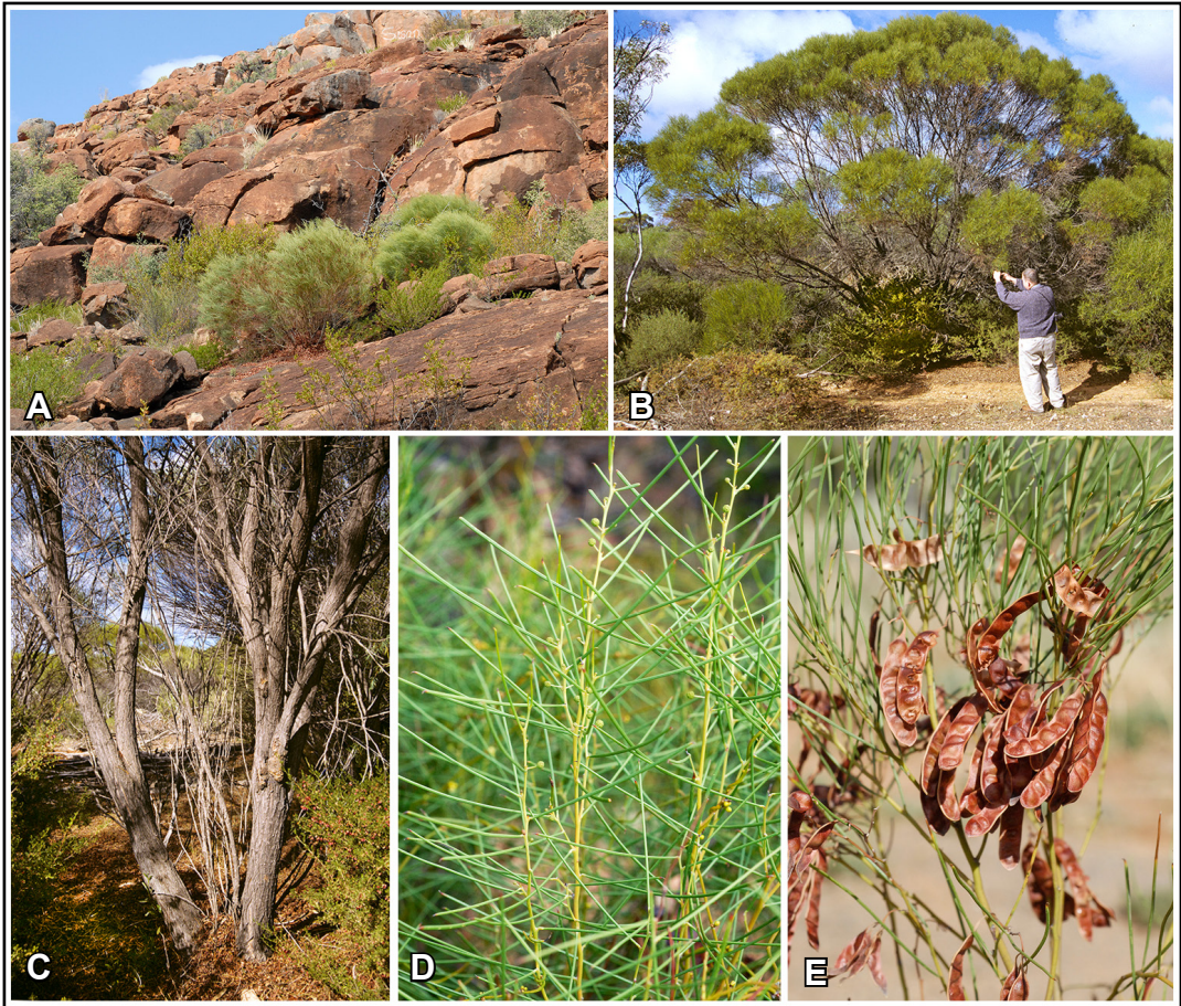
Figure 6. Acacia fraternalis . A – habitat (Jimberlana Hill); B – habit (with David Seigler, U.S.A.); C – stem base; D – phyllodes; E – pods.

collection apparently represents a disjunct occurrence of the species. Herbarium labels suggest that A. fraternalis is at least sometimes common in the places where it occurs.