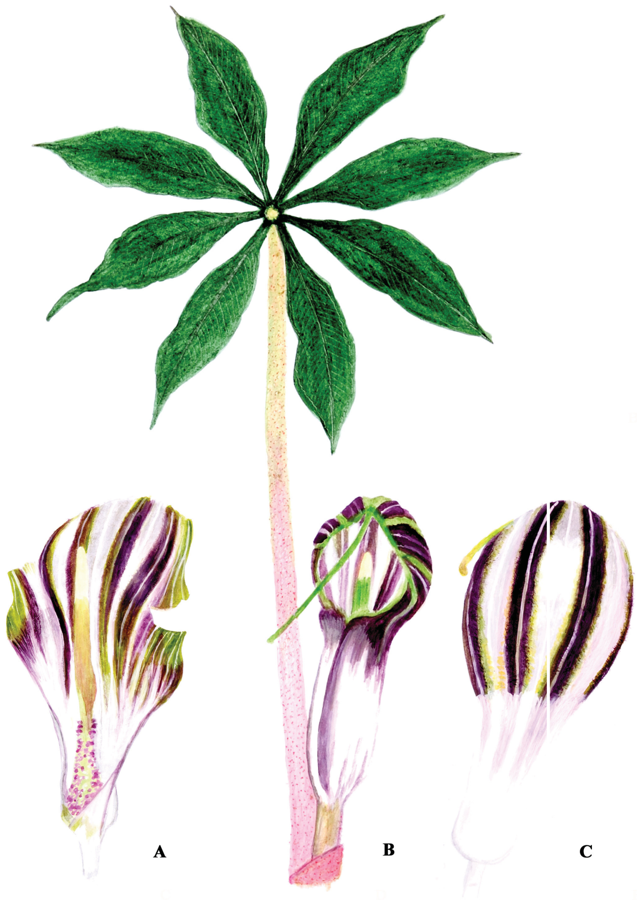
FIGURE 2. Colour illustration of Arisaema translucens C.E.C. Fischer. A. Habit; B. & C. Inflorescence.