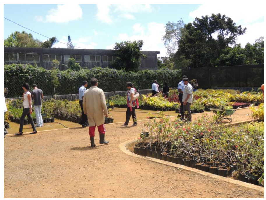
Sale of plants to the public at Curepipe Nursery Sales Depot