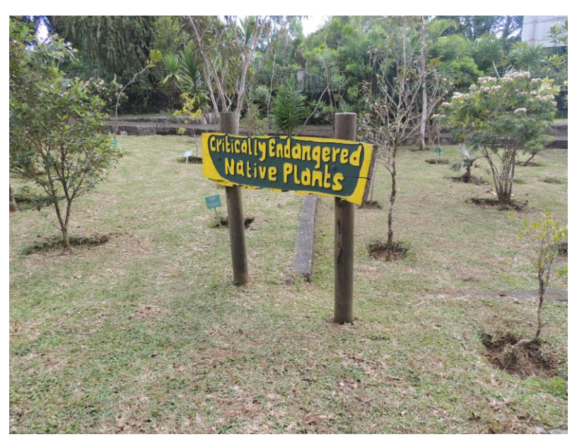
Monvert Visitor's Centre

Maintenance weeding was effected in native forests at S.L Monvert where uprooting and removal of Invasive Alien Species were effected on about 8 hectares. Moreover, monitoring of some critically endangered plants was carried out on site. This Service also undertook the restoration of degraded endemic forests under the Protected Area Network (PAN) project, funded by the UNDP.