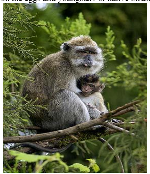
Macaca fascicularis (monkey)

3.3 Monkeys ( Macaca fascicularis ) are still causing damage to plantations by ringbarking trees. In the absence of cyclones, their population is on the rise. They continue to be a major pest in the native forests by eating the fruits and seeds of forest trees and preying on the eggs and youngsters of native birds.