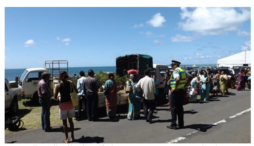
Free distribution of plants to encourage tree planting

In the context of the International Day of Forests 2016, the Forestry Service, under the aegis of the Ministry of Agro Industry and Food Security, officially launched the National Tree Planting Programme at Pointe du Diable, Petit Sable on 21 March 2016. To mark the event, different activities and awareness campaigns were initiated by the Forestry Service, including free distribution of pamphlets, posters and plants.