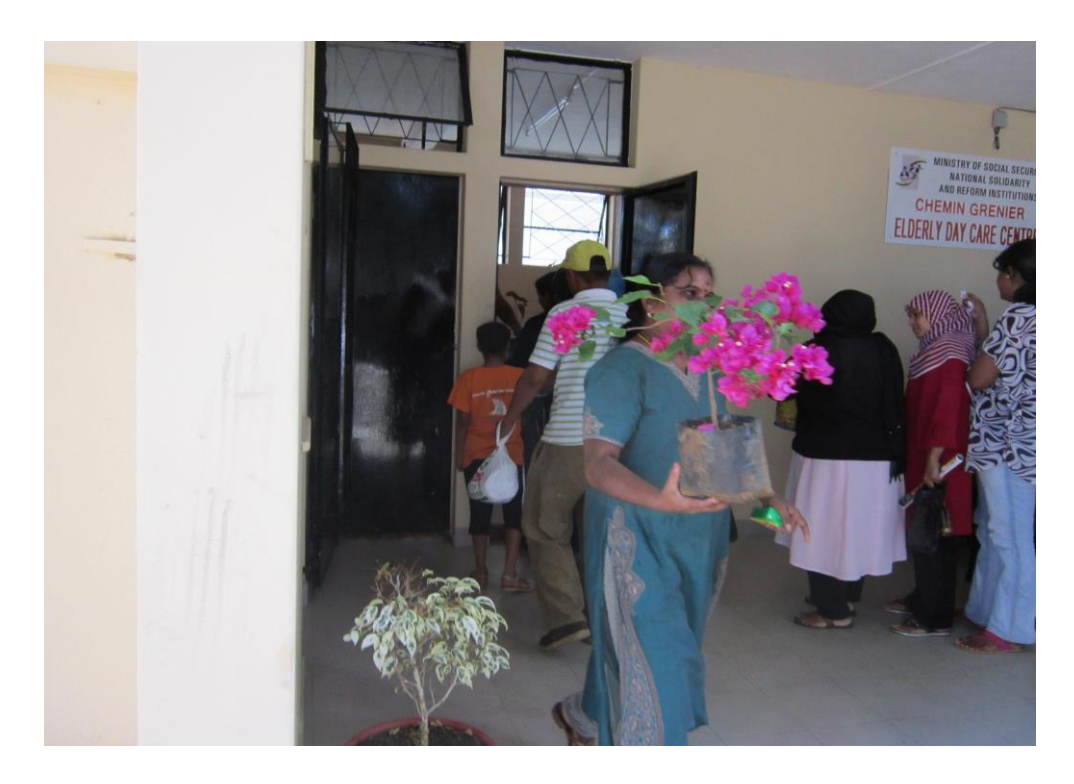
Free distribution of plants under the National Tree Planting Campaign