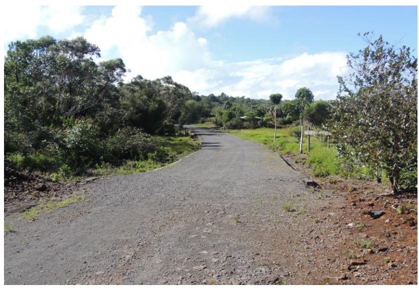
Monvert Nature Walk

7.2 The Vallée D'Osterlog Endemic Garden of an extent of 275 hectares extends from the bottom of Vallée D'Osterlog to the Créole Mountain Range, including Mountain