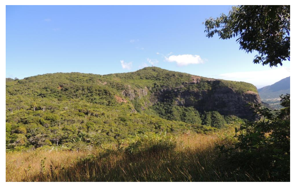
S.L Le Cabinet