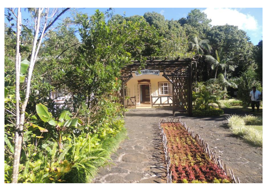
Sophie Visitor's Centre

During the year 2016, some 35,484 people visited these Nature Walks and some 74 guided tours by Forest Officers were proposed to visitors.