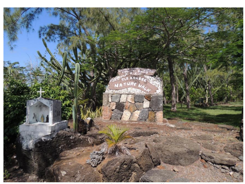
Ile d'Ambre Nature Walk

Monvert Nature Walk comprises a Visitors Centre and a fernery where a live display of native ferns and orchids can be contemplated. Sophie Visitor's Centre also includes a Forest Museum, where ancient forestry tools and accessories are displayed.