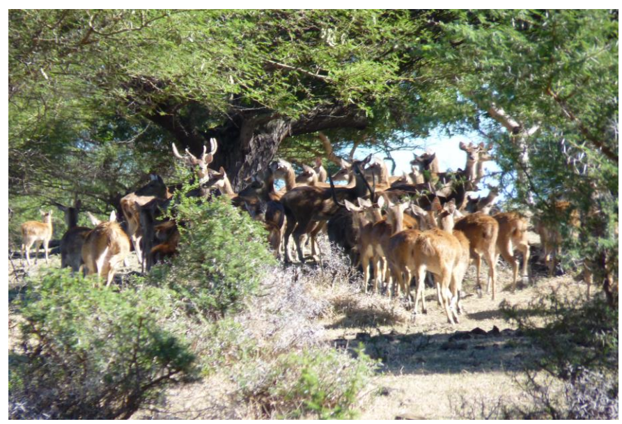
Java deer (Cervus timorensis russa)

80,000 heads, including those that are reared in intensive deer farms. The average carrying capacity is around 2.6 deer/hectare. The lessees spend considerable sums on fencing, gamekeepers and opening of paths. The additional protection thus afforded to the forests offsets the inconvenience of having to curtail some forest operations during the shooting season - from 1 June to 30 September of each year.