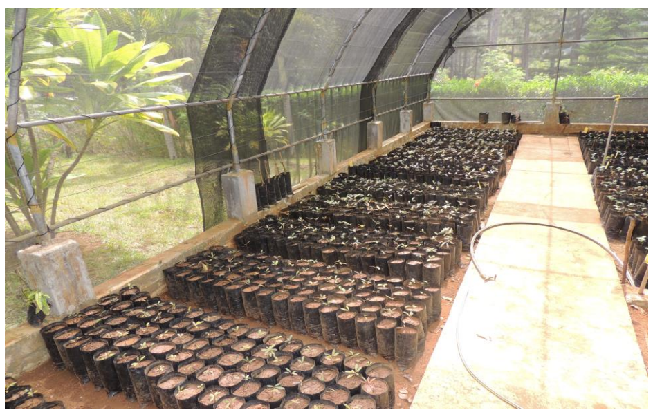
Raising of plants in shade house