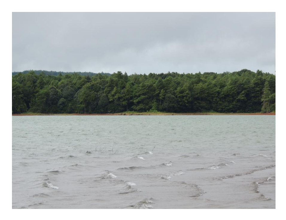
Catchment areas around Mare aux Vacoas reservoir