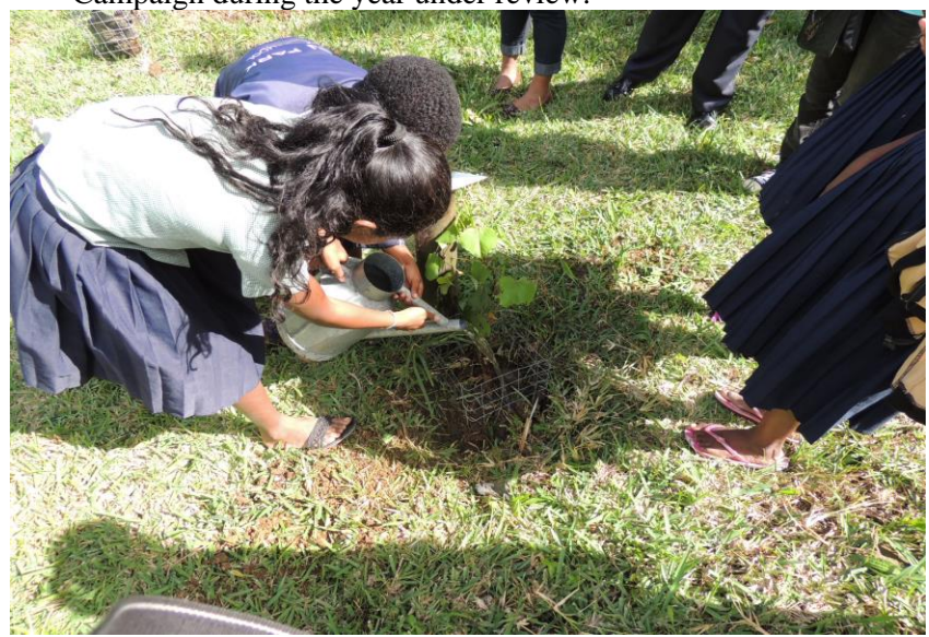
Sensitizing the younger generation on the importance of tree-planting

19,519 plants were issued free of charge under the National Tree Planting Campaign during the year under review.