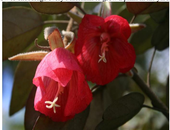
Our National Flower, Trochetia boutoniana

6.5 Trochetia boutoniana , (Boucle d'Oreille) a rare endemic species, is the National Flower of the Republic of Mauritius. This flower also appears on the various insignia that are conferred by the Republic of Mauritius. This species is being propagated with a view to encourage every Mauritian to grow a plant in his yard.