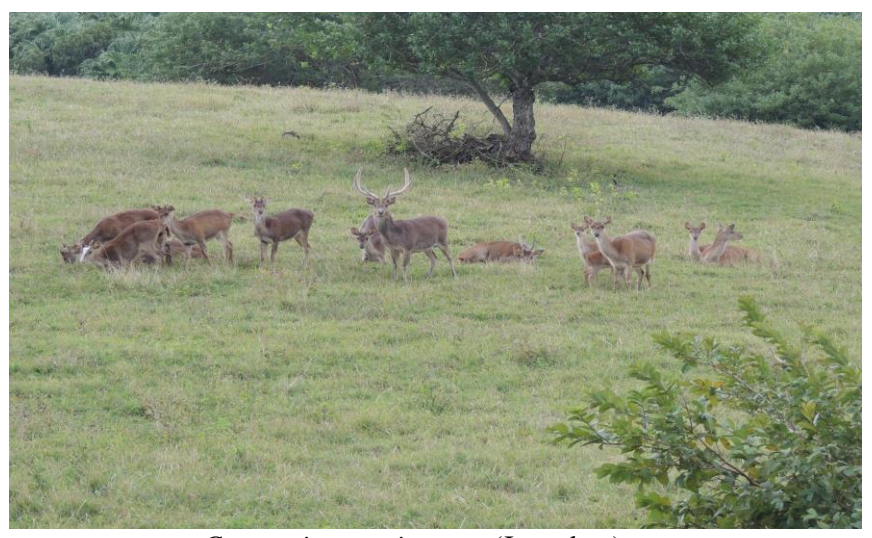
Cervus timorensis russa (Java deer)

It is worthy to note that considerable damage is caused to both planted and native forests by this activity, through ring-barking of adult trees and uprooting or trampling of seedlings. Frequent meetings are held with all concerned parties to ensure that deer ranching activities are carried out in a sustainable way with least impacts on the environment.