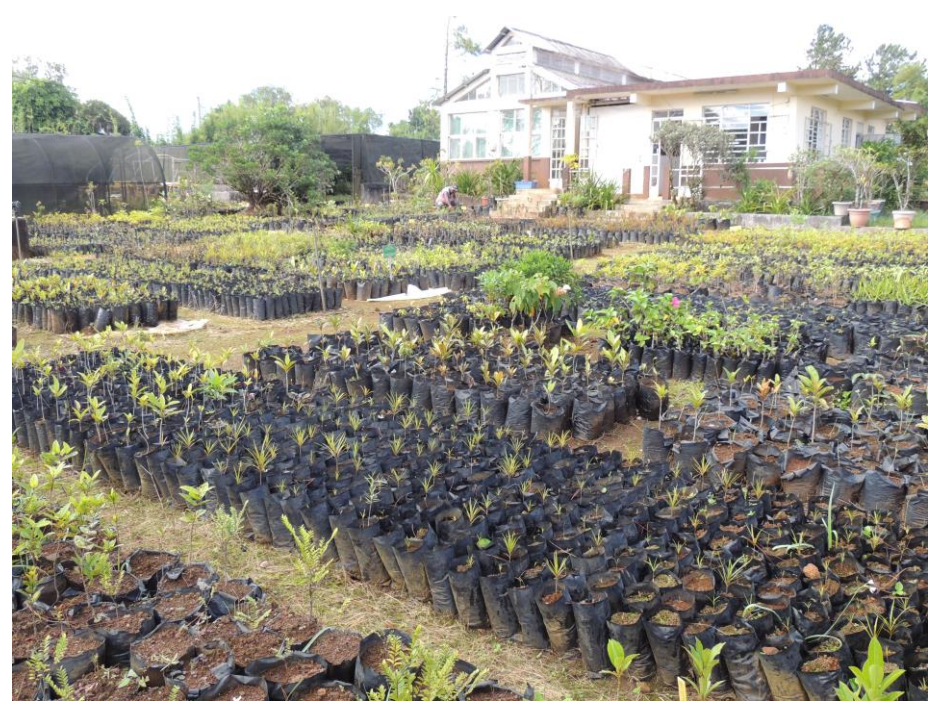
Native potted plants at the Greenhouse ready for planting