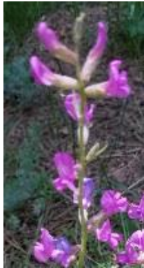
Locoweed ( Oxytropis lambertii ) To 16 inches tall June – August 7RP