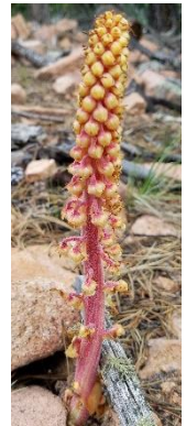
Pinedrops ( Pterospora andromedea ) To 3 feet tall June – Aug. 10RP