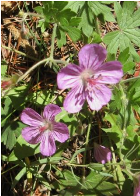
Wild geranium ( Geranium sp. ) To 12 inches tall June – August 6RP