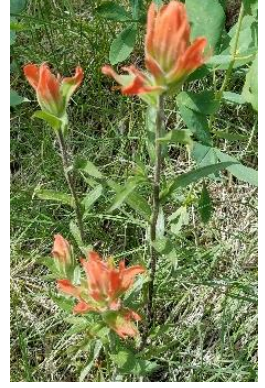
Scarlet paintbrush ( Castilleja minuata ) To 2 feet tall June – July 5RP