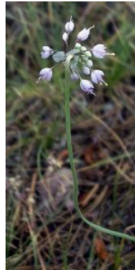
Nodding onion ( Allium cernuum ) To 18 inches tall June – August 9RP