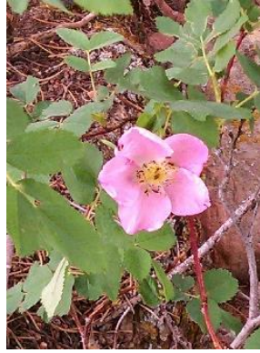
Wood's rose ( Rosa woodsia ) To several feet tall June – Aug. 4RP