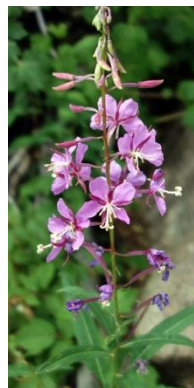
Fireweed ( Chamerion danielsii ) To 6 feet tall July – Sept 13RP