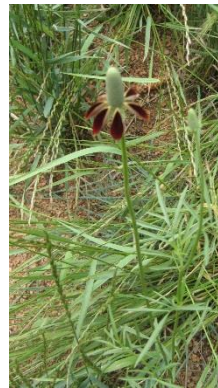
Coneflower ( Ratibida tagetes ) To 18 inches tall July – August 14RP