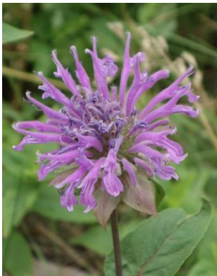
Beebalm ( Monarda fistulosa ) To 3 feet tall June – August 11RP