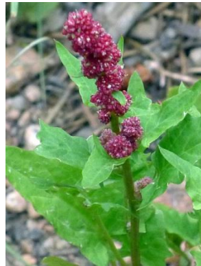
Strawberry blite ( Chenopodium capitatum ) To 16 inches tall June – Aug. 8RP