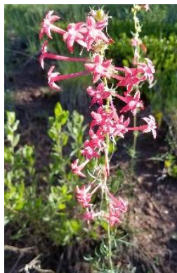
Scarlet gilia ( Ipomopsis aggregata collina ) To 5 feet tall June – Sept 12RP