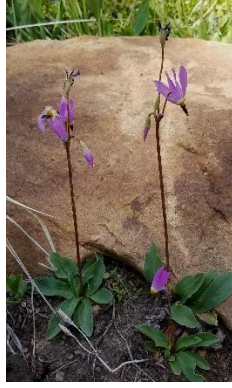
Shooting star ( Dodecatheon pulchellum ) To 16 inches tall May – July 3RP