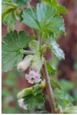
Wax currant ( Ribes cereum ) To 5 feet tall May – June 2RP