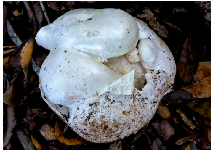
Eight-headed Amanita ocreata found by Macro Fungi of the Channel Islands (CA) project.