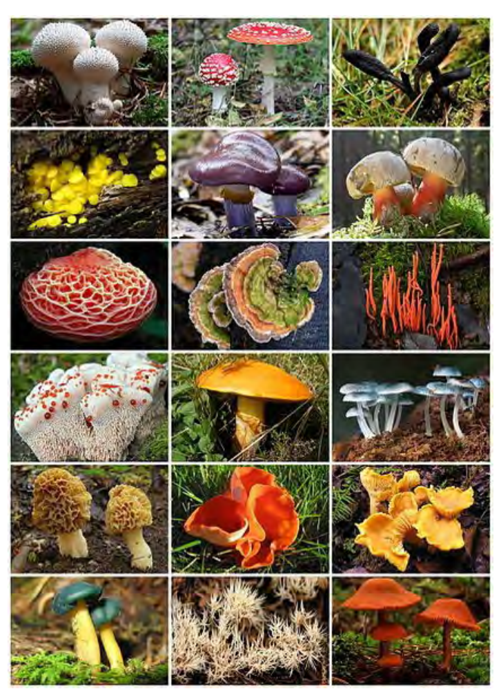
Fungi are a hyper-diverse kingdom.

a way of tracking species that are harbingers of climate change. These data could support plans and policies for land management and habitat restoration, as well as Red List species submissions. We might help connect clubs and individuals with organizations needing fungal surveys for threatened habitats. We could partner with scientists doing research on rare or threatened species or the impact of climate change on the natural world, and supply an army of foot soldiers to collect and document them.