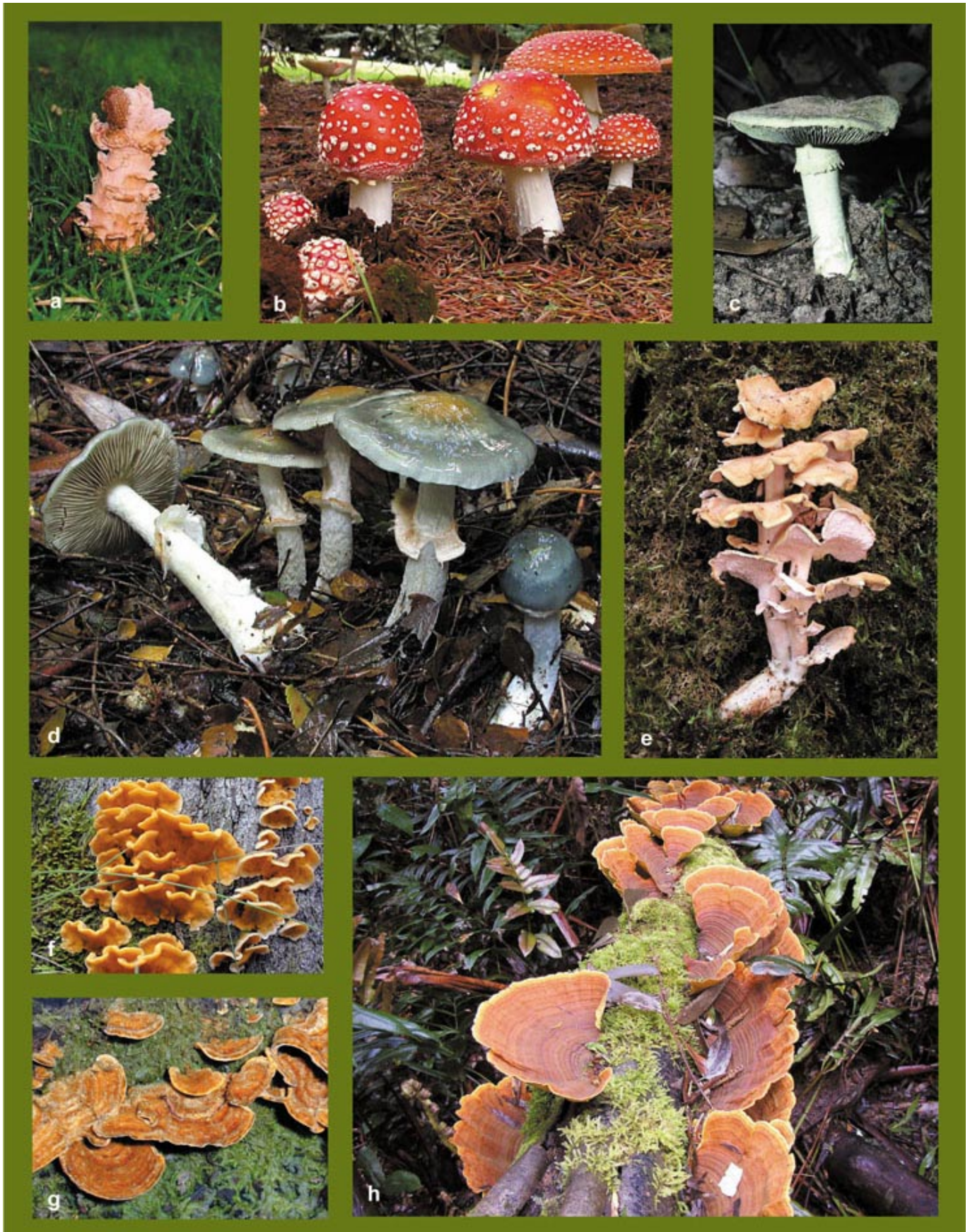
PLATE 3. a: Amanita muscaria - distorted form, b: normal form, c: Amanita chlorophylla, d: Rozites metallica, e: Podoserpula pusio, f: Stereum hirsutum - lower surface, g: upper surface, h: Stereum ostrea.