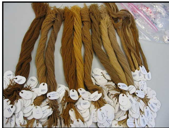
The three species of Pisolithus produced different shades of brown. Workshop run by Kirsti Palmén, Finland.

On one of the field excursions, my group was thrilled to find a number of different wax cap fungi near a carpet of translucent, maroon Corybas recurvus (Helmet orchids) in the sand dunes. To top off a most satisfying morning, we went home via the Ocean Beach lookout, where to my great surprise, a large collection of battleship-grey Banksiamyces was discovered on fallen Banksia quercifolia cones! I have not seen it in WA before, although I do believe it has been found somewhere north of Esperance.