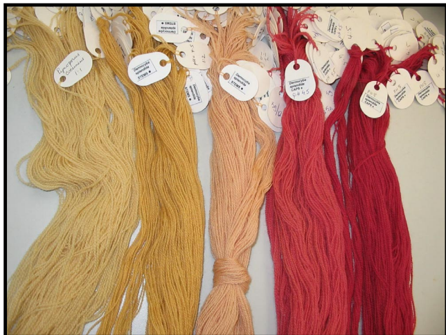
Various dye colours obtained from caps and stems of Dermocybe splendida (used separately; with varying pH), on alum mordanted wool.

The 11 th International Fungi and Fibre Symposium (IFFS) ended on July 18 th . A more detailed description of the event, with loads of images, will appear (at some time in the future!) on Dorothy Beebee's 'Art of Mushroom Dyeing' website: www.sonic.net/dbeebee/ .