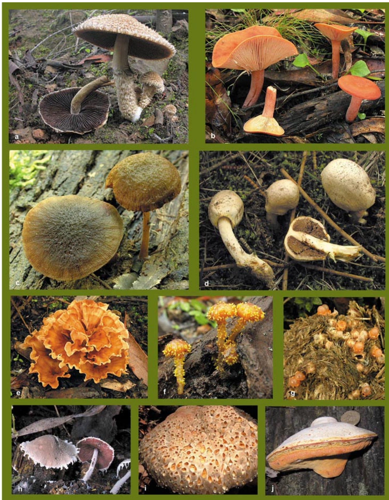
PLATE 1. a: Psathyrella asperospora, b: Lactarius eucalypti, c: Simocybe phlebophora, d: Endoptychum wariatodes, e: Podoscypha petalodes, f: Barya agaricicola, g: Sphaerobolous stellatus, h: Melanophyllum haematospermum, i: Piptoporus australiensis - water droplets on upper surface, j: Piptoporus australiensis.