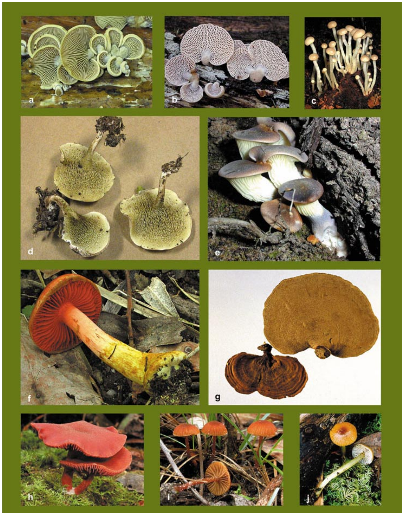
PLATE 2. a: Panellus stypticus, b: Dictyopanus pusillus, c: Vibrissea dura, d: Beenakia dacostae, e: Omphalotus nidiformis, f: Dermocybe splendida, g: Microporus affinis, h: Tubaria rufofulva, i: Tubaria sp. j: Hygrocybe gramicicolor.