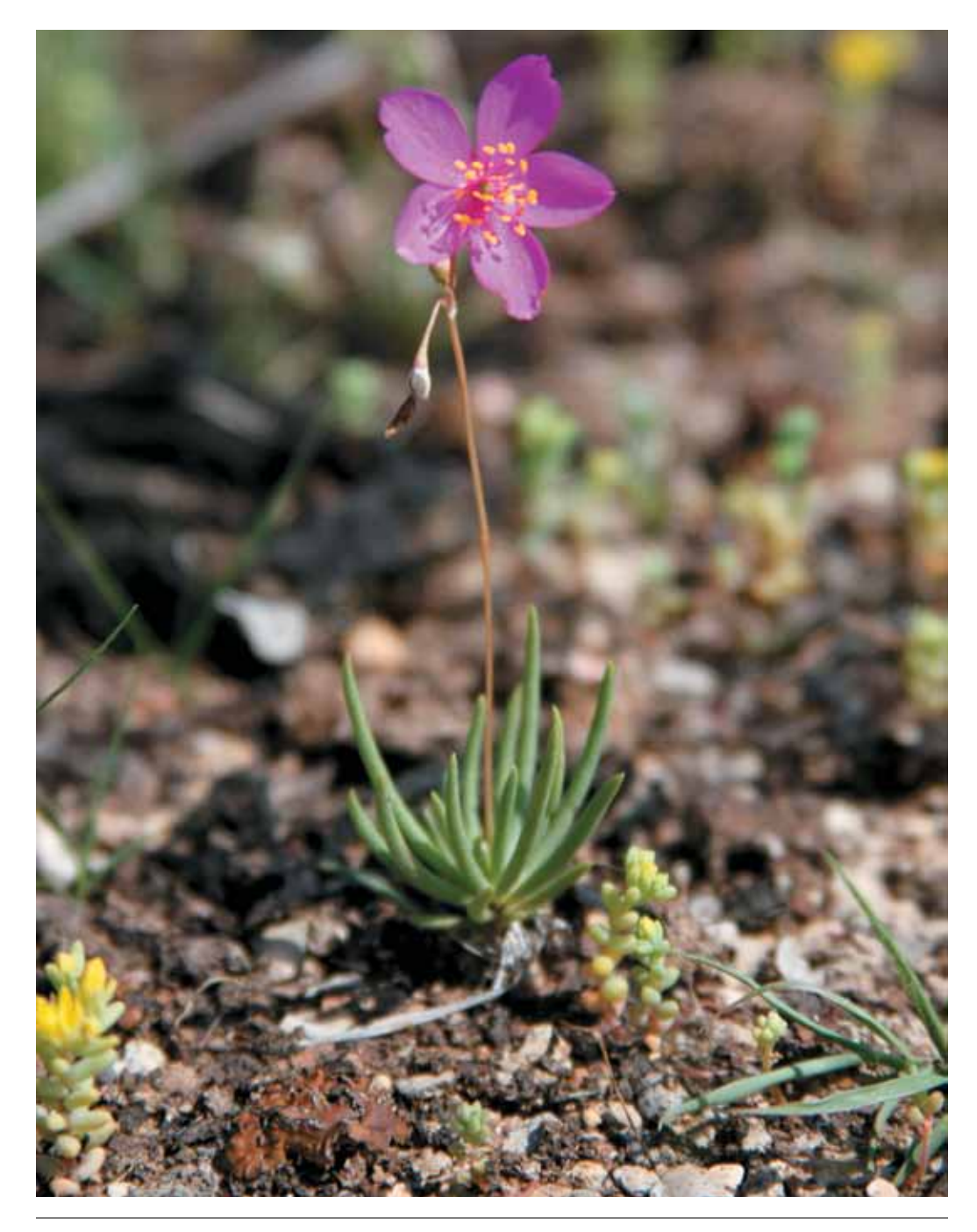
Fig. 1. Phemeranthus calcaricus in Walnut Glade north of Weatherford, Parker Texas, 18 May 2011, Rebecca K. Swadek.