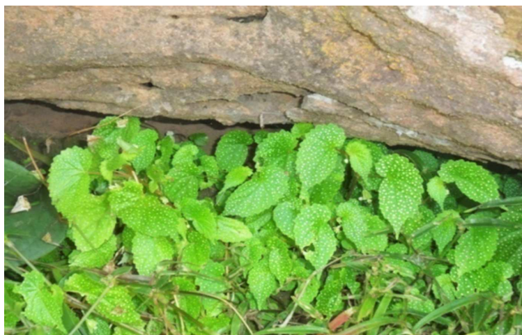
Photo 2. Cave, Comoé province (Takalédougou).

The main characteristics of caves are their almost inexistent soil cover, their shadow and their humidity which predominates during rain season and partly in dry season (Photo 2). Caves occur on both granitic and sandstone inselbergs. Plant index species for caves are Begonia rostrata Welw. Ex Hook.f. and Batopedina tenuis (A. Chev. ex Hutch. & Dalziel) Verdc (Appendix Table). Cyperaceae is the most dominant family, followed by Begoniaceae and Rubiaceae.