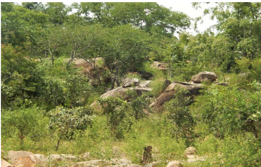
Photo 11. Shrub savannah, Ganzourgou province (Wayen).