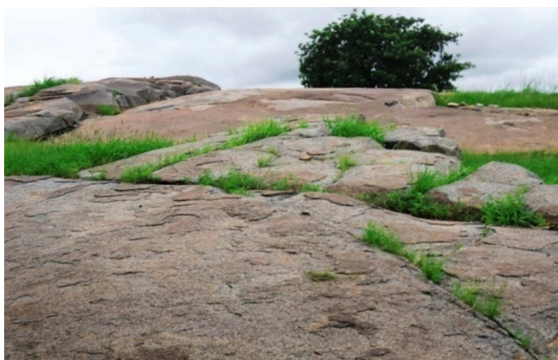
Photo 3. Crevice, Sanmatenga province (Dondolé).

Crevice is a fissure in rocks (Photo 3) that are present on granitic and sandstone inselbergs. They can be characterized by soil deposits whose thickness varies with the size of crevice. The soil confers certain humidity within crevices and permits establishment of herbs, mainly Poaceae. Woody species are often found, especially in the larger cracks where soil is thicker. Twenty-eight (28) plant species have been inventoried within these habitats. They split up into 23 genera and 12 families. The mean number of species is 4,60 \pm 2,41 . Shannon's diversity index is 1,49 \pm 0,43 and equitability index is 1 \pm 0,00 (Tab. 1). The index species for crevices are Andropogon gayanus Kunth, Striga gesnerioides (Willd.) Vatke and Tephrosia linearis (Willd.) Pers (Appendix Table). The most dominant families in crevices are Poaceae (21,43 %), Fabaceae-Faboideae (17,86 %), Cyperaceae (14,29 %) and Rubiaceae (14,29 %) (Tab. 2). Therophytes (46,43 %), Phanerophytes (25,00 %) and Hemicryptophytes (21,43 %) are the dominant life forms (Tab. 3). The most abundant phytogeographical types belong to Sudano-Zambesian (28.57 %), Afro-Tropical (25,00 %), Pantropicals (14,29 %) and Sudanians (14,29 %) (Tab. 4).