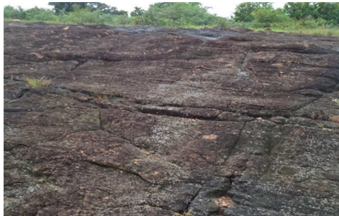
Photo 1. Cryptogamic crusts, Houet province (Koro).

The surface of granitic and sandstone rock formations is characterized by the absence of soil (Photo 1). However, it is covered by lichens and cyanobacteria which are most frequently responsible for rock surface coloration. Regarding the lichens, the genus Peltula is the most common, whereas Stigonema and Scytonema are the most common cyanobacteria group in this habitat.