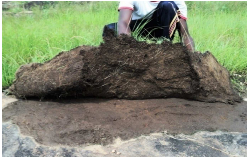
Photo 7. Afrotrilepis pilosa mats, Houet province (Koro).