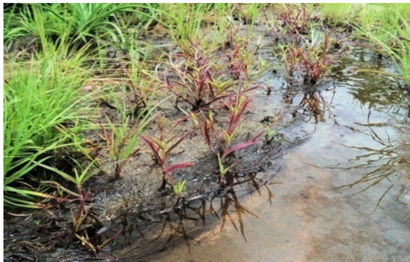
Photo 9. Ephemeral flush vegetation, Houet province (Koro).

Ephemeral flush vegetation differ from dry grasslands in that they have deeper soils ( 7,38 \pm 3,34 cm) saturated with water (Photo 9) and that they occur on both granitic and sandstone formations. Seventy-five (75) plant species distributed in 52 genera and 26 families have been listed in this habitat. The mean species number, Shannon's diversity index and equitability index are 5,50 \pm 2,47 ; 1,75 \pm 0,31 and 1 \pm 0,00 , respectively (Tab. 1). Index species are Bacopa floribunda (R.Br.) Wettst., Drosera indica L., Lindernia schweinfurthii (Engl.) Dandy. and Ludwigia abyssinica A.Rich (Appendix Table 1). The dominant families are Poaceae (26,67 %), Cyperaceae (24,00 %), Rubiaceae and Fabaceae-Faboideae (5,33 % each) (Tab. 2). Therophytes (56,00 %), Hemicryptophytes (18,67 %) and Geophytes (8 %) are the most dominant life forms (Tab. 3). The most abundant phytogeographical types are Afro-Tropicals (32,43 %), Pantropicals (24,32 %) and African Multiregional (16,22 %) (Tab. 4).