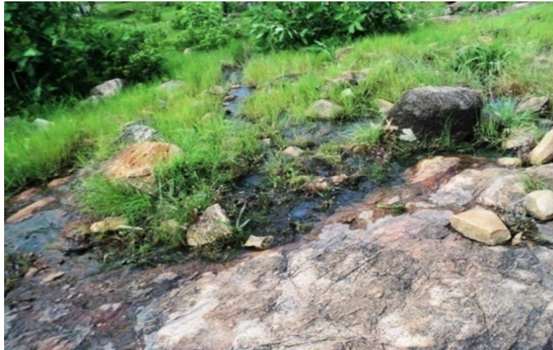
Photo 6. Wet slabs, Houet province (Kotédougou).