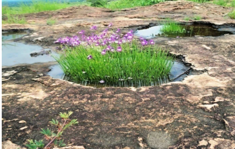
Photo 5. Rock pools, Comoé province (Takalédougou).