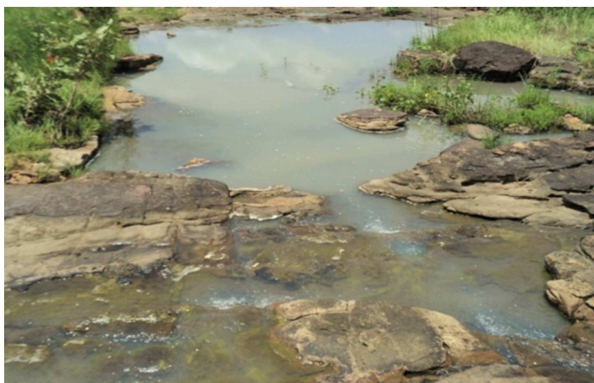
Photo 4. “Permanent” runoff habitats, Houet province (Koro).

These habitats are characterized by a runoff of water during the whole wet season and parts of the dry season (Photo 4). The physiognomy of the vegetation close to the running water is eponymous for the rupicolous formations on inselbergs. The essential characteristic of these habitats represent mats of algae underneath the running water. Permanent runoff habitats are found exclusively on sandstone inselbergs in Burkina Faso. The floristic richness is within 31 species in 26 genera and 16 families. The mean number of species, Shannon’s diversity index and equitability index are 15,00 \pm 7,07 ; 2,65 \pm 0,49 and 1 \pm 0,00 , respectively (Tab. 1). Index species are Justicia tenella (Nees) T Anderson. and Rhamphicarpa fistulosa (Hochst.) Benth (Appendix Table 1). The most dominant families are Poaceae (22,58 %), Cyperaceae (12,90 %) and Fabaceae-Faboideae (12,90 %) (Tab. 2). Therophytes (41,94 %), Hemicryptophytes (22,58 %) and Geophytes (12,90 %) are the dominant life forms in order of importance (Tab. 3). The most abundant phytogeographical types belong to Afro-Tropicals (38,71 %), Pantropicals (22,58 %) and Sudanians (16,13 %) (Tab. 4).