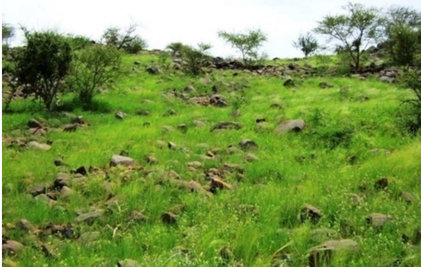
Photo 10. Grass savannah, Oudalan province (Kollel). Photo E. Tindano (2011).

(Tab. 2). The dominant life forms are Phanerophytes (41,40 %), Therophytes (37,03 %) and Hemicryptophytes (7,58 %) (Tab. 3). Sudano-Zambesians (28,15 %), Afro-Tropicals (23,17 %) and Pantropicals (16,42 %) are the most abundant phytogeographical types (Tab. 4).