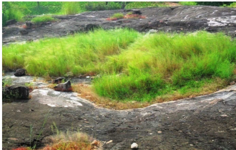
Photo 8. Dry grassland, Sissili province (Bozo).

Dry grasslands with shallow soils are, as their name suggests, characterized by an average soil depth of 4,08 \pm 2,27 cm (Photo 8). Periodically, they are dampened by runoff water during wet season. They are found on both granitic and sandstone formations. These habitats comprise 58 plant species distributed in 45 genera and 21 families. Mean species number is 10,00 \pm 2,65 . Shannon's diversity index and Pielou's equitability index are 0,60 \pm 0,47 and 0,67 \pm 0,49 (Tab. 1). Index species of dry grasslands are Cyperus buchholzii Boeck. and Synedrella nodiflora Gaertn (Appendix Table). The most dominant families are Poaceae (25,86 %), Cyperaceae (24,14 %) and Fabaceae-Faboideae (10,35 %) (Tab. 2). Dominant life forms in dry grasslands are Therophytes (57,89 %), Hemicryptophytes (15,79 %), followed by Geophytes and Phanerophytes (8,77 % each) (Tab. 3). Afro-tropicals (36,21 %), Pantropicals (13,33 %) and Paleotropicals (13,33 %) are the most abundant phytogeographical types (Tab. 4).