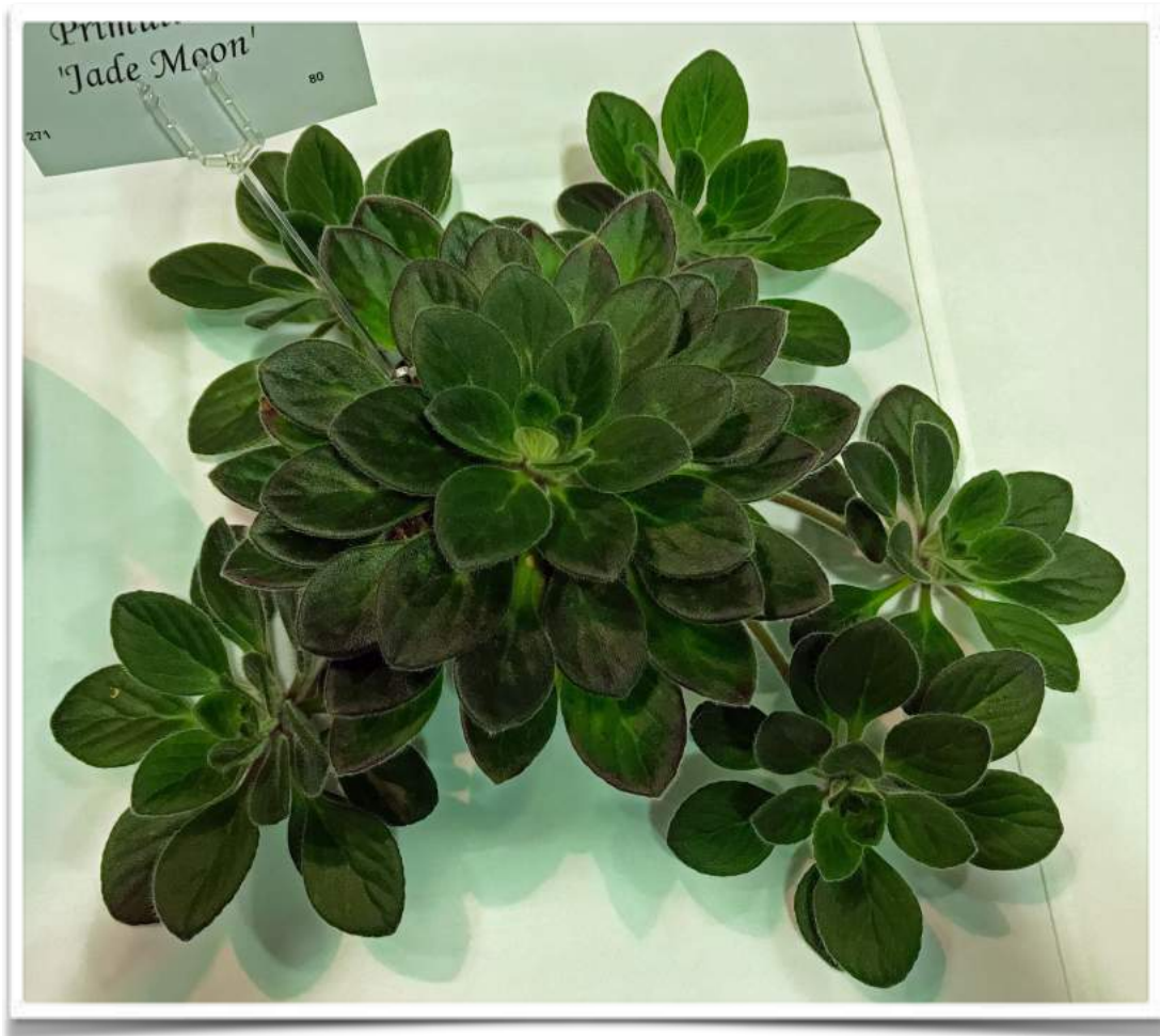
Primulina 'Jade Moon' - Dolores Gibbs