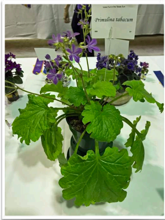
Primulina tabacum