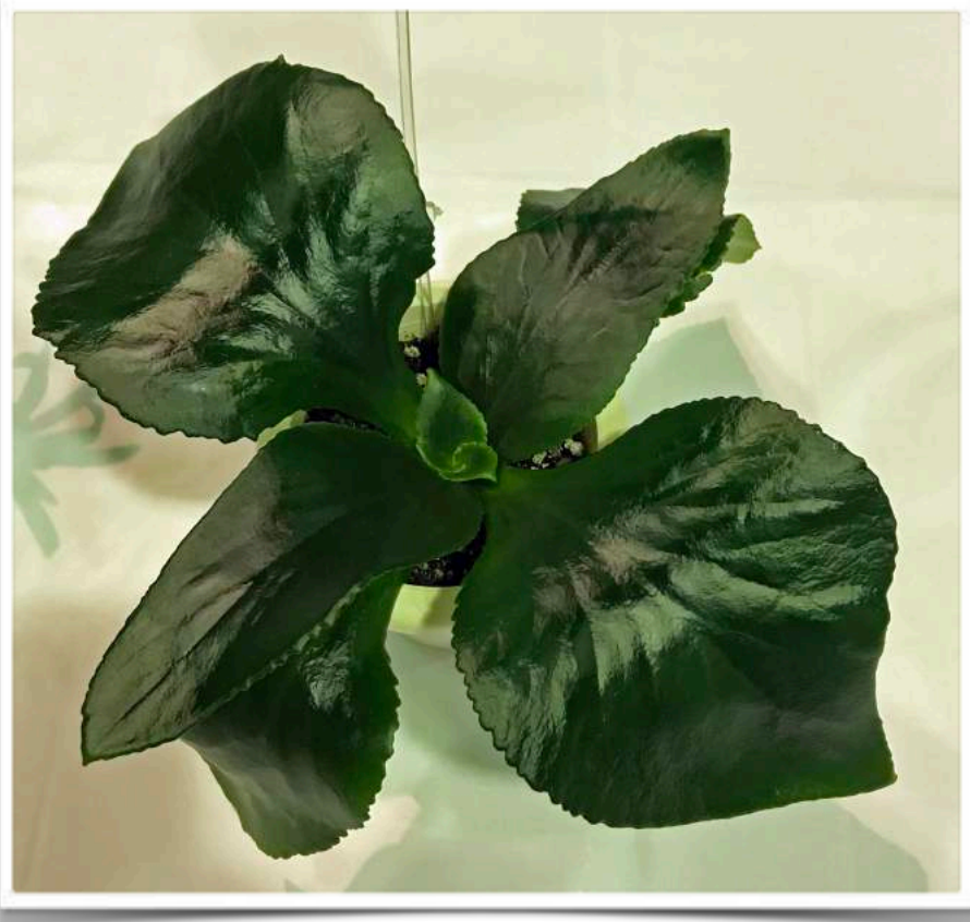
Primulina atropurpurea