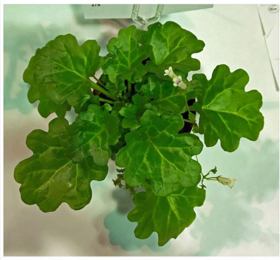
Primulina maciejewskii