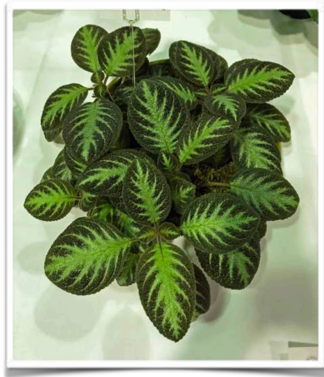
Episcia 'Pink Panther' Geneva Stagg