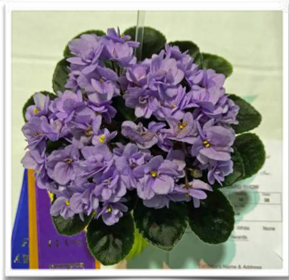
Saintpaulia 'Cool Blue' Kathy Lahti