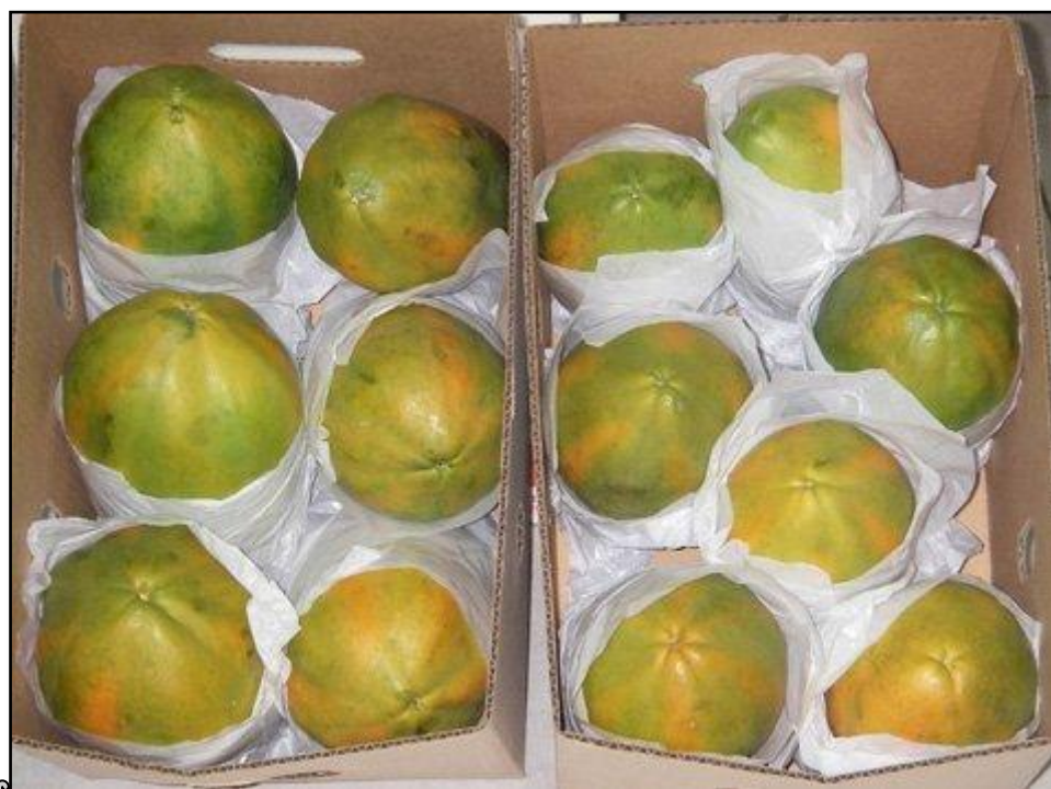
Pawpaw ready for harvesting

The bottom of the crate should be filled with shredded paper to cushion the fruits. Before packing, the peduncle should be cut to about 5 mm and the fruits packed in one layer with the peduncle facing the bottom so that the papain drains and gets absorbed by the shredded paper. The field crates containing the fruits should be left in shaded conditions protected from the sun and rain. You should never use mesh bags, sacks or baskets for pawpaw transport due to the high susceptibility to bruising the fruit.