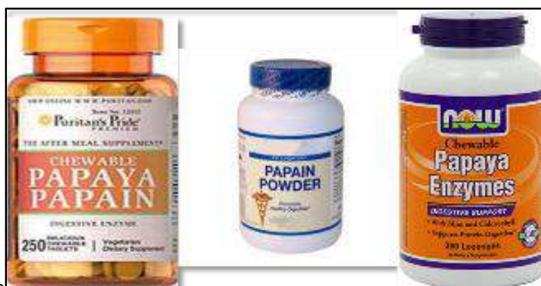
Different papain products in the market

Papain is also used in the manufacture of chewing gum, cosmetics, for degumming natural silk and to give shrink resistance to wool. It is also used in pharmaceutical industries, textile and garment cleaning paper and adhesive manufacture, sewage disposal etc.