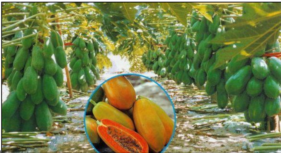
The Hybrid Red-Lady variety Pawpaw

I should have mentioned by now that it is a self pollinating variety just like the other two we have discussed above. That means as a farmer, you do not have the burden of keeping male trees that do not produce fruits in your orchard.